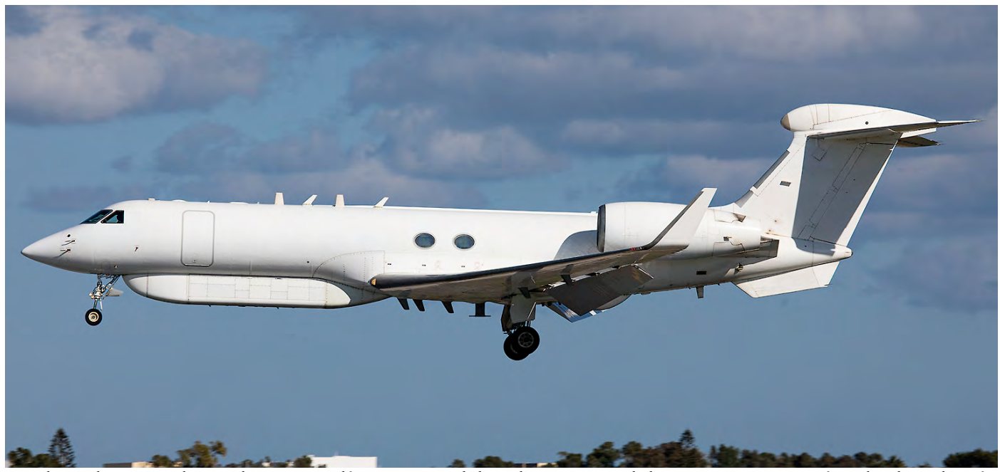
Together with G550 537, this Israeli Air Force Gulfstream G-V Nachshon-Shavit 679 Special Electronic Missions Aircraft used Malta-Valetta for apporach practicing. With that country having a special place in many hearts, it seems to be no problem that no additional markings were added to the all white paint scheme. (Malta-Valetta, 7 January 2020, Shaun Psaila)