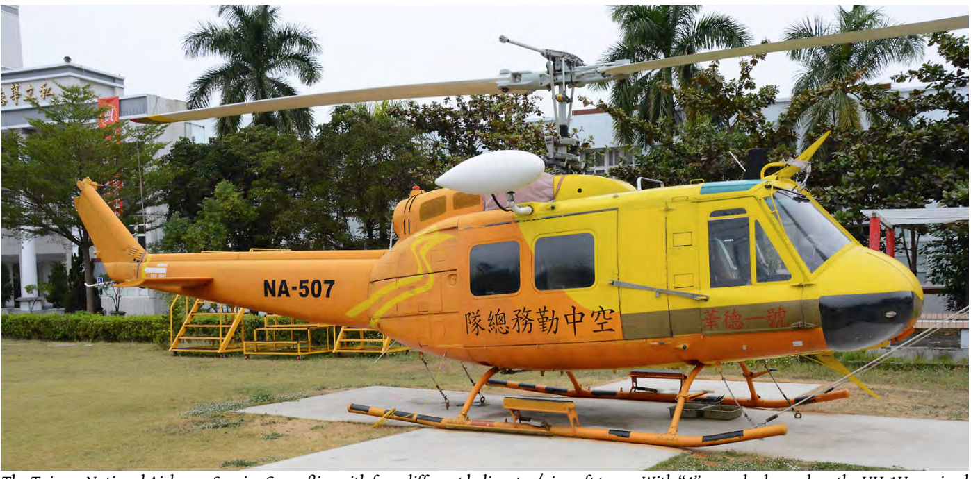
The Taiwan National Airborne Service Corps flies with four different helicopter/aircraft types. With "4" an unluck number, the UH-1H received serials in the 500 series, like this NA-507. (Kaohsiung, 4 December 2019, Raymond van Dijkhuizen)