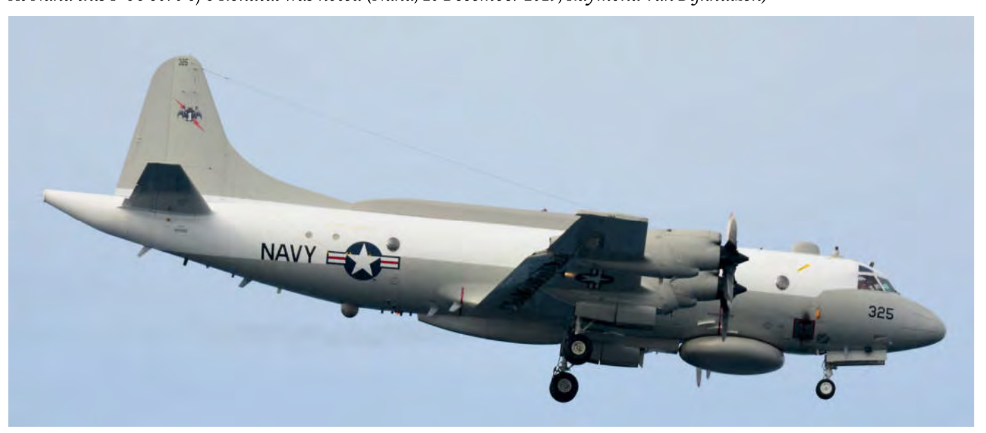
At Kadena some USAF units are based, so it was a surpise to see this EP-3E 157325/325 of VQ-1 'World Watchers' arriving. (Kadena, 11 December 2019, Raymond van Dijkhuizen)