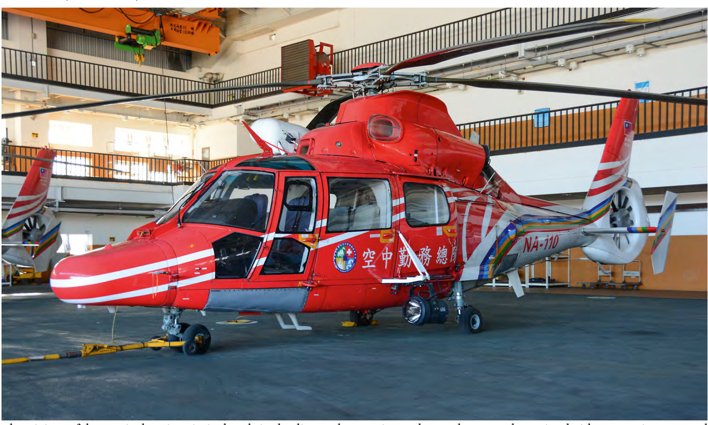
The ministry of the Interior has six units in three brigades dispersed over Taiwan. They are known as the National Airborne Service Corps and are used for a variety of tasks including Search and Rescue and aerial fire fighting. Dauphin NA-110 is stationed at Taichung. (14 December 2019, Raymond van Dijkhuizen)