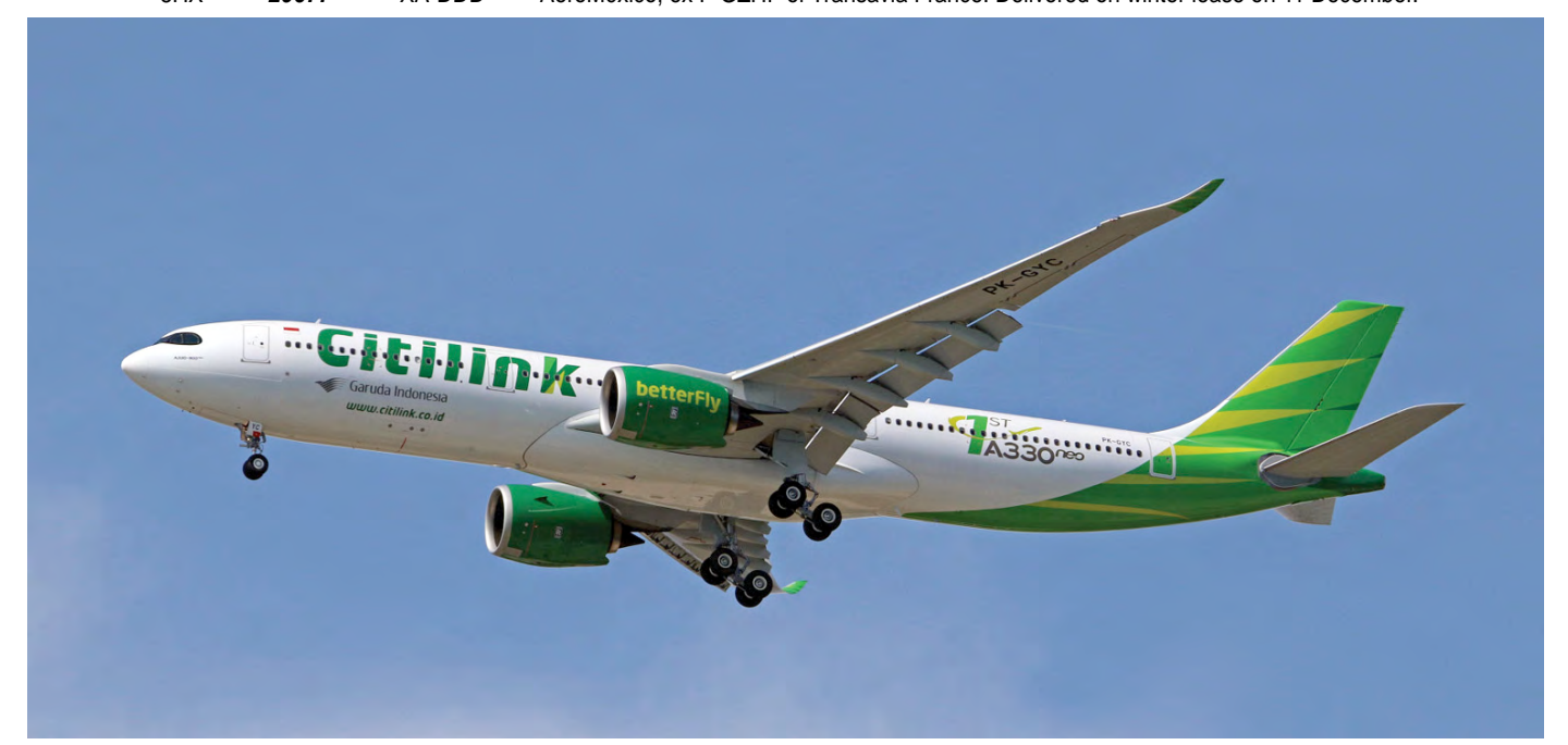
In Scramble 488 we placed a picture of a Garuda A330neo (page 41). In the photo caption we mentioned that a few of the sixteen A330neos Garuda has ordered would be delivered to their low cost daughter Citilink. PK-GYC was the first A330neo in the green Citilink colours. It was orginally built for WOW air and already painted in the purple WOW colours After a repaint it was delivered to Indonesia on 3 December 2019. (Denpassar, 30 December 2019, Pascal Simon)