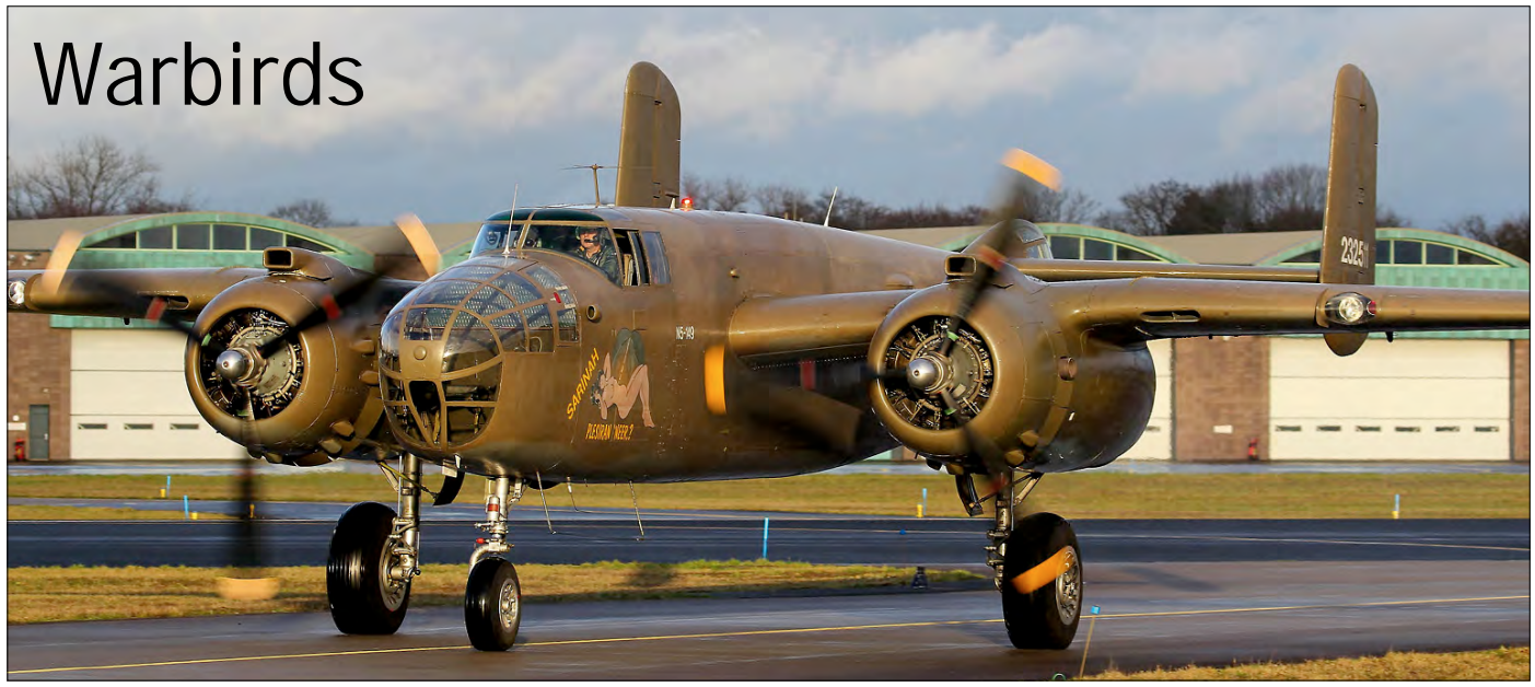
With the sale of Catalina PH-PBY to the Collings Foundation in the USA, North American Mitchell PH-XXV is currently the largest warbird in the Netherlands. After three years on the ground, it made its first flight from Gilze-Rijen, the homebase of its owner, the Royal Netherlands Air Force Historic Flight on 31 October 2019. The bomber flies in the colours of a Royal Netherlands East Indies Air Force Mitchell with serial N5-149/232511, named 'Sarinah', although it was actually built for the USAAF as B-25J 44-29507. 'Sarinah' is seen here taxiing in after a successful engine run on 14 December 2019. (Gilze-Rijen, Niels van Erck)