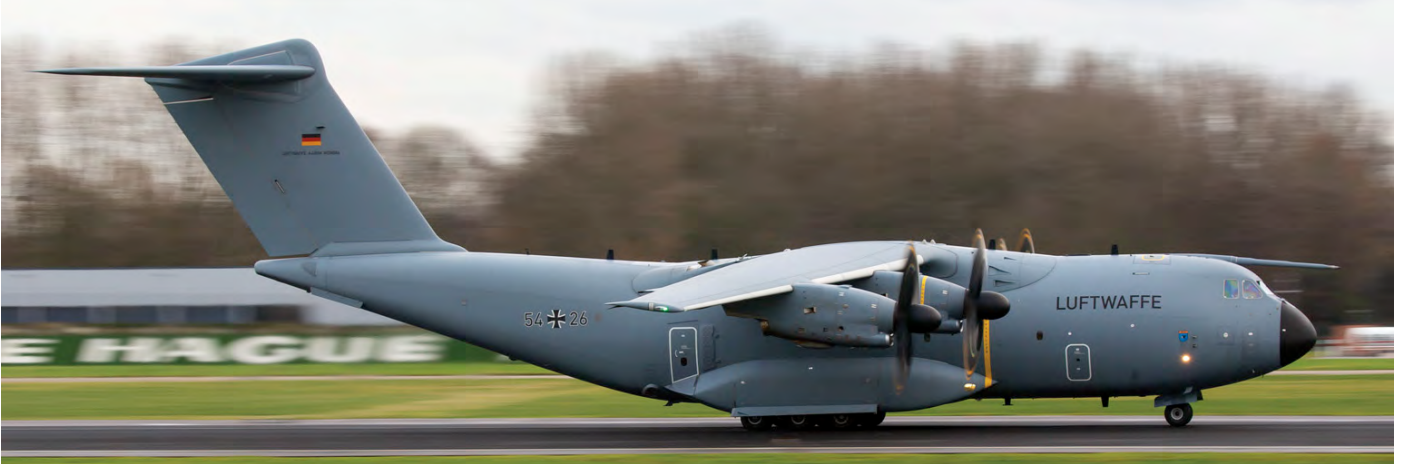
Maarten Visser (sr) was at Rotterdam - The Haque airport on 12 December 2019 when A400M 54+26 operated by LTG62 paid a short visit.