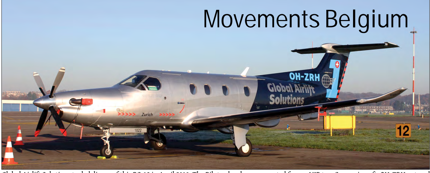
Global Airlift Solutions took delivery of this PC-12 in April 2019. The Pilatus has been converted from a VIP to a Cargo aircraft. OH-ZRH entered service on 16 September 2019 and seems to be based at Luxembourg. (Antwerp, 4 December 2019, Walter Van Brempt)