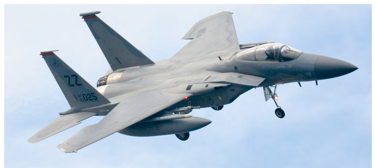
The United States still keep a large presence in Japan. With PACAF there are two squadrons of F-15 Eagles under control of 18th Wing stationed at Kadena. 83-0025/ZZ is part of 67th FS. (11 December 2019, Raymond van Dijkhuizen)