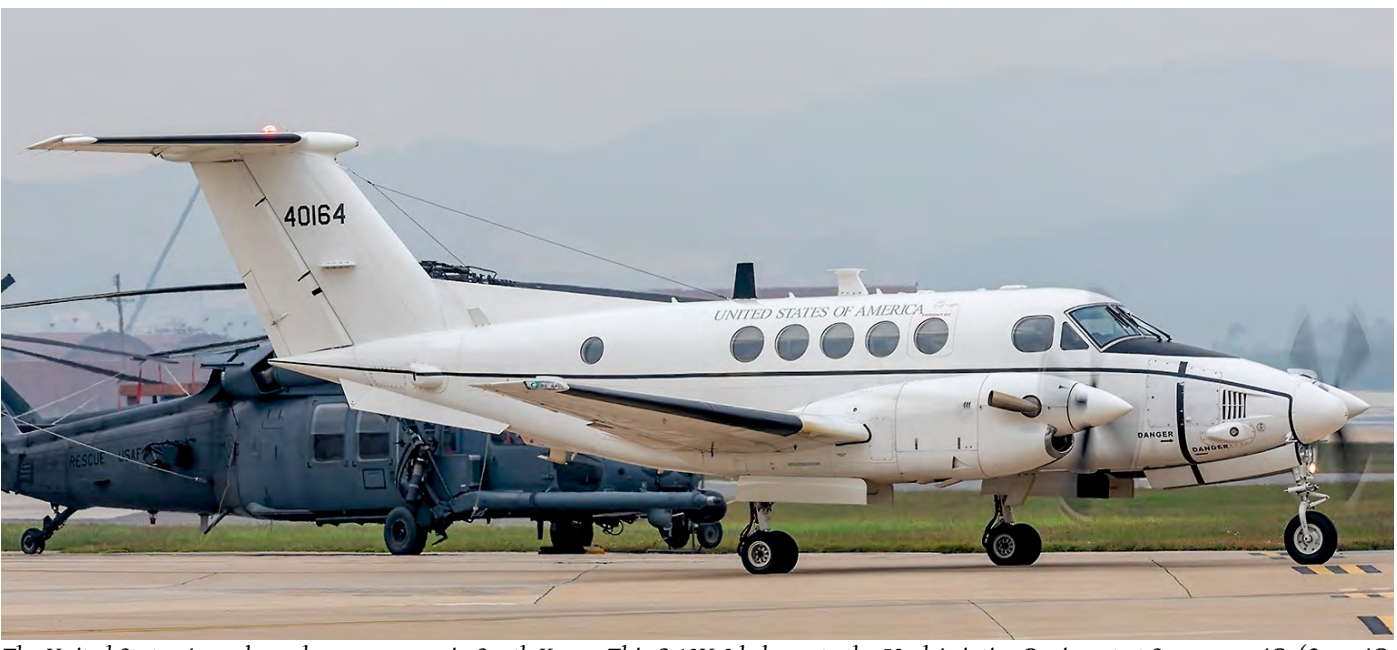
The United States Army has a large presence in South Korea. This C-12U-3 belongs to the 52nd Aviation Regiment at Seongnam AB. (Osan AB, 17 October 2019,)