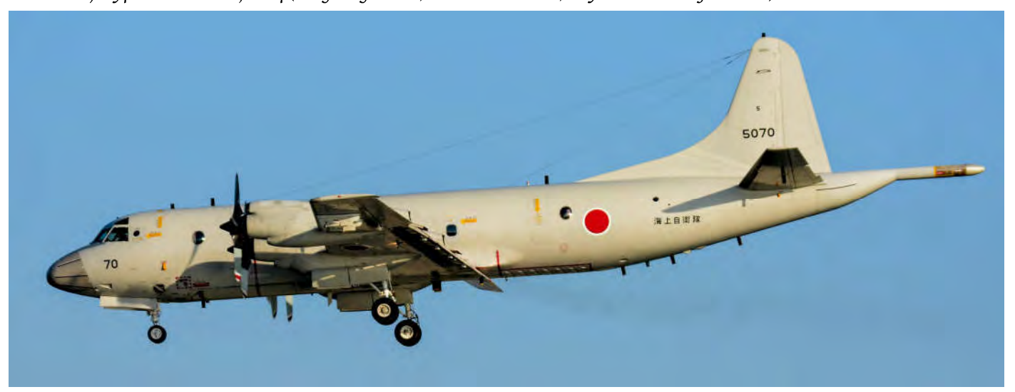
At Naha this P-3C 5070 of 5 Kokutai was noted (Naha, 10 December 2019, Raymond van Dijkhuizen)