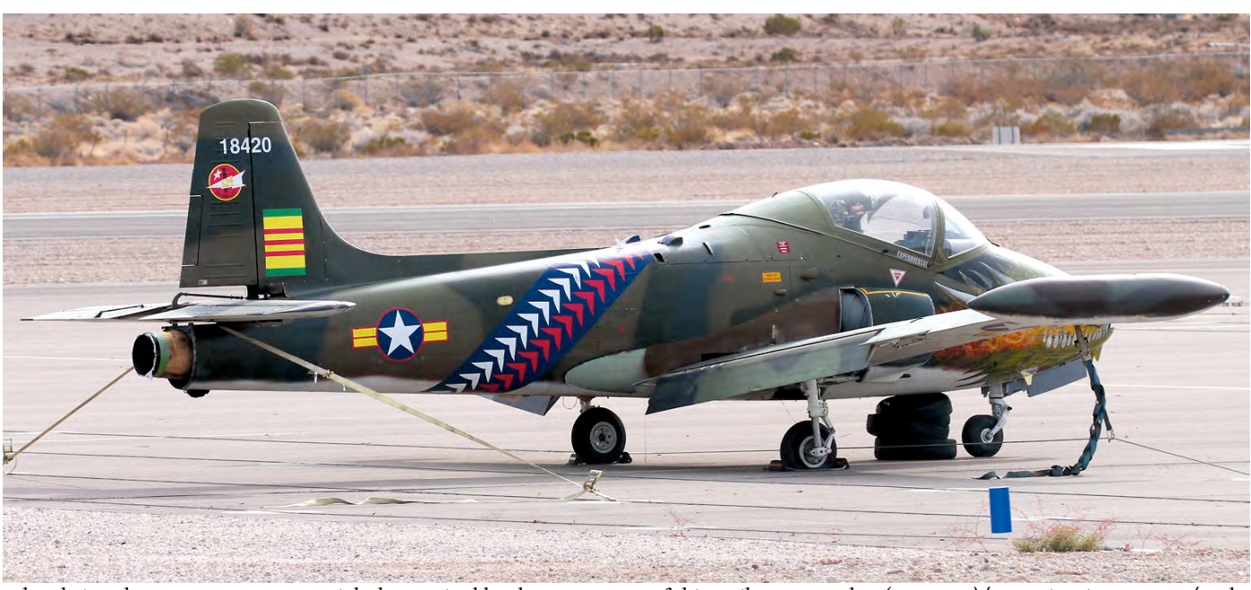
When being close to Las Vegas, one might be surpised by the appearance of this Strikemaster Mk84 (NX187BA)/18420 in Vietnamese c/s. The aircraft was used however by the Singapore Air Force as 310 until it was initially registered NX2146K in 2001. (Jean (NV), 2 December 2019, Robert Eikelenboom)

The squadron was number-plated (the official name for the decommissioning of a squadron) in 2016. It operated the Mikoyan MiG-27ML from Kalaikunda AFS (state of West Bengal) until the aircraft type was withdrawn from use. After moving to Srinagar AFS it will replace 51 Squadron which is equipped with the MiG-21Bison.