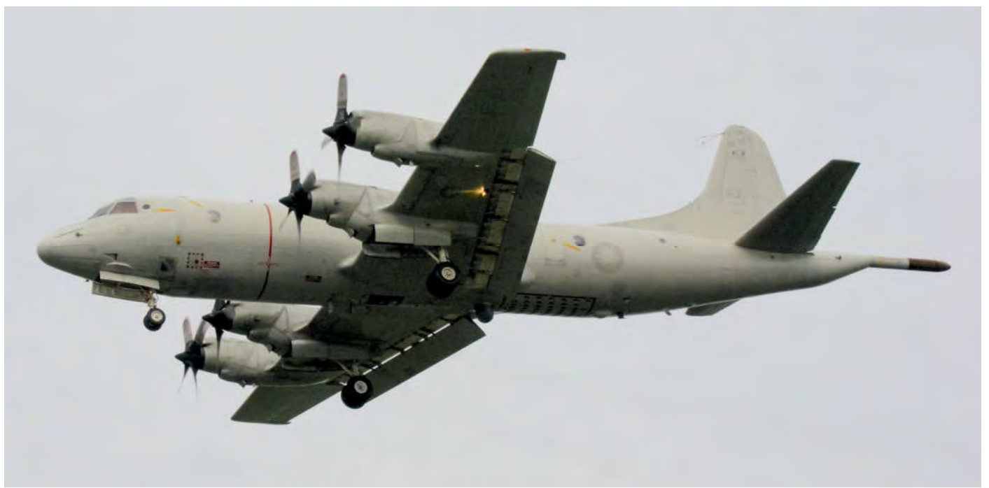
Orion rules this month. Raymond van Dijkhuizen joined a tour through a few Asian countries as can be seen inside. Having seen three countries flying the P-3 in one trip deserves this special, starting with Taiwan, which only recently started operating this aircraft type. P-3C 3310 of 34sq (Pingtung South, 5 December 2019)