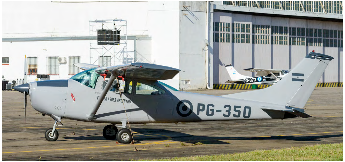
This Cessna 182 is built under license by FMA. PG-350 was last noted in our database in September 2014 as stored in Morón. Ton van Bakel saw the aircraft at Reconquista on 6 October 2019.