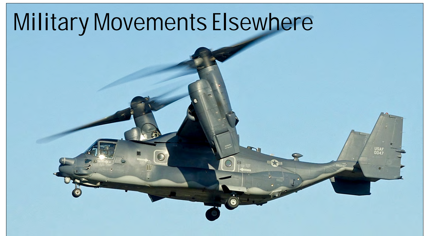
The 7th SOS received two new aircraft in January 2020. One of these is CV-22B 08-0047 seen here (Mildenhall, 21 January 2020, Tom McGhee)