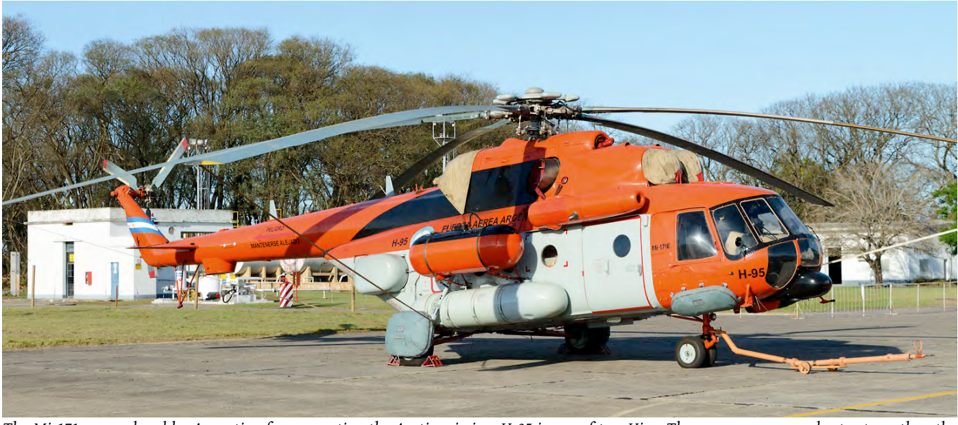
The Mi-171 was ordered by Argentina for supporting the Arctic mission. H-95 is one of two Hips. Three more are on order to strengthen the support. (Reconquista, 6 October 2019, Ton van Bakel)