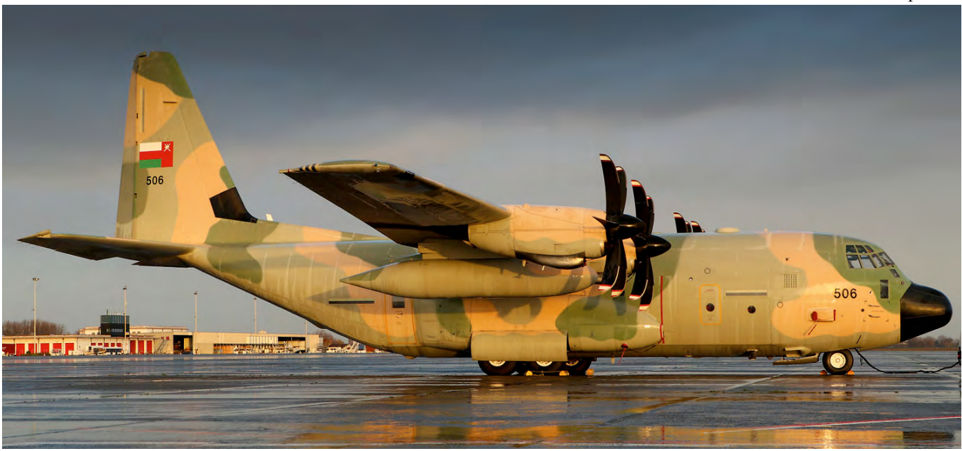
In December sultan Qaboos of Oman went to the Leuven hospital for medical treatment. Only after five days it was decided to retrieve him back to Oman, to live his last days. He died on 11 January 2020. Of course the result was the visit of some Omani aircraft to Belgium, including C-130J 506 (with 505) (Oostend, 15 December 2019)

LQ-AOF/H6 pres MNA ex PF S-545 dec19 This Bölkow was not insured since 2013 and is now part of