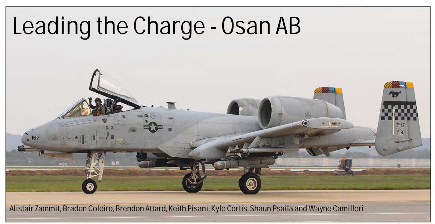
A-10C 80-0167 carries the markings of the 7th Air Force. The aircraft belongs to the 25th FS. (Osan AB, 17 October 2019)