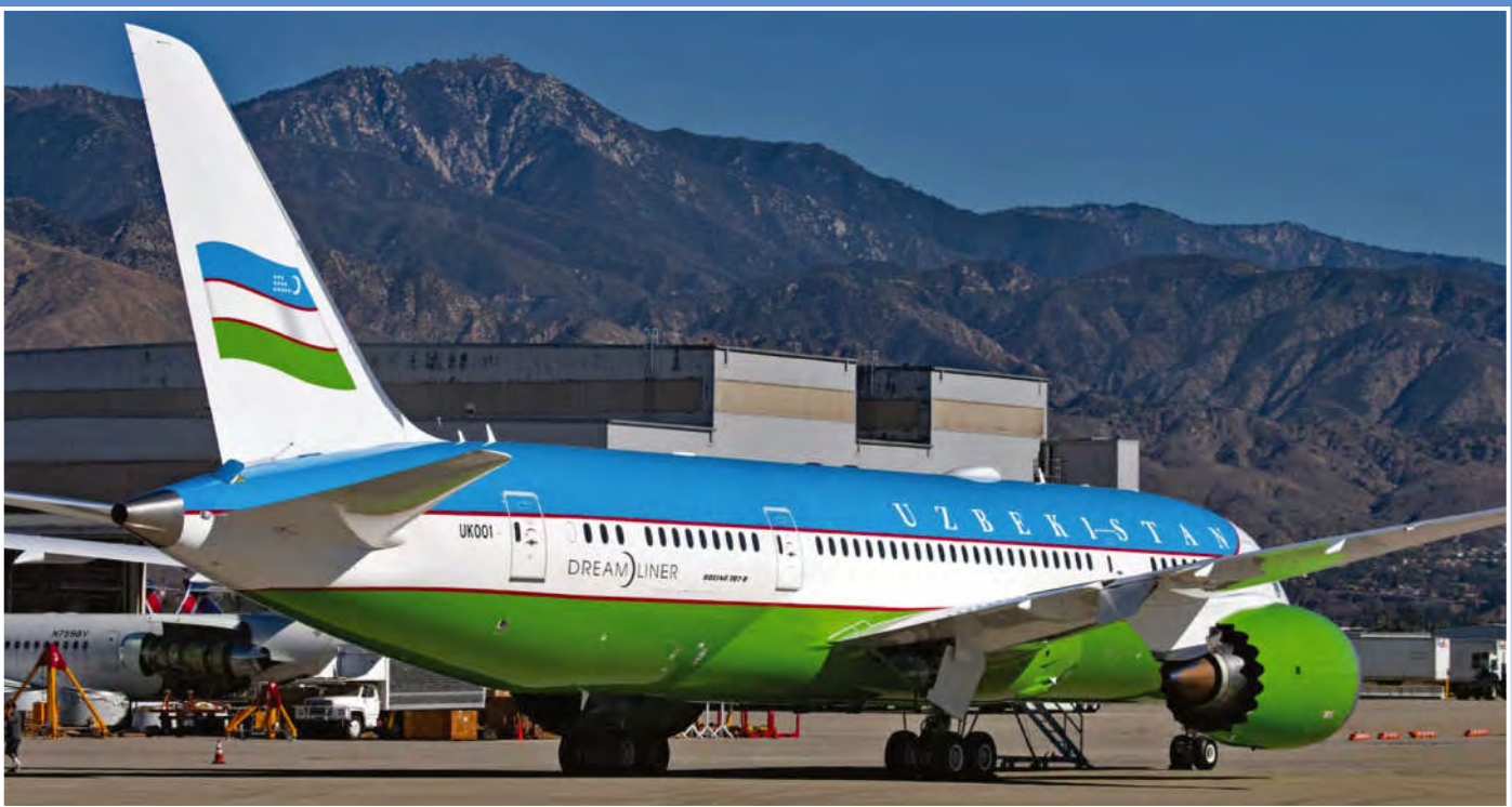
The last government aircraft on this page is the 2018 built Boeing 787 Dreamliner UK001. Uzbekistan Airways is operating it for their government. (San Bernardino (CA), 26 November 2018, Dan Stijovich)