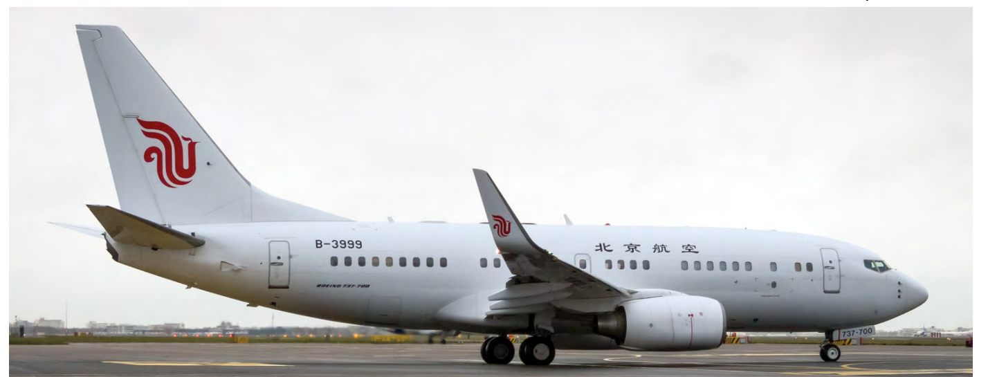
This BBJ1 has been in service with Beijing Airlines since July 2012. B-3999 was delivered to China via Lufthansa Technik. (Amsterdam - Schiphol, 21 December 2019,)