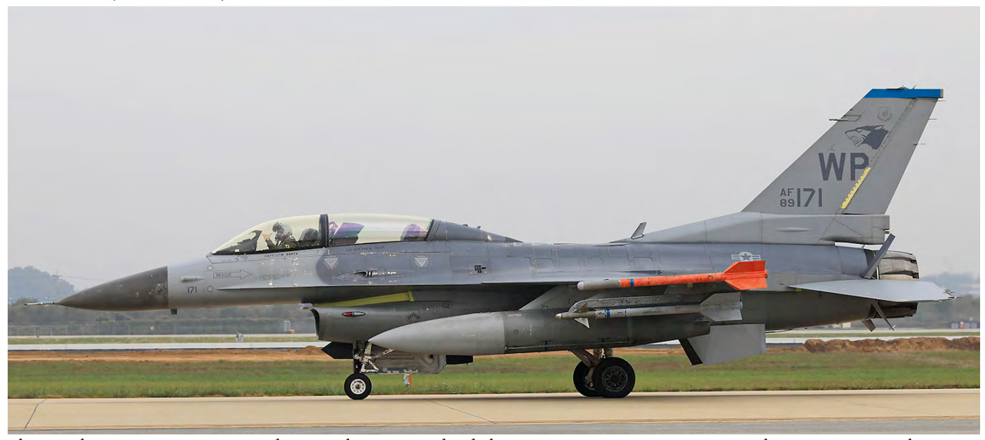
The United States Air Force maintains three squadrons equipped with the F-16 in Sout Korea: one at Osan AB and two at Kunsan AB. The F-16DM above is from the latter base and belongs to the 35th Fighter Squadron. (Osan AB, 17 October 2019)