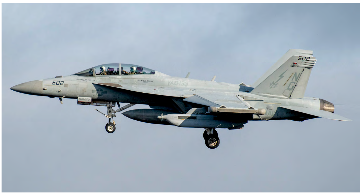
Just another day at Whidbey Island NAS produced this EA-18G 168378/NG-502 of VAQ-133 (Whidbey Island NAS, 9 January 2020)

A new entry, as the Honduran navy acquired its first helicopter! It follows the commissioning of FNH General Cabañas, a Sa'ar 62 class-corvette with a helicopter deck. Honduras thus became the first Central American country to acquire this