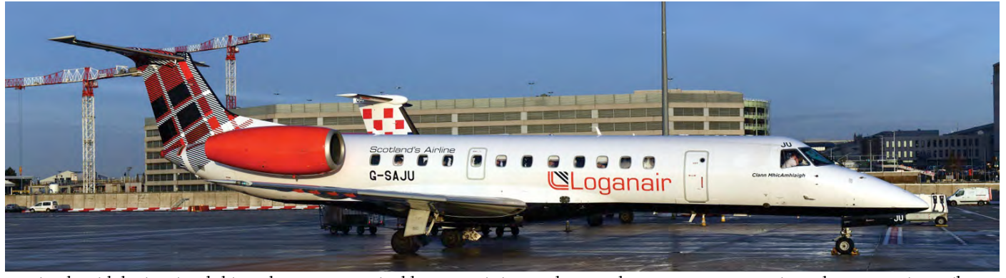
Previously with bmi regional this Embraer was acquired by Loganair in March 2019. The ERJ135ER was reregistered to G-SAJU in April 2019. (Brussels, 19 December 2019,)