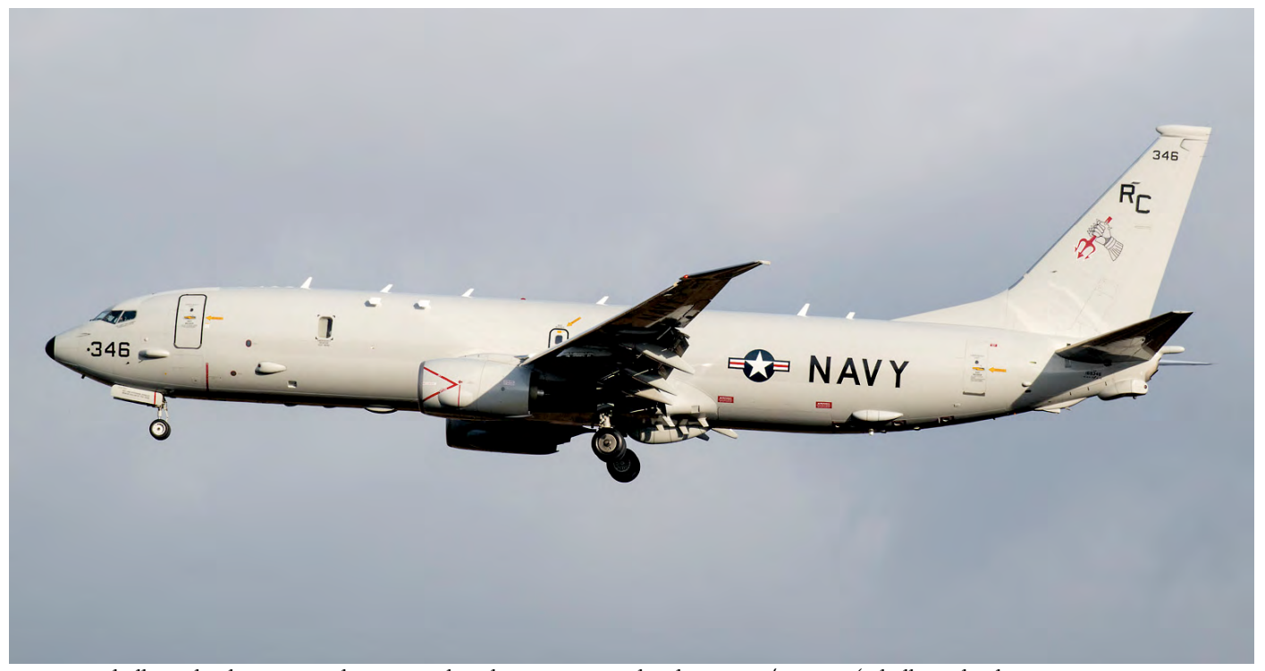
VP-46 at Whidbey Island NAS recently converted to the P-8A, using also this 169346/RC-346. (Whidbey Island NAS, 9 January 2020, Erwin Moedersheim)