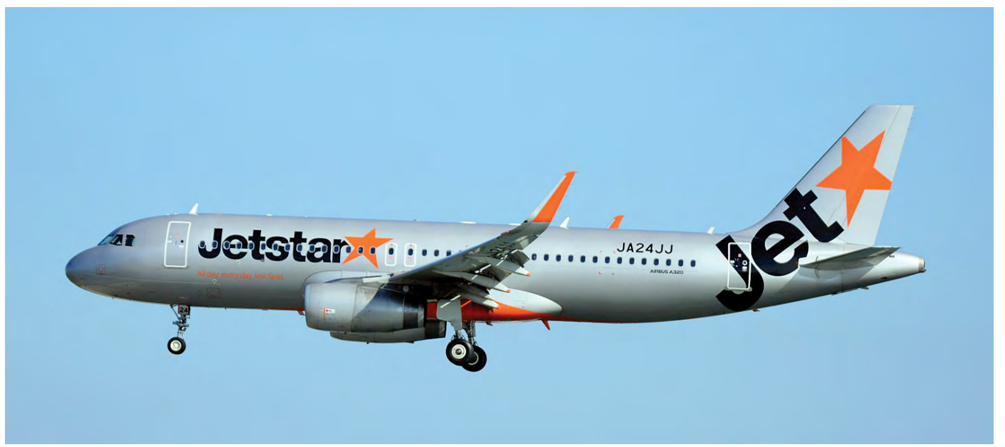
Jetstar Japan operates a fleet of 25 Airbus A320s. JA24JJ is one of them and was delivered to the airline in September 2018. (Okinawa, 10 December 2019, Raymond van Dijkhuizen)