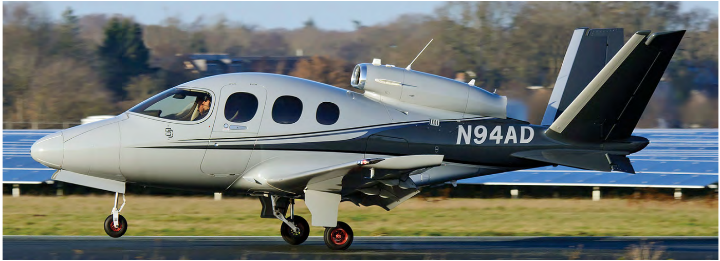
Cirrus SF50 N94AD was delivered to Petrowest Services in March 2018 and like most aircraft based in Europe it made a visit to the Cirrus Vision Service Center at Groningen airport. Simen Dorschman was able to photograph the aircraft when it arrived on 10 December 2019.