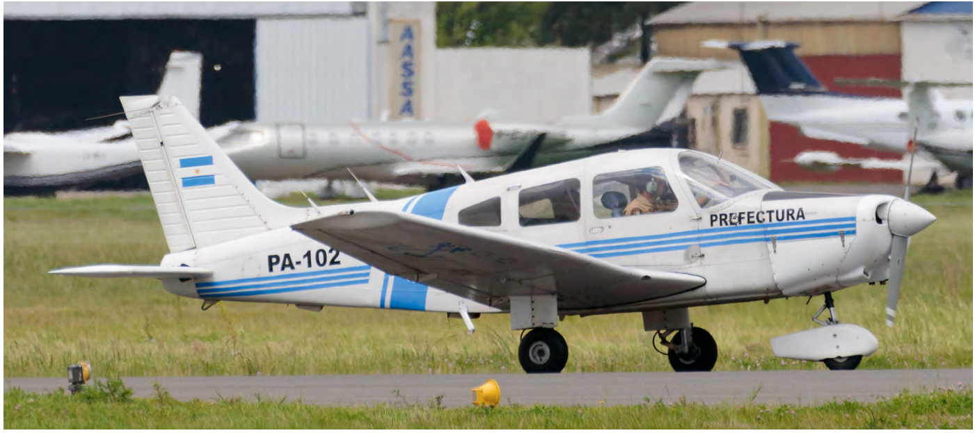
Piper PA-28 PA-102 is a Chincul assembled example of the Archer. The Archer is in use with the Prefectura Naval (Coast Guard) and is assigned to the San Fernando unit. (San Fernando, 7 October 2019, Ton van Bakel)