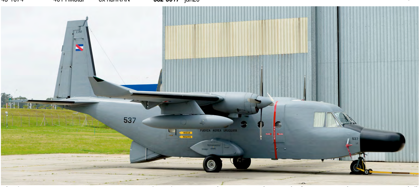
This former Portugese Air Force C212M-300 is now flying for Uruquay with EA3T as 537. (Montevideo/Carasco, 3 October 2019, Ton van Bakel)