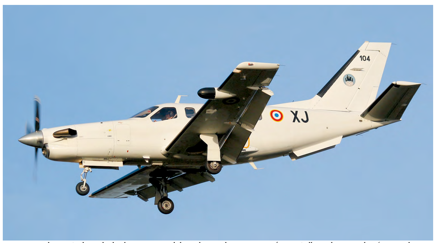
TBM-700s can be seen in the Netherlands every now and then. The French Army sent 104/XH to Eindhoven last December. (19 December 2019 Stephan Lodewijks.)