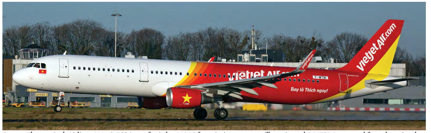
Former Thomas Cook Airlines A321 G-TCDO was ferried to MAAS for painting, temporarilly registered F-WTBI. It emerged from the paint shop in the colours of VietJet Air. (Maastricht - Aachen, 23 December 2019,)