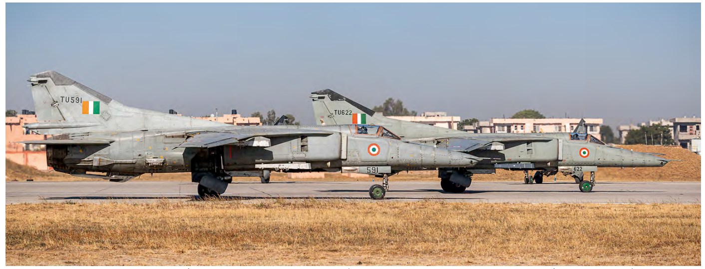
The end of an era. No Indian MiG-23/27 will be operational anymore. (Jodhpur, 27 December 2019,)

On 11 January 2020 delivery of the last three UH-60M Blackhawks for the Vzdušné sily Ozbrojených sil Slovenskej Republiky (SAF, Slovak Air Force) took place (serials 7445, 7446 and 7447). With this delivery, all Slovakian Blackhawks have been delivered to the Vrtulnikové kridlo, 1. Vrtul'niková letka which is based at Presov. In 2014, the SAF decided to buy nine UH-60M Blackhawks to replace their aging Soviet Mi-17s. This USD 261 million contract also included two years logistic support, training for the pilots and technical personnel and the transport to Slovakia. The first two multi-purpose helicopters were delivered in august 2017 (serials 7639 and 7640), followed by another two in July 2018 (serials 7641 and 7642) and another two in August 2019 (serials 7448 and 7449). Scramble assesses that the latest trio arrived by ship at