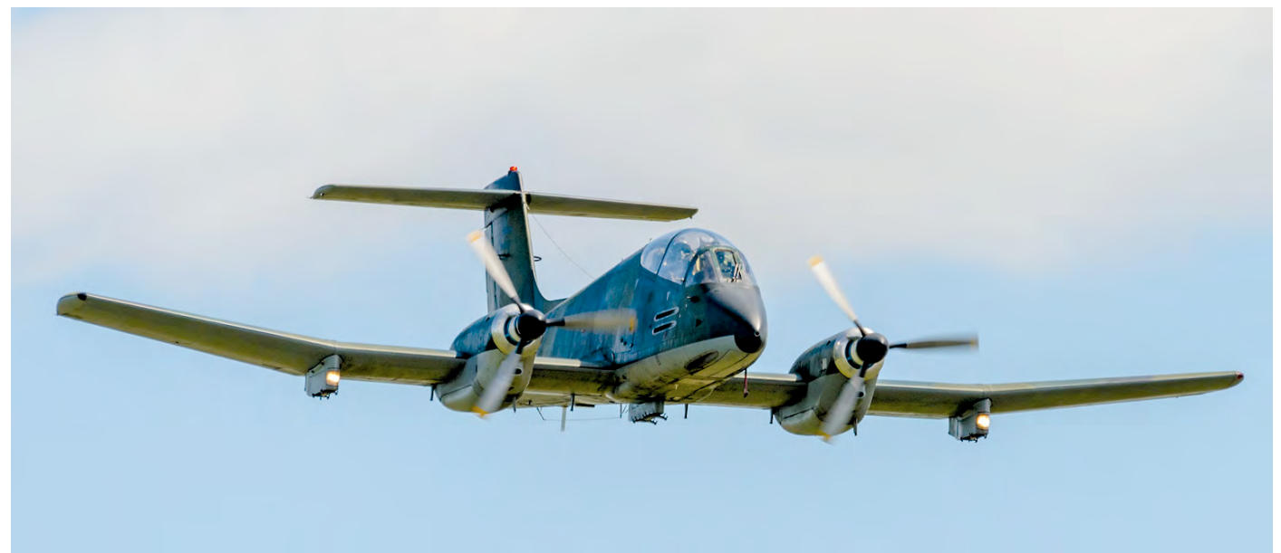
The Pucará is another indiginous Argentinian design. Used as a counter insurgency aircraft and used operationally in the Falklands War. A-568 was seen at Reconquista by Ton van Bakel on 6 October 2019.