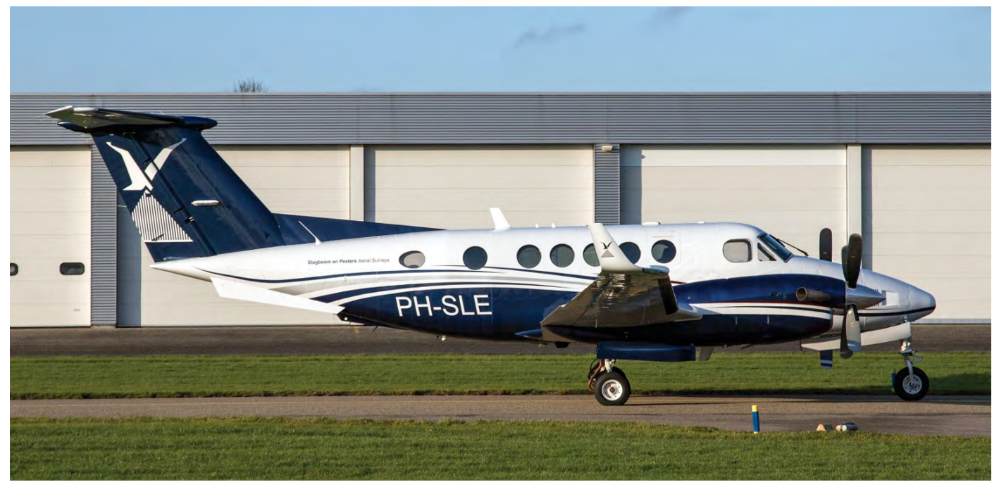
After almost ten years of service as LN-LTI with Lufttransport in Norway this Beechcraft B200 was sold to Slagboom en Peeters Luchtfotografie (Aerial Survey) as PH-SLE. (Lelystad, Richard Poeser, 12 December 2019)