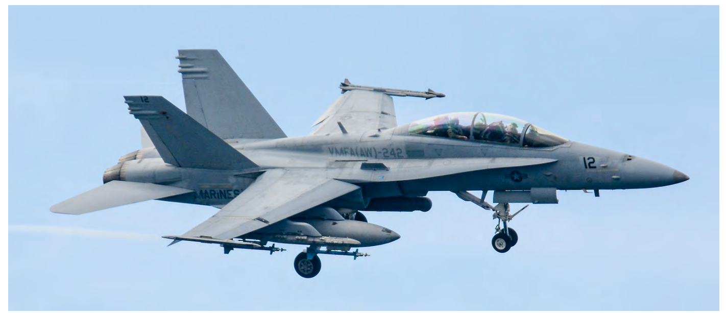
United States Marines Hornets do visit Kadena on a regular basis. BuNo 164688 from VMFA(AW)-242 is seen in the landing patttern at Kadena. (11 December 2019,)