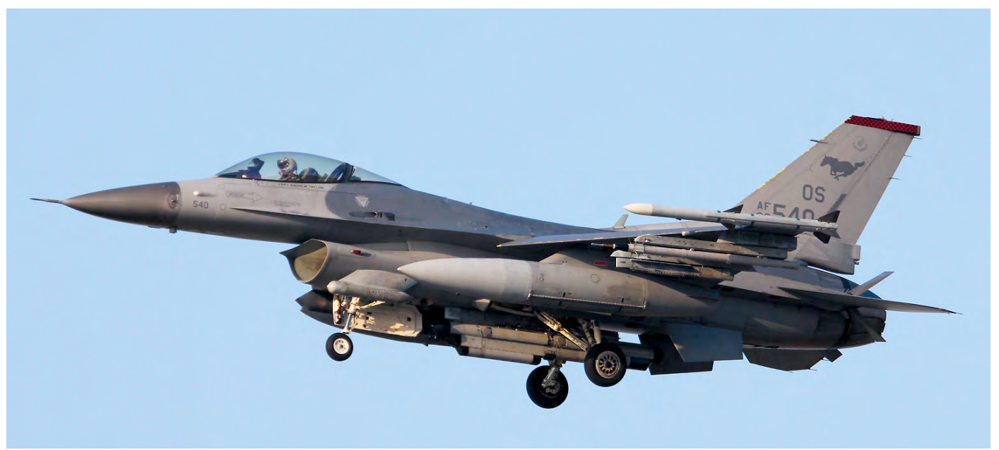
F-16CM 88-0540 from the Osan-based 36th FS 'Flying Fiends' during landing. (OSan AB, 17 October 2019, Kyle Cortis)