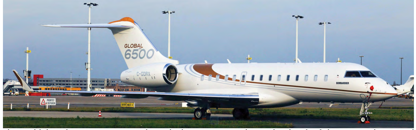
The new Global 6500 demonstrator was registered to Bombardier in January 2019. The aircraft made its first flight on 12 September 2019. Paul Sanders photographed the jet at Brussels on 28 December 2019.