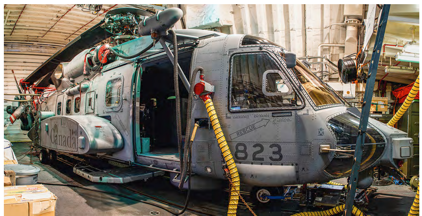
Royal Canadian Air Force Sikorsky CH-148 Cyclone '148823' on board the Royal Canadian Navy HMCS Halifax / NCSM Halifax while in Grand Harbour, Valletta during a visit organised by the Malta Aviation Society. Please note, the result was achieved by stitching four photos together in order to get a full shot due to the cramped space. (28 December 2019, Shaun Psaila)