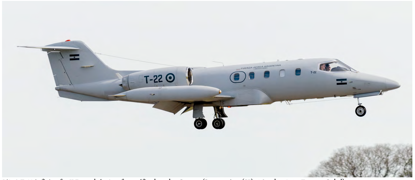
Lj35A T-22 is flying for II Escuadrón Aerofotográfico based at Parana (Reconquista (SF), 6 October 2019, Ton van Bakel)

On Friday 27 December 2019, it was the final day for 29 Squadron 'Scorpions' to operate the MiG-27MU Bahadur and the MiG-23UB. The squadron, part of 32 Wing and based at Jodhpur AFS (state of Rajasthan), was the last unit within the Indian Air Force to operate these two types of aircraft.