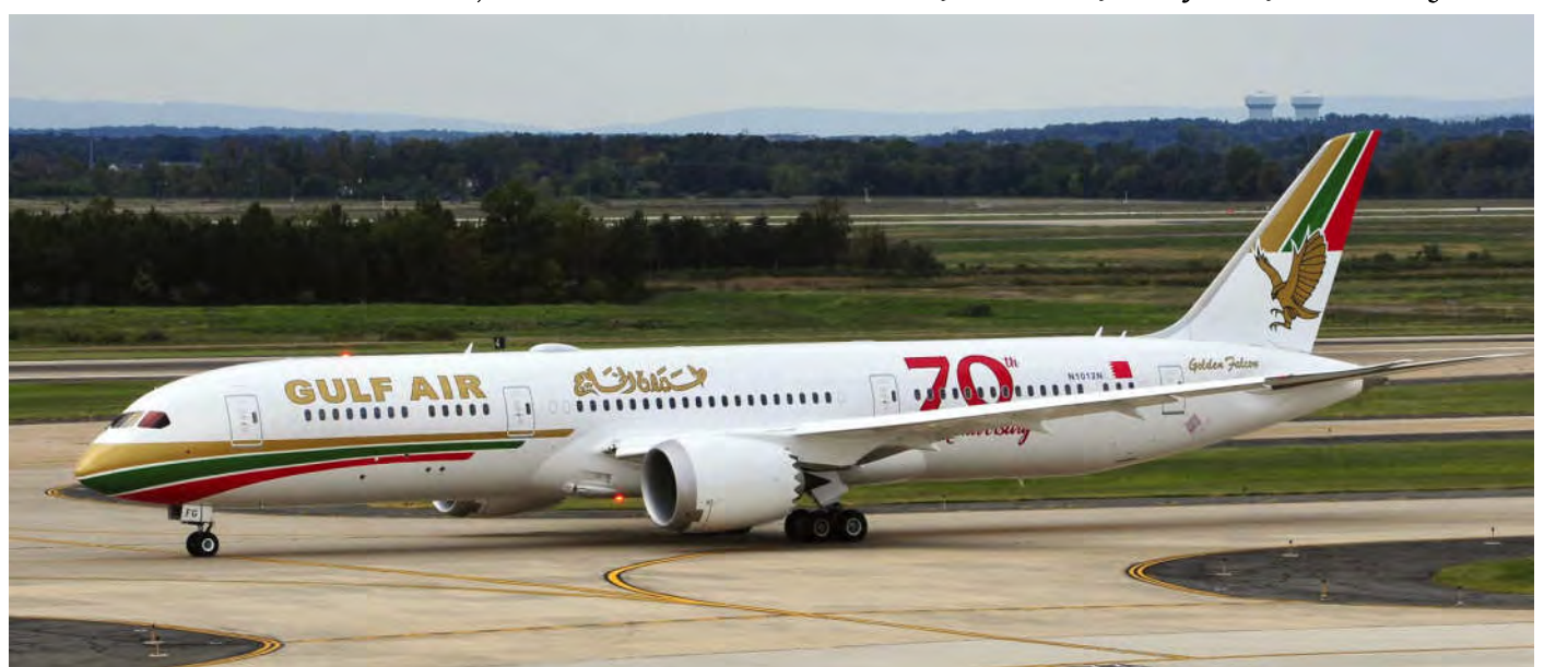
On this picture this Gulf Air Boeing 787 Dreamliner is using the factory test registration N1012N and painted in the 1976 retro colour scheme. During its delivery in October it was re-registered to A9C-FG. (Washington-Dulles (VA), 17 September 2019, Anton van Ruiten)