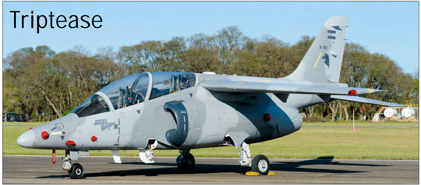
The IA63 Pampa is a locally designed and build aircraft. The Fabrica Militar de Aviones got heavy assistance from Dornier. Unfortunately, due to the economical situation in Argentina the production of the MS760 replacement, was started and stopped for several times. A-701 was seen under construction in 2014, while assembly took place in 2017 and the aircraft was finally delivered in November 2018 to G6C. (Reconquista, 6 October 2019, Ton van Bakel)