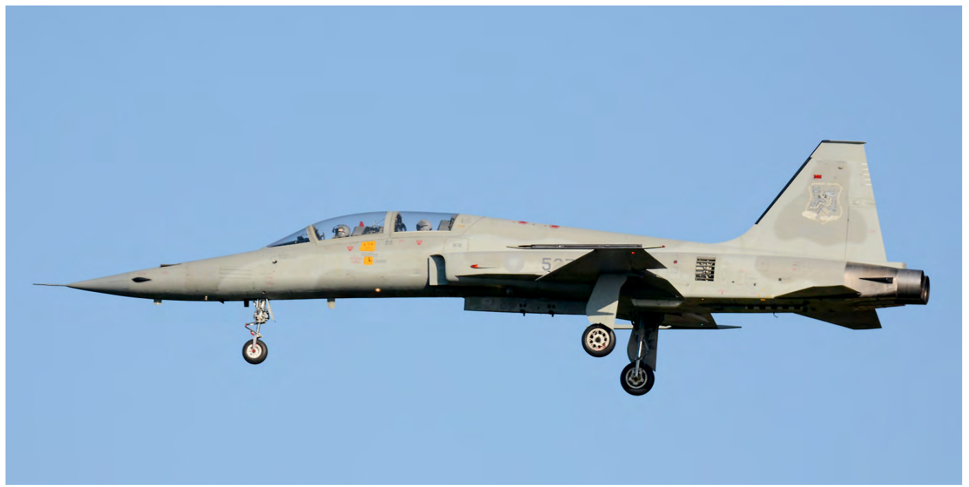
F-5 5372 was seen twice by Ramond van Dijkhuizen in the same trip. One time together with 5291 at Taitung and today at Tainan. (13 December 2019)