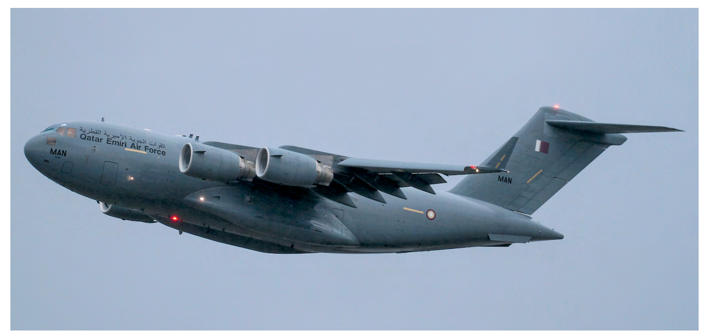
Star military visitor to say goodbye to the first decade of this millennium at Schiphol was undoubtedly this Qatar C-17A A7-MAN (23 December 2019,)