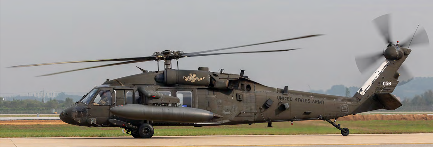
All sorts of aircraft and helicopters frequently visit Osan AB as the photos above illustrate. The U-2S and UH-60L belong to the USAF respectively the US Army. (17 October 2019, Alistair Zammit (top), Braden Coleiro (bottom))