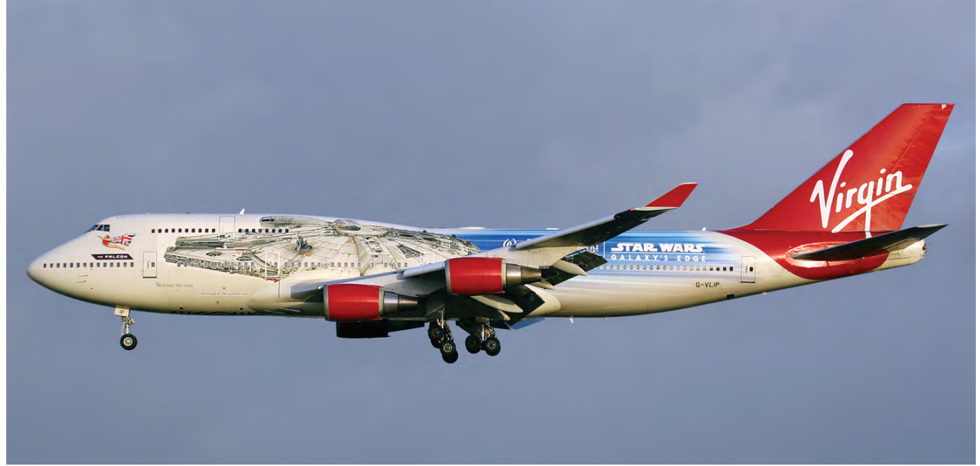
Virgin Atlantic has withdrawn the 747-400 from its London-Heathrow operations but still operates a fleet of 747-400s from London-Gatwick and Manchester. Boeing 747 G-VLIP was delivered to Virgin in May 2011 and named "Hot Lips". In September 2019 the aircraft was renamed "The Falcon" and was painted in special "Star Wars; Galaxy Edge" colours. (London-Gatwick, 8 December 2019)