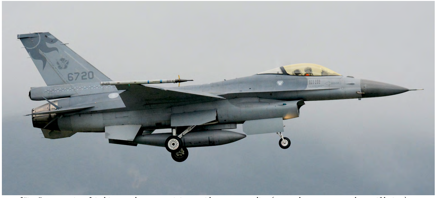
One of "just" 150 F-16 aircraft is this example. F-16 6720 is in use with 5 TFW at Hualien. (2 December 2019, Raymond van Dijkhuizen)