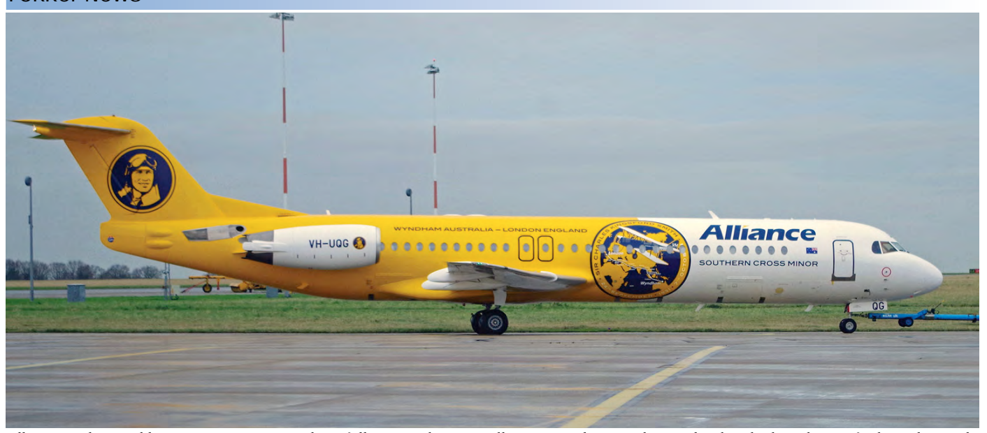
Alliance Airlines Fokker 100 VH-UQG is seen here fully painted in "Wyndham Australia - London England and Edward Kingsford Smith" markings, at Norwich on 7 January 2020. It left two days later on delivery to Australia via the usual route Down Under, to arrive at Brisbane on 19 January. It stopped at Bratislava for a few days, between 10 and 15 January, before continuing its journey as SXI2003.