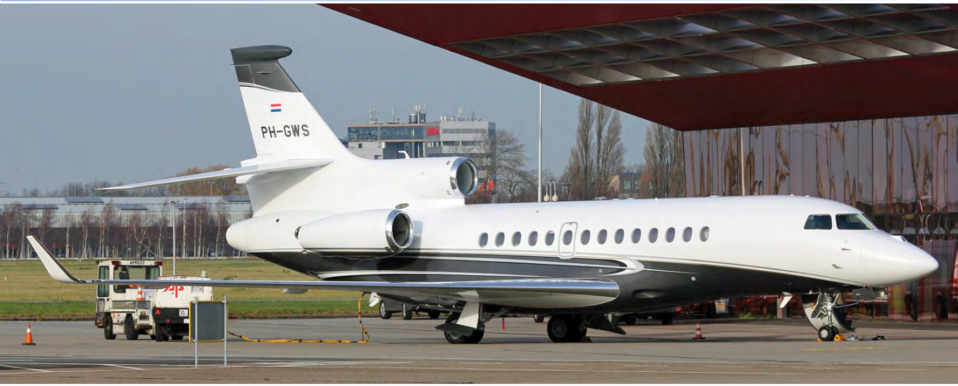
This factory fresh Falcon 7X (ex F-WWHL msn 287) was only recently registered in and delivered to its new Dutch owner Exxaero as PH-GWS. (Amsterdam-Schiphol, 11 January 2020)