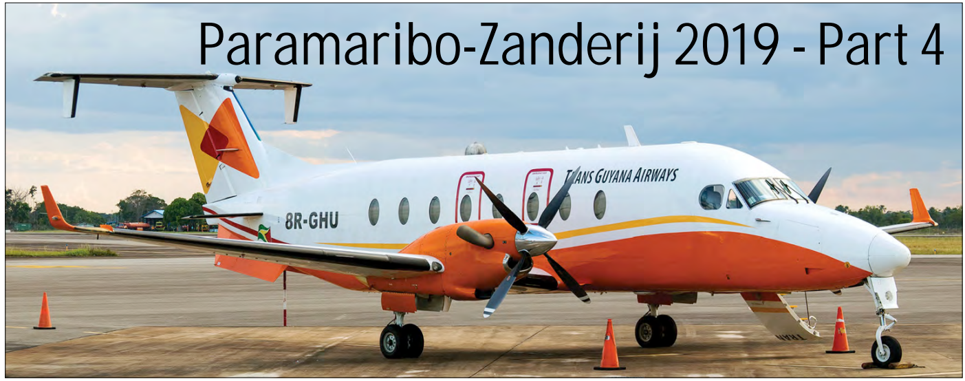
The last built Beech 1900 was photographed by Andrew Muller when it visited Paramaribo on 20 October 2019. 8R-GHU still carries the colours of its previous operator Marsan Family Holdings. Former C-GMFH was delivered to Guyana on 2 March 2019.