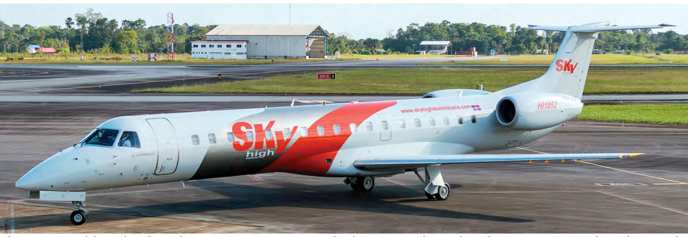
This ERJ145 was delivered to Sky High Aviation in June 2019. HI1052 has been repainted recently in these new corporate colours. (Paramaribo, 15 October 2019,)