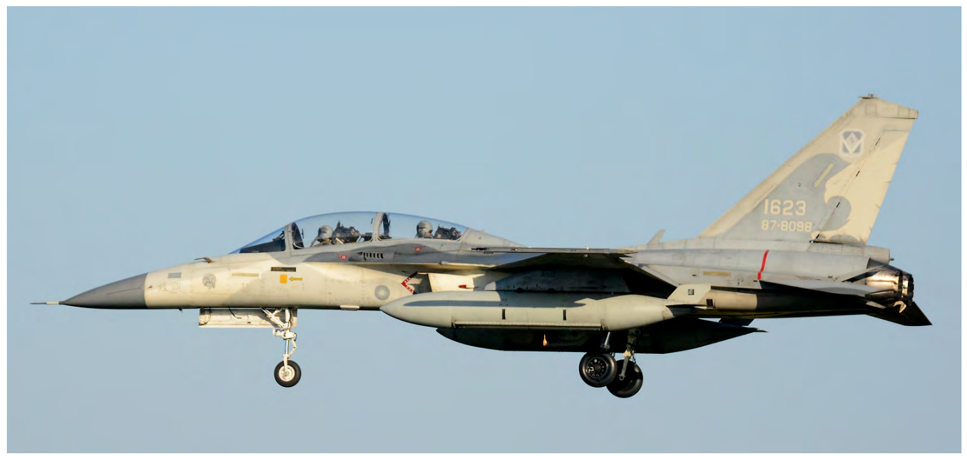
Taiwan ordered three types to replace the ageing fleet of F-104 Starfighters and F-5 Freedom Fighters. These are: the F-16, Mirage 2000 and the F-CK-1A/B Ching-Kuo. Serial 1623 was seen by Raymond van Dijkhuizen at Tainan on 13 December 2019.