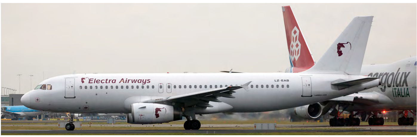
After operating for Enter Air in the summer of 2019 the Airbus A320 LZ-EAB was returned to Electra Airways. (Amsterdam - Schiphol, 21 December 2019) DCUGE C6525B Atlas Air Service ATLAU N900EH TRM-900 HTG Trading