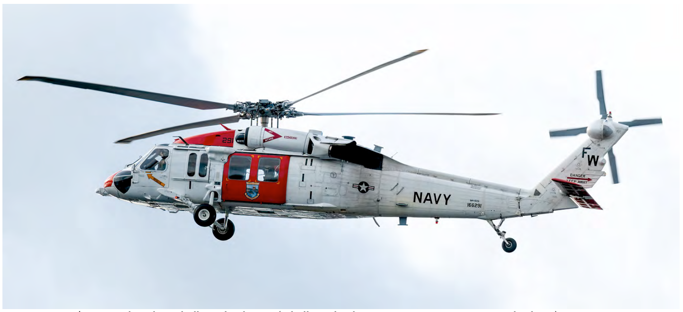
MH-60S 166291/FW-291 is based at Whidbey Island NAS. (Whidbey Island NAS, 9 January 2020, Erwin Moedersheim)

capability, Mexico being considered part of North America. The Bo was seen with full FNH colours and wearing this civil registration.