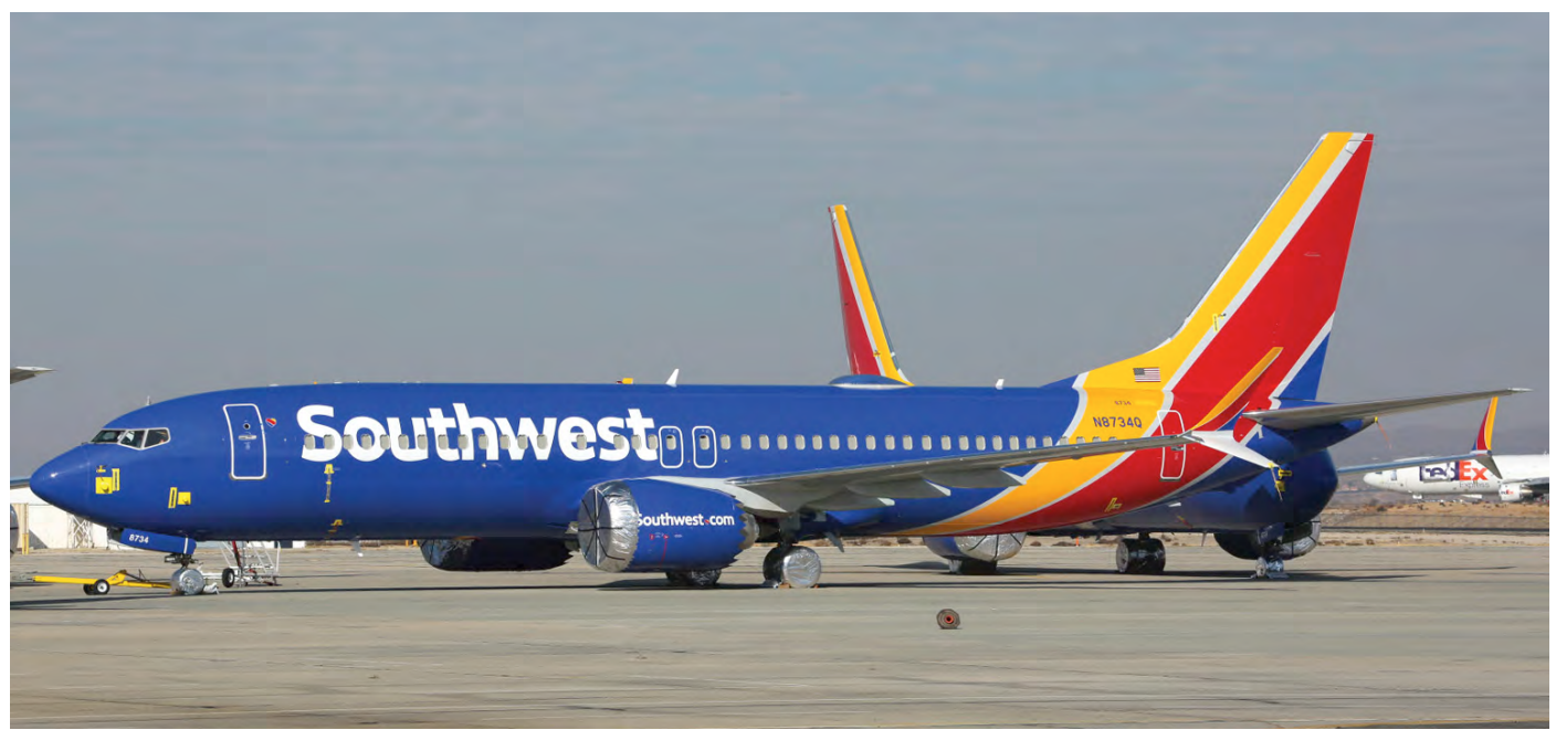
With 709 Boeing 737-700s and 737-800s in service, Southwest is by far the largest operator of the Boeing 737. It is also the largest single customer of the 737 MAX. Southwest Airlines placed the first order for the Boeing 737 MAX on the 13th of December 2011. In total it ordered 296 737 MAX aircraft, of which 34 had been delivered at the moment the 737 MAX was grounded. Boeing 737 Max 8 N8734Q is one of them and is seen here stored at Victorville (CA). (2 December 2019, Robert Eikelenboom)