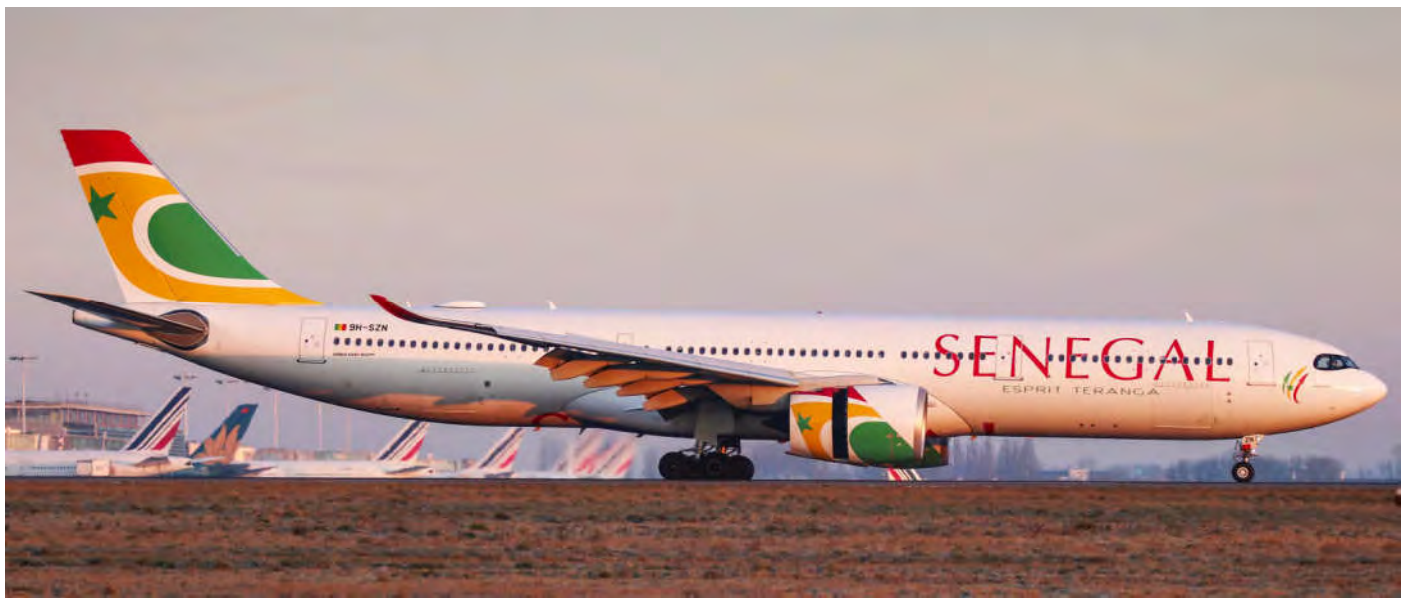
Air Sénégal International took delivery of this Airbus A330-941 in March 2019. It is registered in Malta as 9H-SZN and seen on a cold sunny morning at Paris Charles de Gaulle. (29 December 2019, Nik Deblauwe)