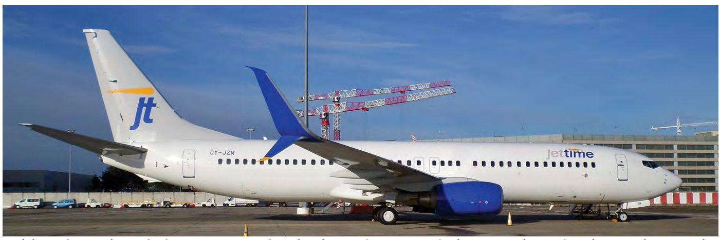
Withdrawn from use by TUIfly, former D-ATUG was ferried to Shannon for painting. After being painted it was ferried to Brussels in November 2019 before delivery to Jet Time as OY-JZM. Yves Deliens was able to photograph the Boeing 737 on 10 December 2019 at Brussels the day before it was delivered to Copenhagen. The aircraft operated its first service on 24 January 2020.