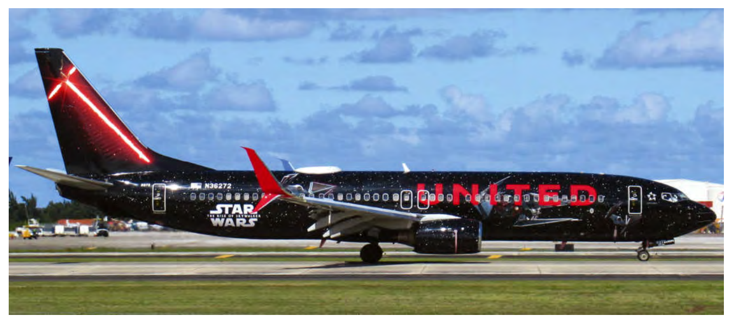
Since November 2019 this former Continental Boeing 737-800 is painted in this Star Wars colour scheme. On the right hand side the titles are red and on the other side of United Airlines N36272 it is blue. (San Juan (PR), 18 January 2020, Juan A. Rodriguez)