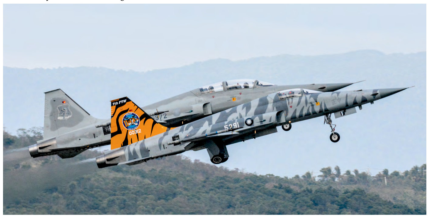
Raymond van Dijkhuizen saw this F-5 two-ship formation, consisting of 5291 and 5372 at Taitung where the 7 TFW is stationed . 5291 is painted in this splendid Tiger c/s. (3 December 2019)