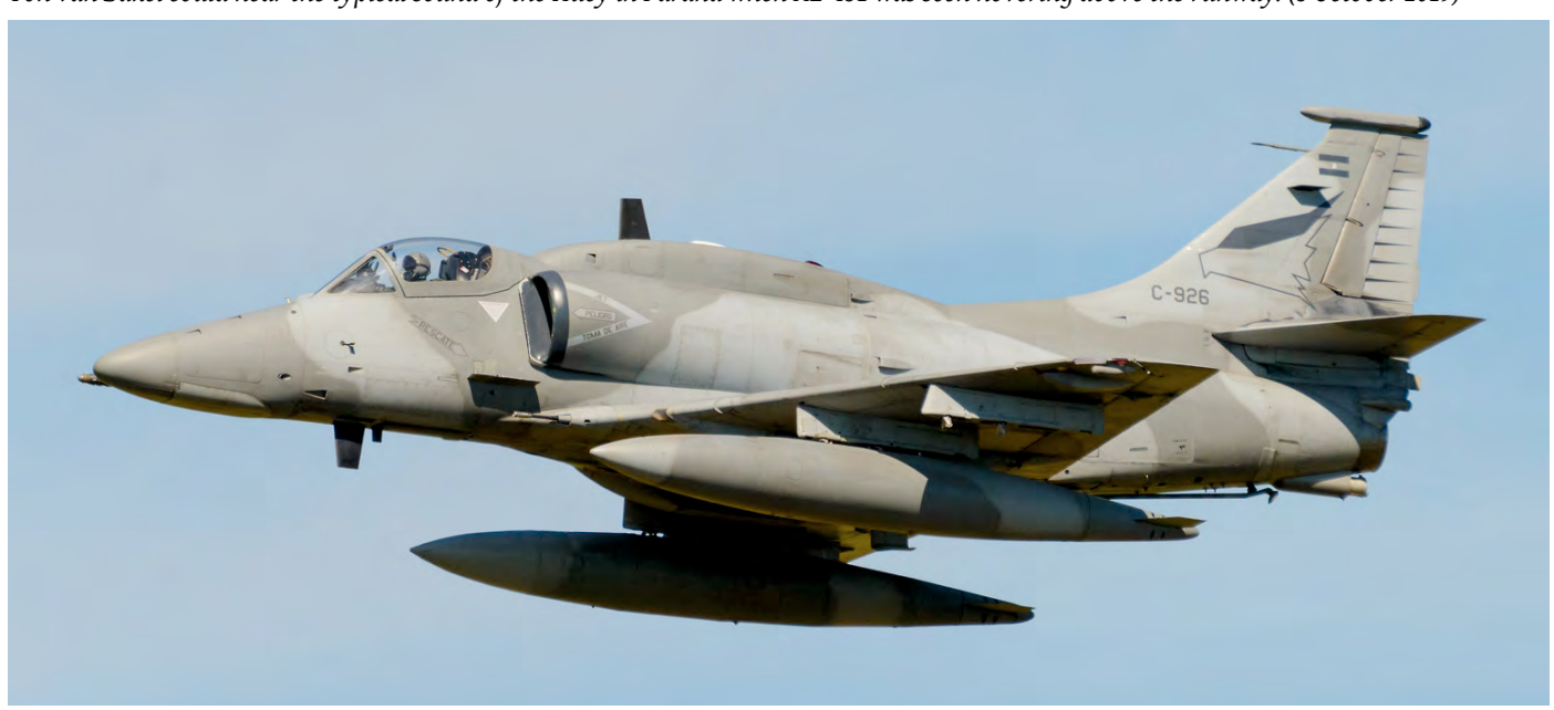
Grupo 5 de Caza has the A-4 on strength. C-926 is one of them, and is as the rest a former US Navy aircraft. (Reconquista, 6 October 2019, Ton van Bakel)