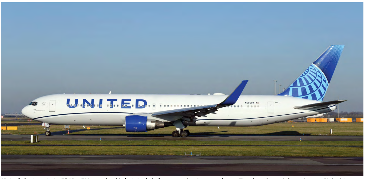
United's Boeing 767-300ER N656UA, was the third 767 in their fleet to receive the new colours. The aircraft was delivered new to United 27 years ago in January 1993. (Amsterdam-Schiphol, 27 December 2019, Ton Jochems)