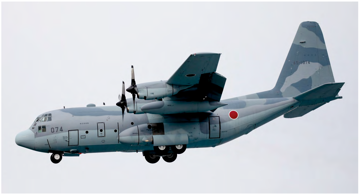
The JADF is considering a new colour scheme for the C-130H and the pattern used on 45-1074 might become the new standard. (Gifu, 6 December 2019, Manolito Jaarsma)

Bremerhaven (Germany), from where they flew to the Slovak Republic, as pictures were taken at Caslav Air Base (Czechia). A similar delivery flight from Bremerhaven was seen in August 2019.