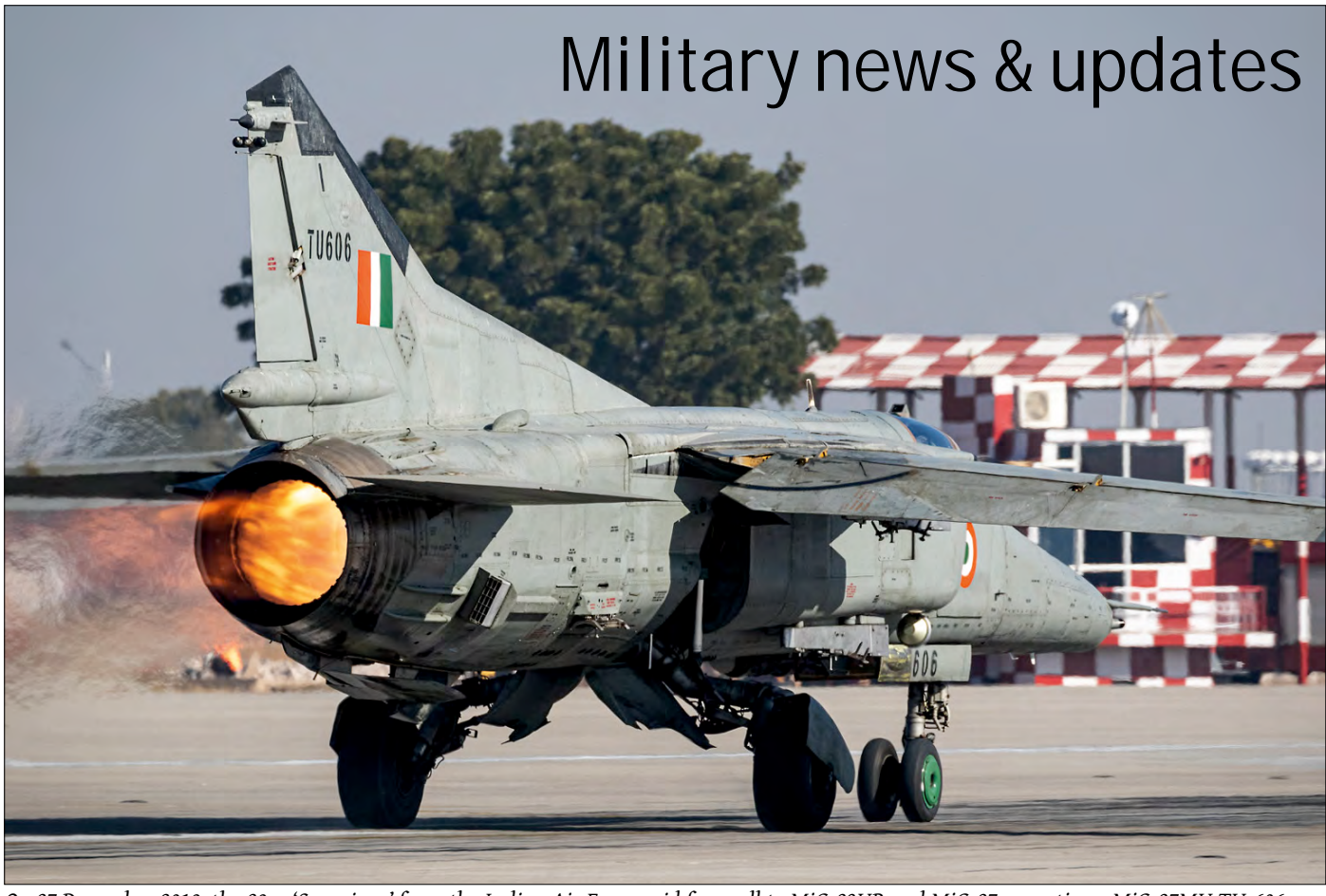
On 27 December 2019, the 29sq 'Scorpions' from the Indian Air Force said farewell to MiG-23UB and MiG-27 operations. MiG-27MU TU-606 was one of the aircraft to perform its final flight. (Jodhpur AFS, 27 December 2019)

Because of our standardization we sometimes use type, unit and serial presentations that may strongly differ from those used by the manufacturer or user. It is therefore possible that the information sent by you can deviate from the information we publish.