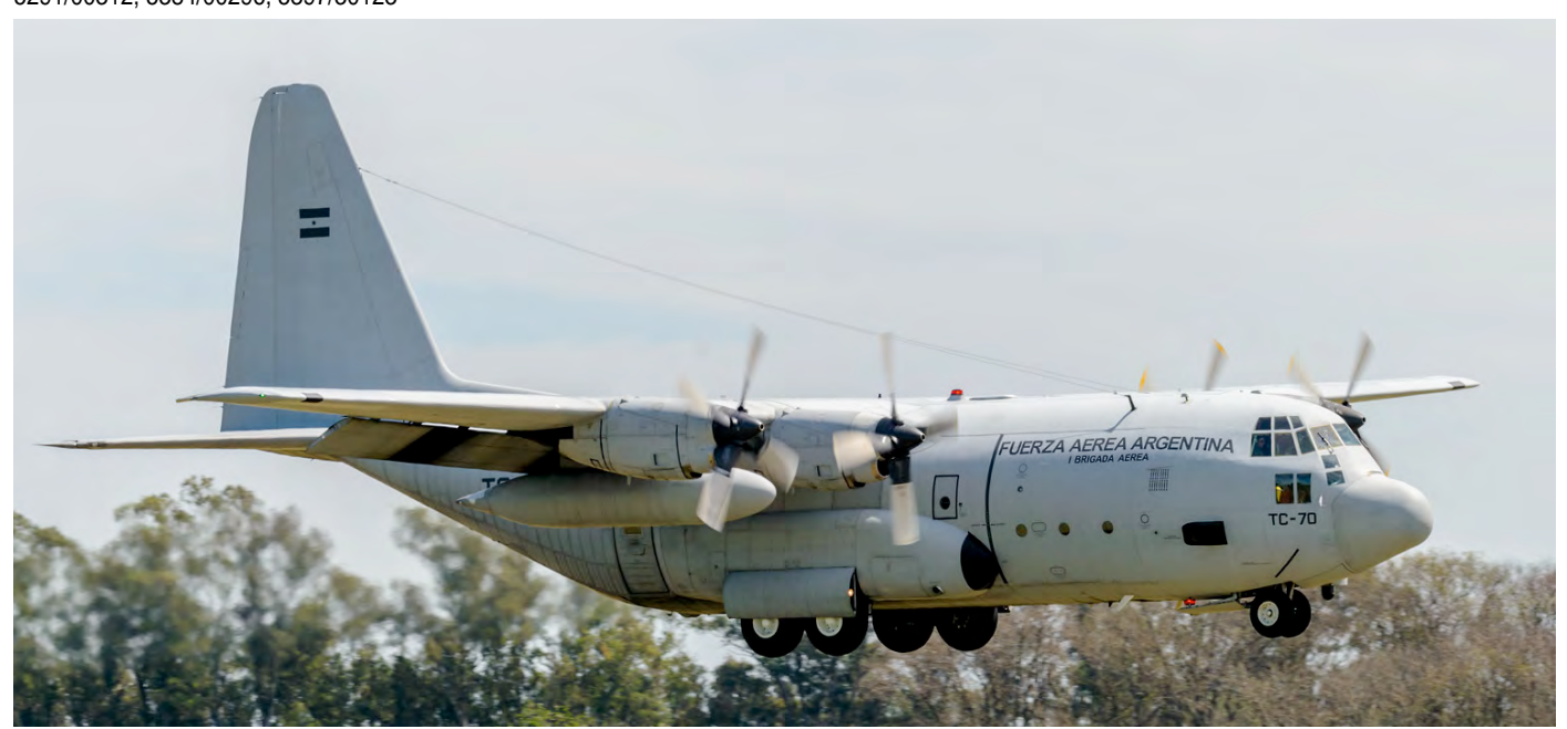
KC-130H TC-70 was seen at Reconquista. The tanker Hercules was originally delivered on 10 May 1979 to the Argentine Air Force. (6 October 2019,)