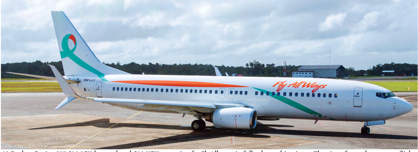
AirExplore Boeing 737 OM-LEX has replaced OM-HEX operating for FlyAllways in full colours this winter. The aircraft mostly operates flights to Cuba. (Paramaribo, 18 December 2019, Andrew Muller)