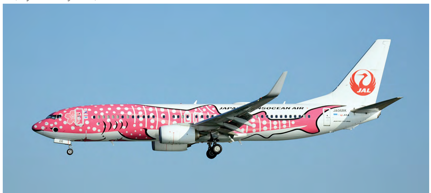
Japan Transocean Air is an airline which operates domestic services on behalf of Japan Airlines with a fleet of twelve Boeing 737-800s. JA06RK is one of them and was delivered in Sakura Jimbei colours in December 2017. (Okinawa, 10 December 2019, Raymond van Dijkhuizen)