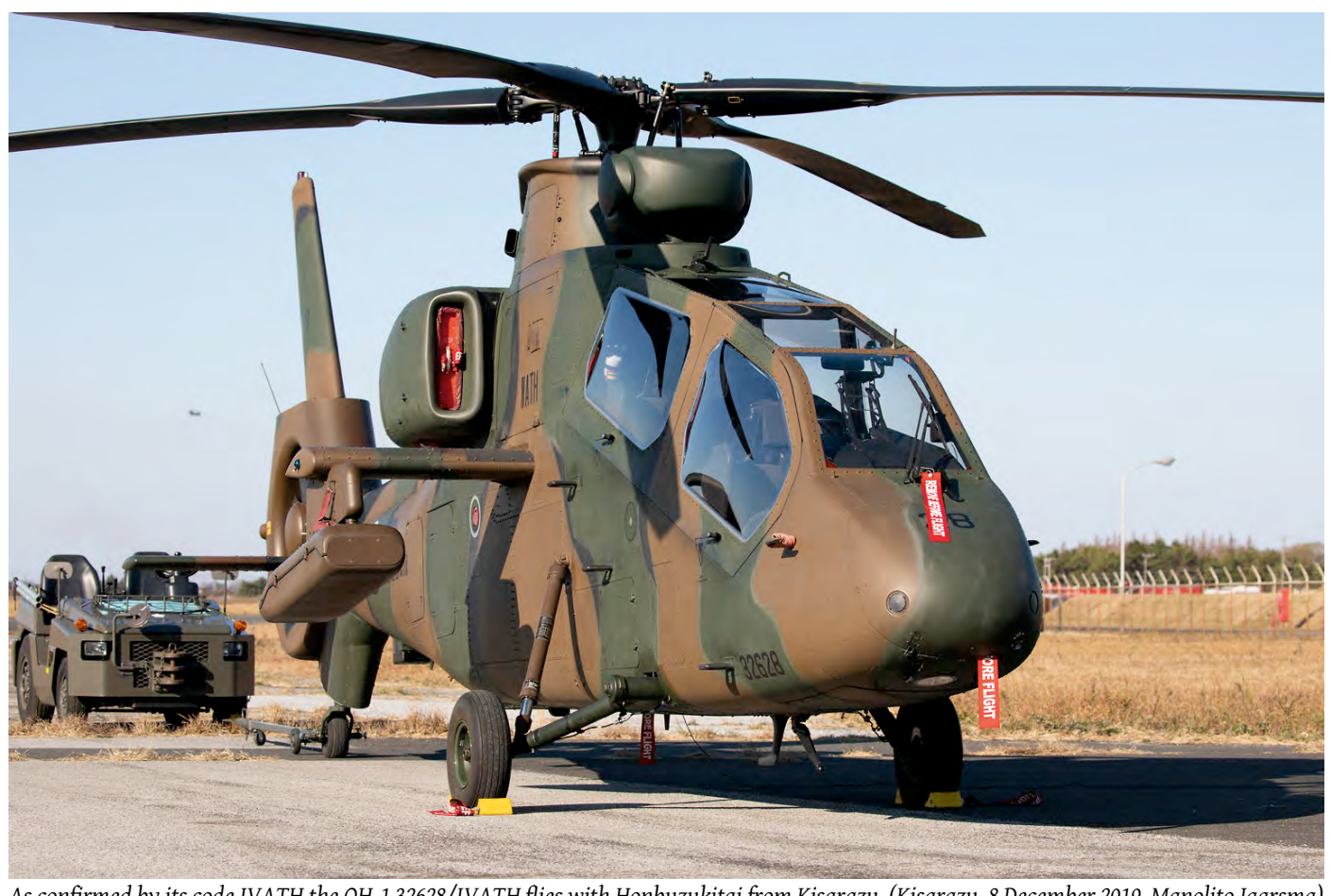
As confirmed by its code IVATH the OH-1 32628/IVATH flies with Honbuzukitai from Kisarazu. (Kisarazu, 8 December 2019, Manolito Jaarsma)

5H-TGF ex TGFA to Air Tanzania 20231 This Fokker 50 was handed over by the Government to boost the Air Tanzania fleet.