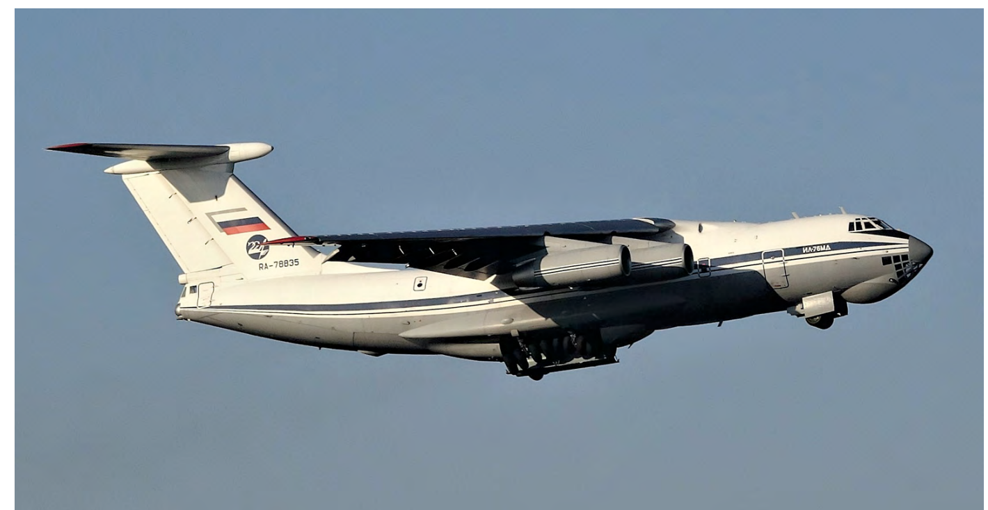
The Libya Conference held in Berlin brought Il-76MD RA-78835 to Berlin-Tegel (17 January 2020,)