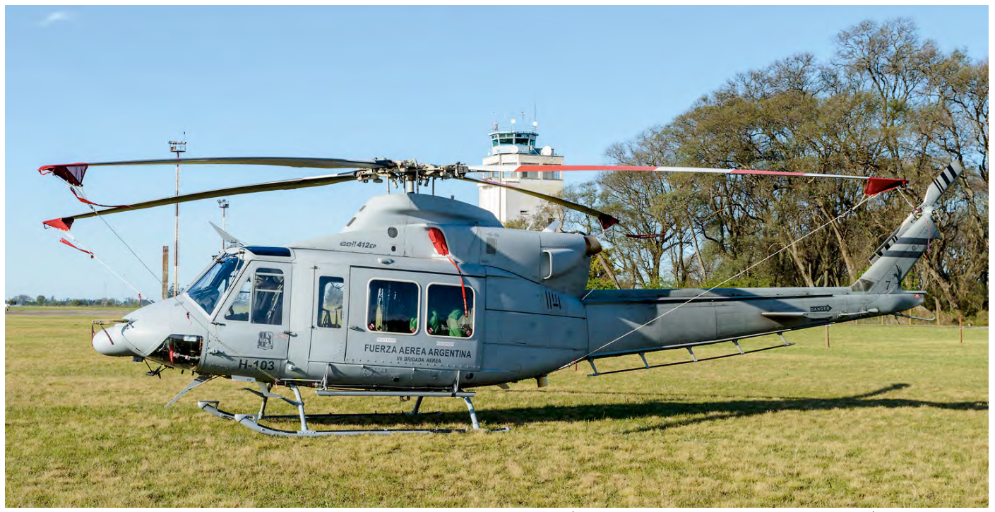
Since 29 January 2018, this Bell 412EP H-103 is used by the Argentinian Air Force. (Reconquista, 6 October 2019, Ton van Bakel)