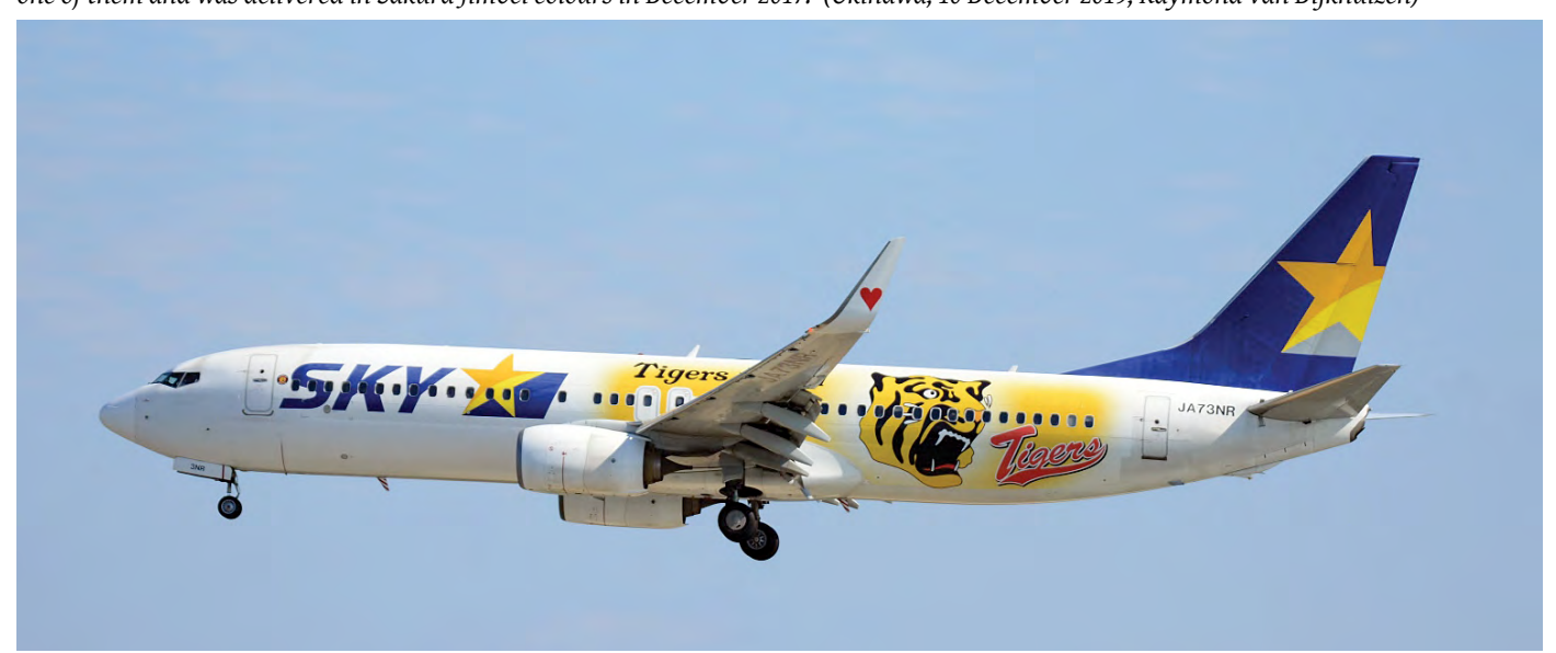
JA73NR is one of the 29 Boeing 737-800 aircraft in Skymark Airlines' fleet. The aircraft is painted in a Hanshin Tigers colour scheme. Hanshin Tigers is a Nippon Professional Baseball team and one of the oldest professional clubs in Japan.