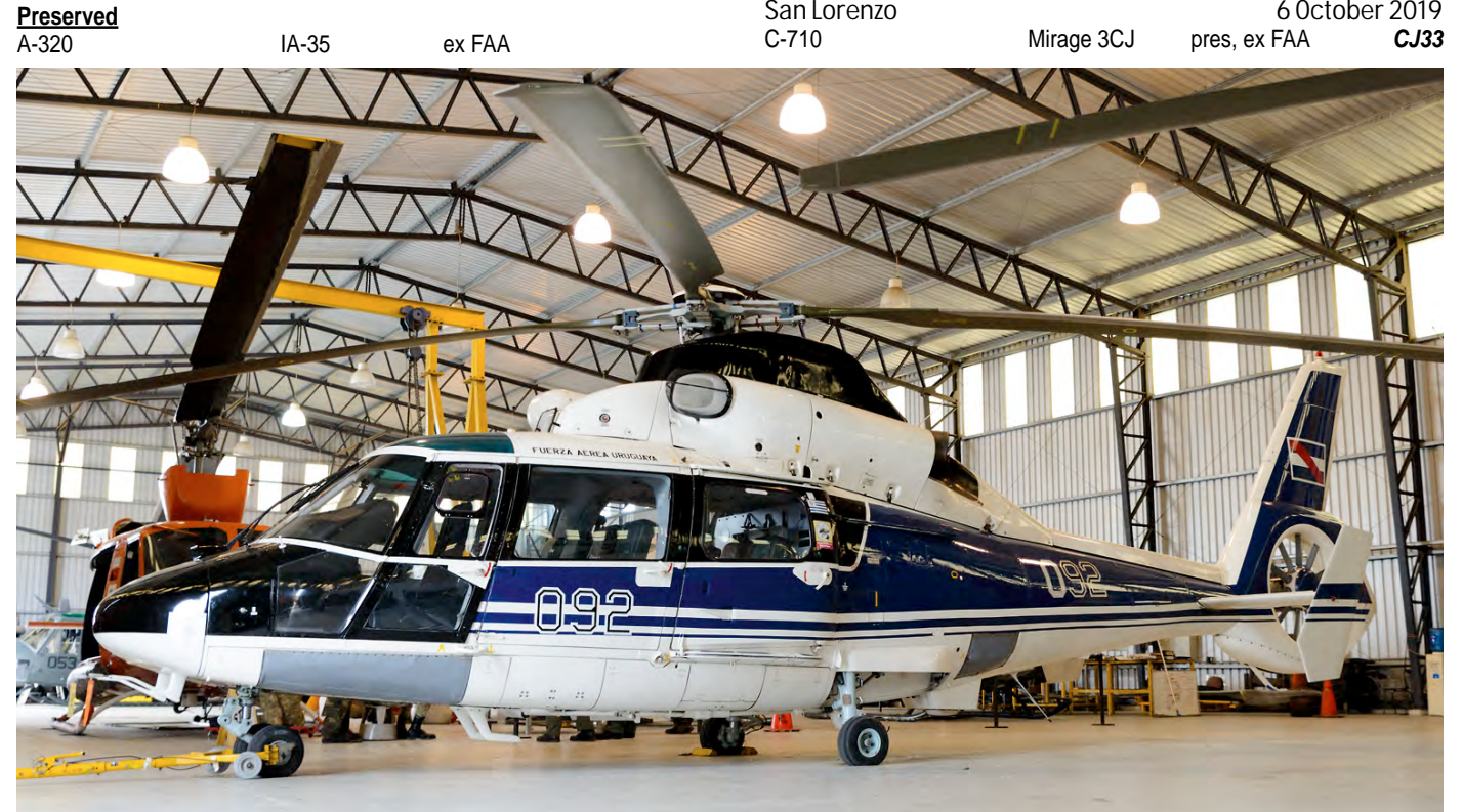
Dauphin 092 of the Uruguayan Air Force was at the second hand market. The helicopter is assigned to EA5 (Helicopteros). Ton van Bakel photographed the AS365N2 at Montevideo International on 3 October 2019.