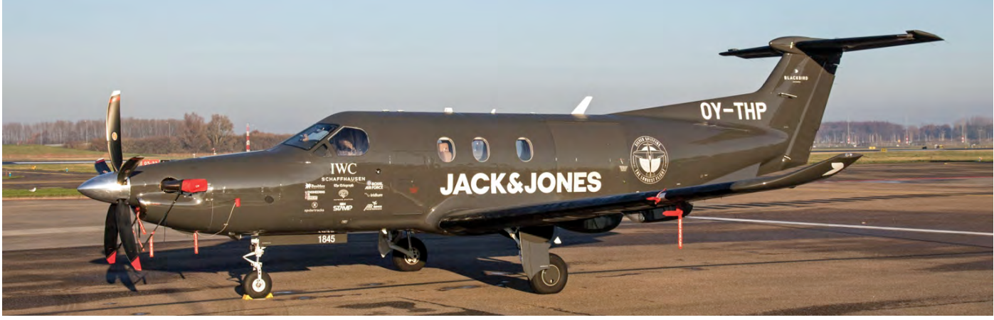
Pilatus PC-12 OY-THP was delivered to Blackbird Air Charter in January 2019. The company provided the Pilatus PC-12 as support aircraft following Silver Spitfire G-IRTY on its flight around the world. The aircraft carried technicians and extra crews for the Silver Spitfire. Both aircraft took off on 5 August 2019 from Goodwood Aerodrome and returned to Goodwood Aerodrome on 5 December after flying around the world. (Lelystad, 4 December 2019, Richard Poeser)