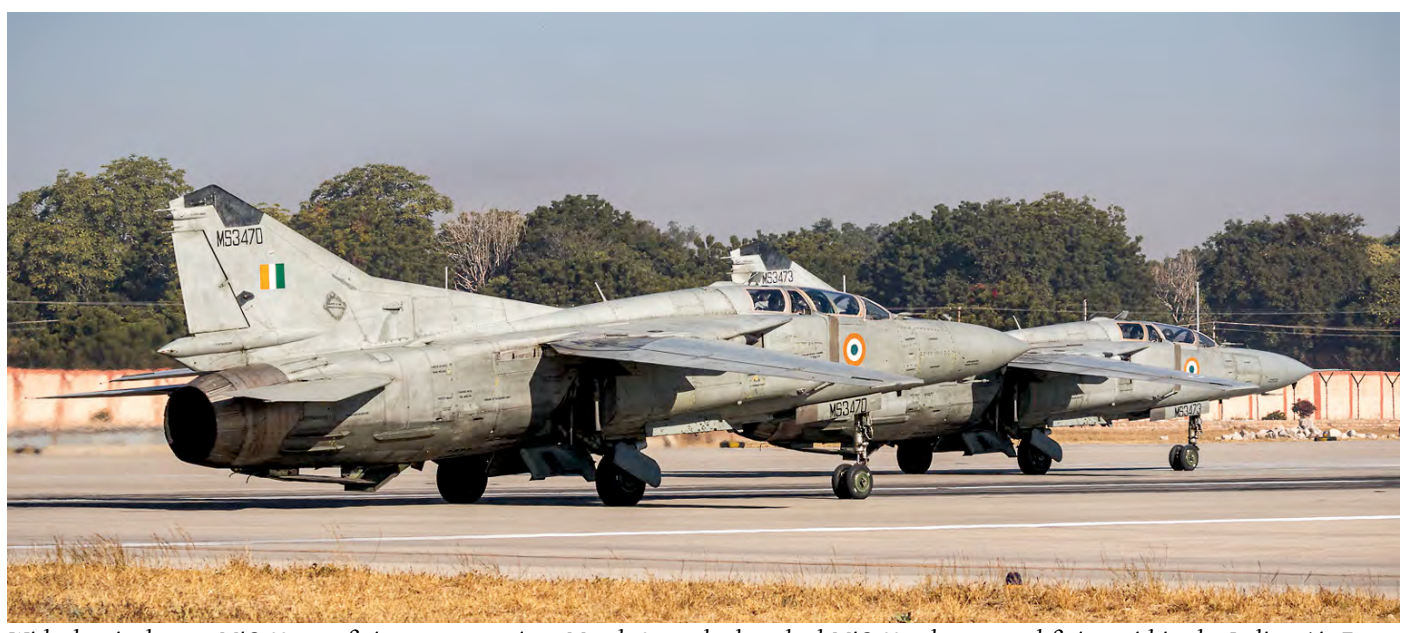
With the single seat MiG-23s not flying anymore since March 2009, the last dual MiG-23s also stopped flying within the Indian Air Force. (Jodhpur, 27 December 2019)

upgraded to the Mirage 2000-5 Mk.2 standard, are included in the contract that is to be completed within the next seven years.