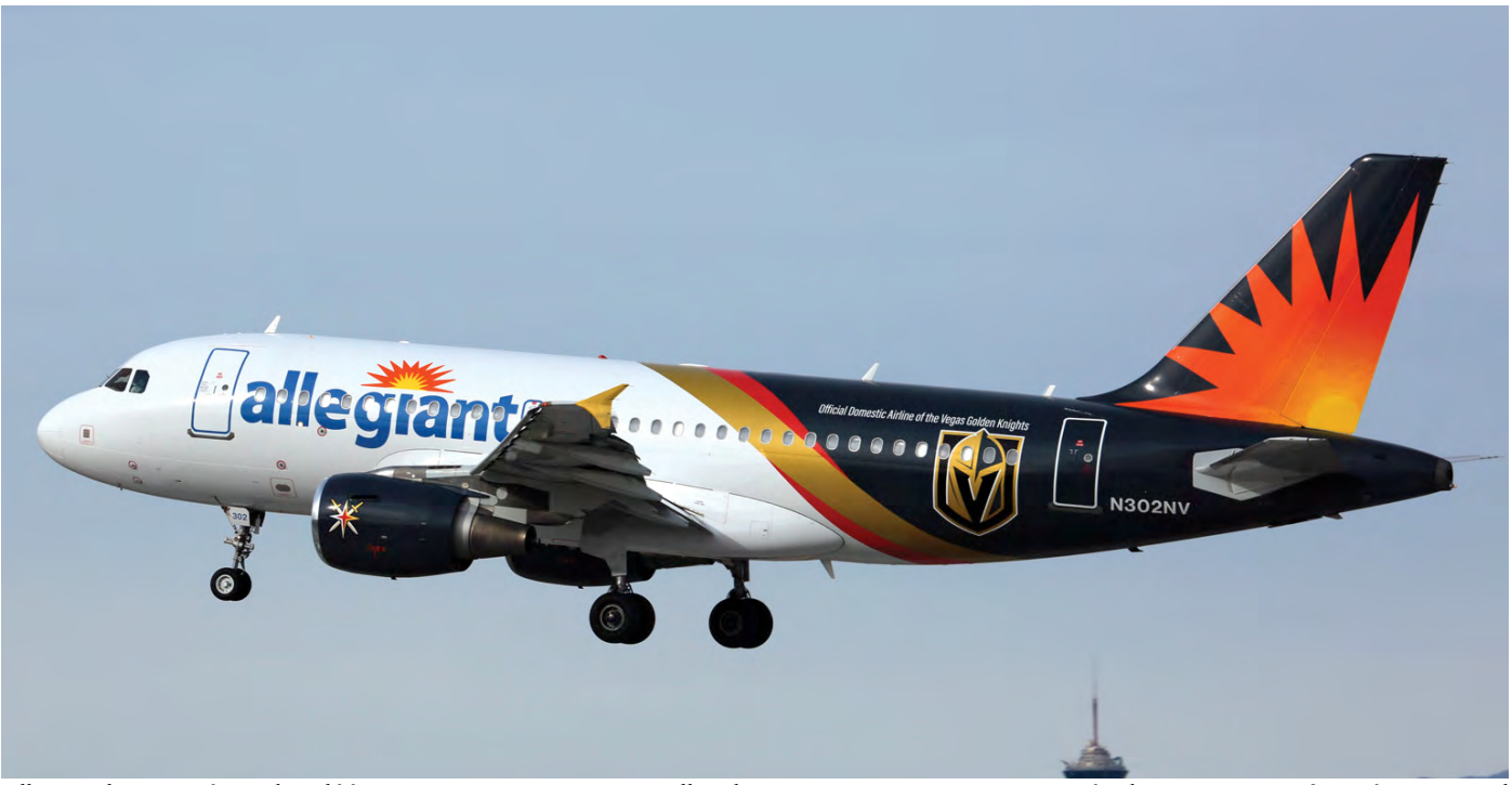
Allegiant has transformed itself from an MD-80 operator to an all Airbus operator in recent years. As of today it operates a fleet of 99 A319 and A320 aircraft. Twelve were ordered new from Airbus, all the others were taken over from other airlines. Seen here is an ex easyJet Switzerland Airbus A319. The aircraft is registered N302NV and is one of the first Airbus aircraft that entered Allegiant's fleet in 2013. In October 2019 the Airbus was painted in special Golden Knights colours. (Las Vegas-McCarran (NV), 01 December 2019)