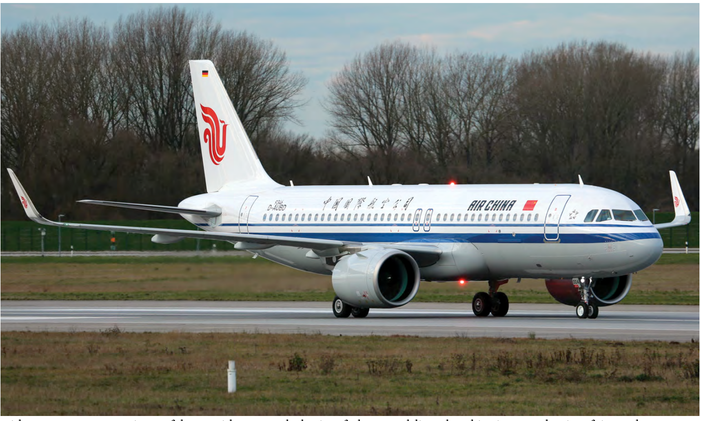
Airbus A320neo MSN 9346 is one of the 136 Airbus narrowbody aircraft that were delivered to China in 2019. The aircraft is seen here at Hamburg-Finkenwerder with test registration D-AUBD on 30 December. The aircraft was delivered to China one day later and arrived in the new year in China with its Chinese registration B-30DA. (Robert Eikelenboom)