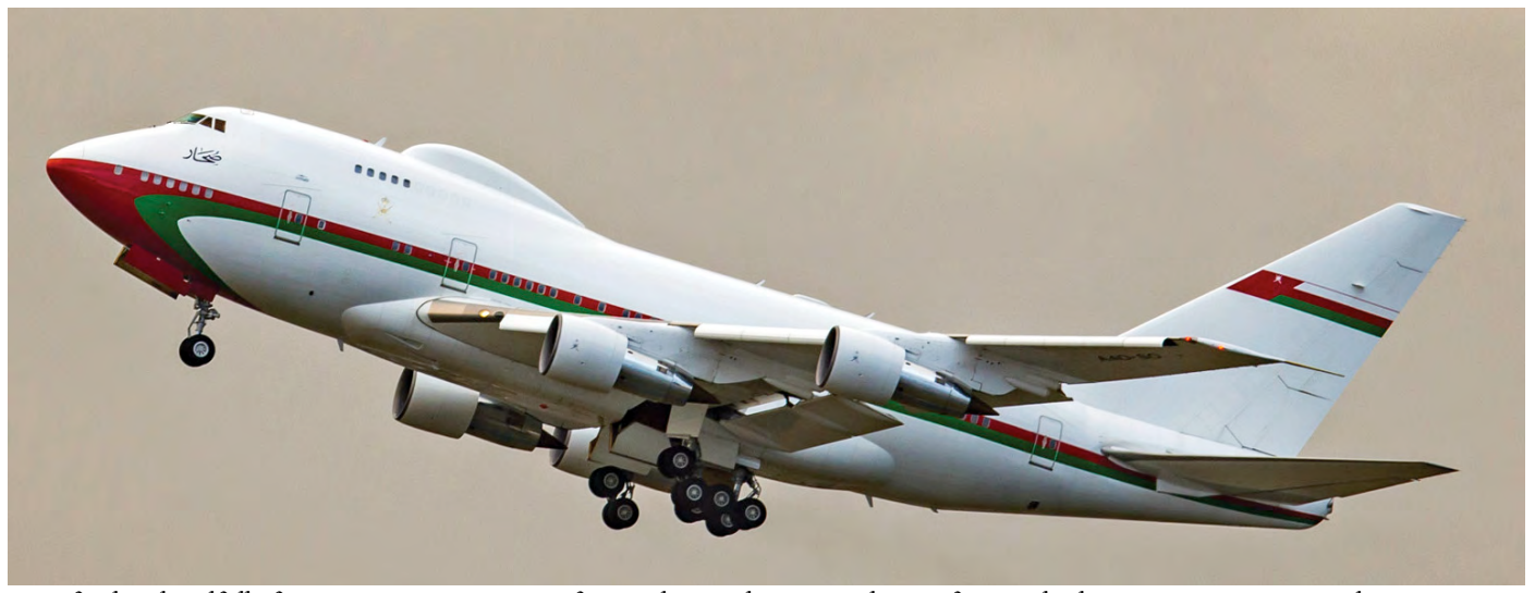
One of only a handfull of active Boeing 747SP aircraft visited Brussels in December. Unforunately the reason was not so good. Its owner was ill and needed treatment. A40-SO is being operated by the Government of Oman, in this case in support of the Sultan of Oman. The aircraft departed to Hamburg on the day this photo was taken apparently for maintenance. (Brussels, 9 December 2019, Jonas Evrard)