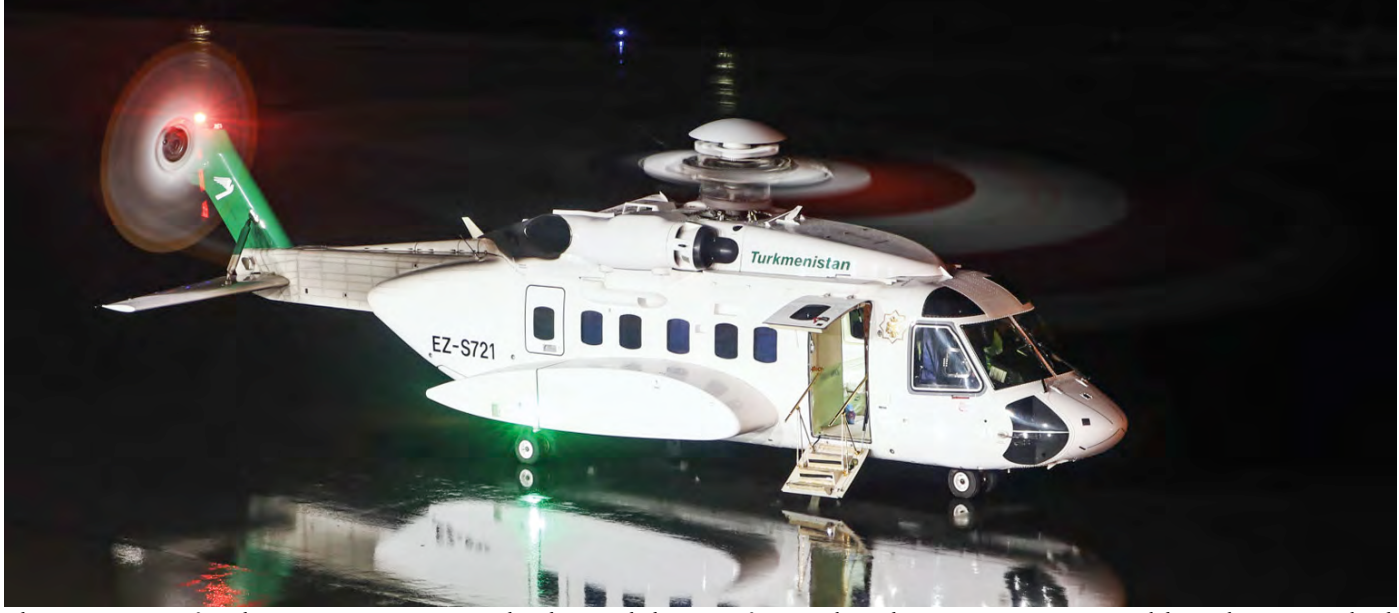
The Government of Turkmenistan operates two Sikorsky S-92 helicopters for presidential transport. EZ-S721 was delivered in 2006 and Nik Deblauwe photographed the helicopter at Ostend on 16 December 2019.