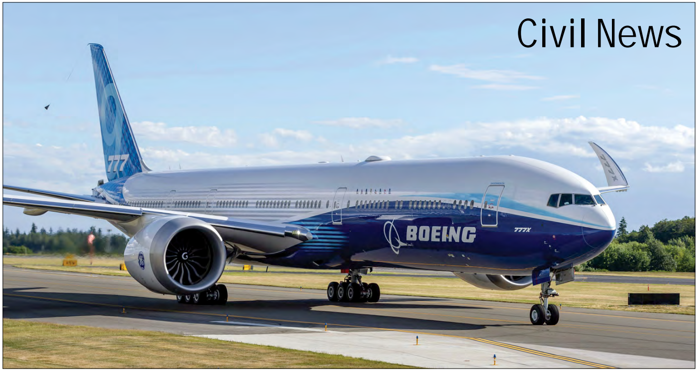
We had hoped the Boeing media site would have plenty photos to choose from of the Boeing 777X first flight that should have haven taken place the evening before the deadline of this month's Scramble edition. Unfortunately due to gusty conditions at Everett (WA), the maiden flight was postponed, so no photos of a flying 777-9 but one made earlier under much beter weather conditions.