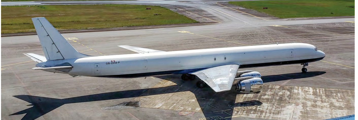
The visit of DC-8 OB-2059-P was probably the highlight for 2019. The 50+ year old freighter is operated by SkyBus Cargo Charters. (Paramaribo, 7 December 2019,)