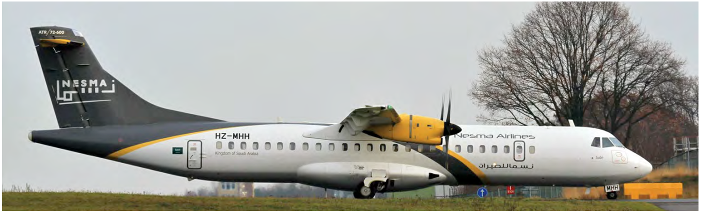
Nesma Airlines took delivery of ATR 72 HZ-MHH in March 2016. It was ferried to Woensdrecht where it arrived on 11 December 2019 apparently for storage. Ralph Hamaker was able to capture the aircraft shortly after its arrival.