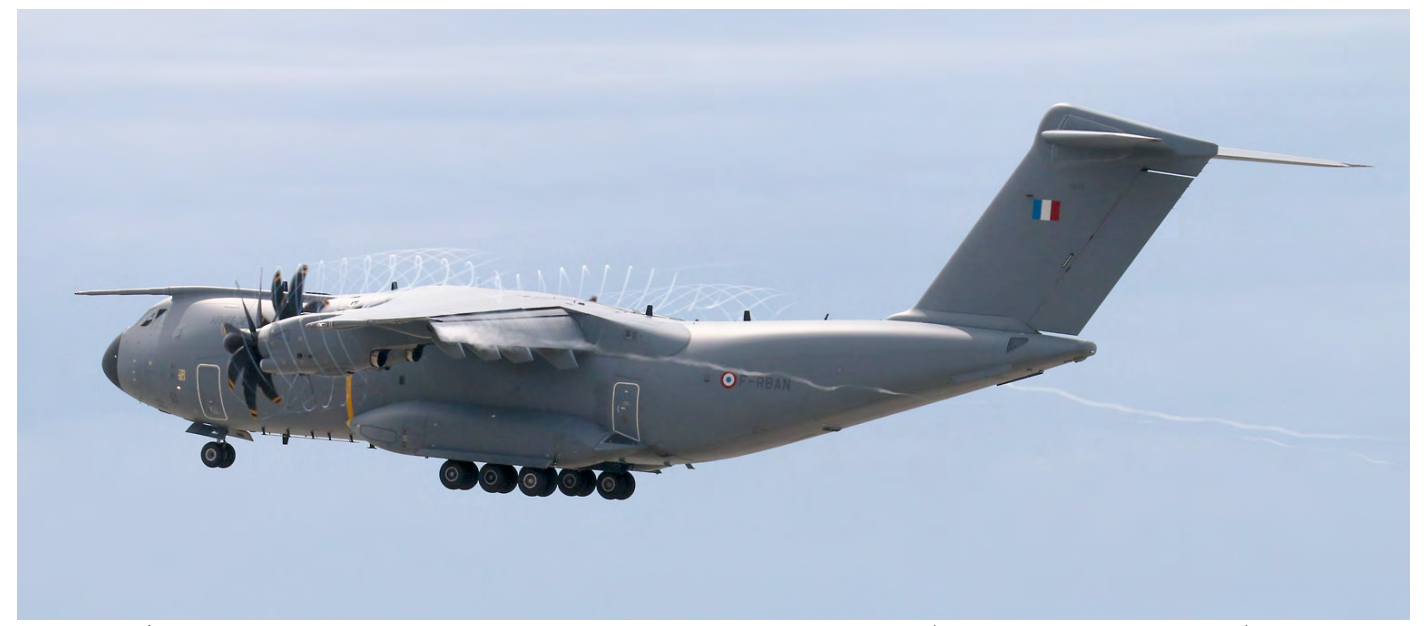
A400M 0073/F-RAFN is one of the seventeen A400s delivered to the French Air Force by now. (Jullouville beach, 4 August 2019)

The Greek Ministry of Defence announced that it signed a maintenance contract to upgrade the Mirage 2000-5 fighters operated by the Elliniki Polemiki Aeroporia on 23 December 2019. The agreement was announced when Parliament passed legislation to strengthen the Air Force. The upgrade will be carried out by Dassault Aviation in cooperation with Safran Military Engines and Thales. The contract comprises the upgrade and sustainment of the aircraft's radar, avionics, electronics and engines. In total fifteen Mirage 2000-5 Mk.2 acquired in 2007 and ten Mirage 2000-5 aircraft, which were acquired earlier in 1988 as Mirage 2000EGM and already