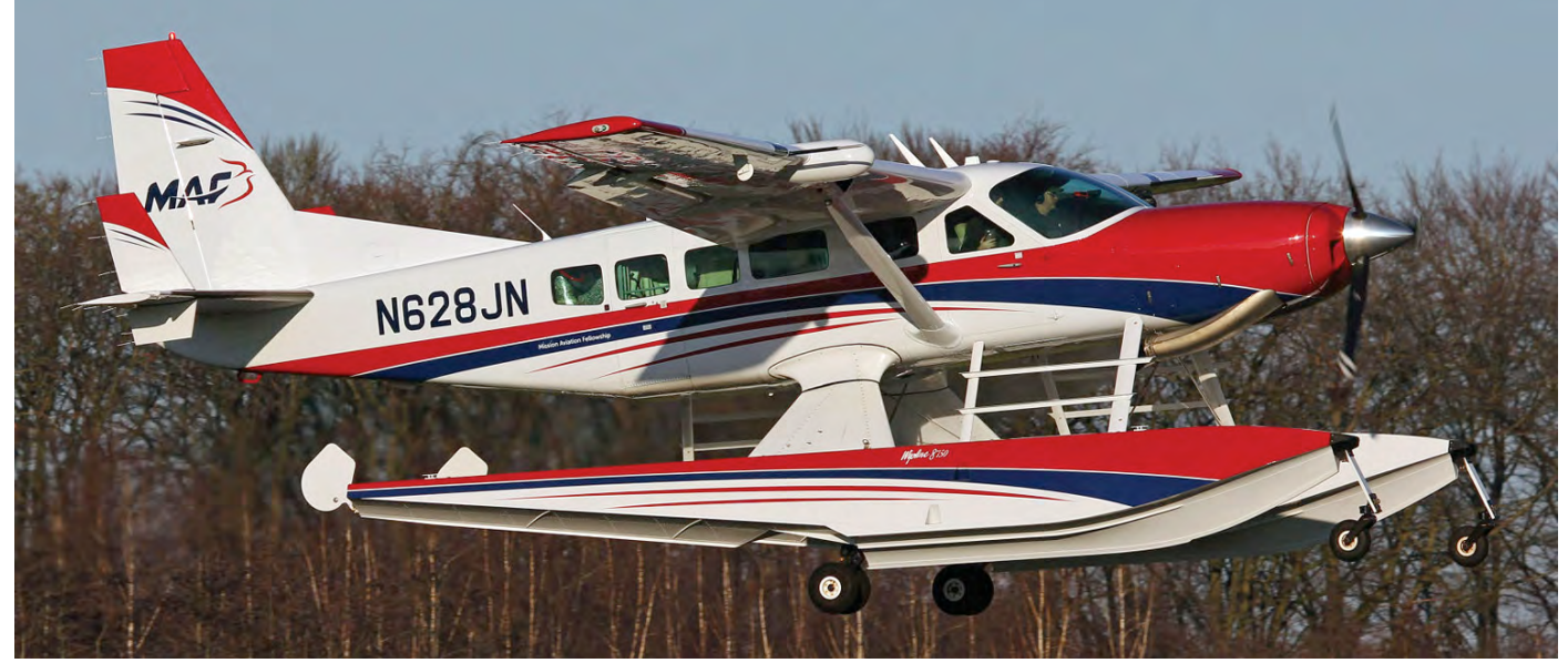
More foreign registered Cessna 208 find their way to Teuge for maintenance work. N628JN was a very welcome visitor before it continued to Bangladesh. The MAF aircraft was caught on camera when it began its journey to its final destination. (Teuge, 27 December 2019, Pino Tome)