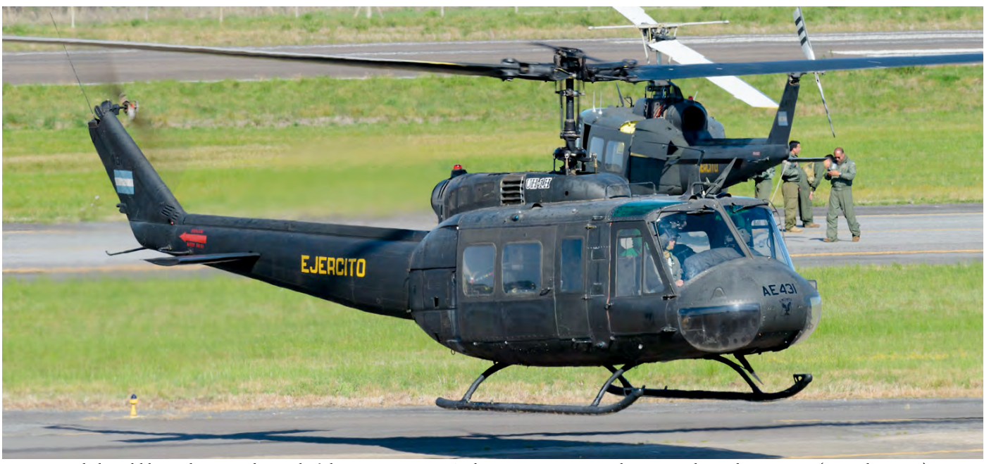
Ton van Bakel could hear the typical sound of the Huey in Paraná when AE-431 was seen hovering above the runway. (5 October 2019)