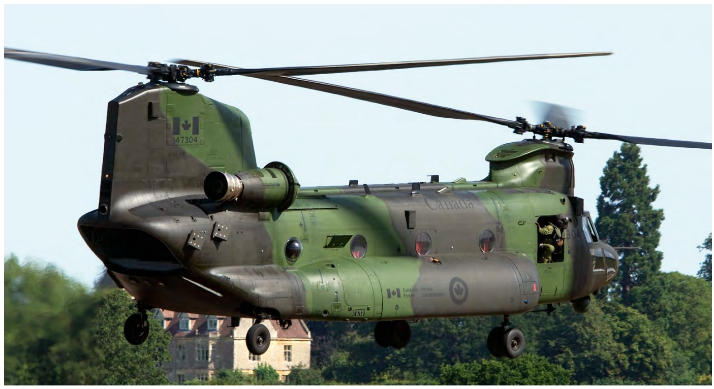
Another one of the highlights was the first visit of a Royal Canadian Air Force CH-147F. 147304 is seen here during its departure to RAF Odiham, where it spent another couple of days training with the local Chinooks of the RAF. (Fairford, 17 July 2017, Rene Liebe)