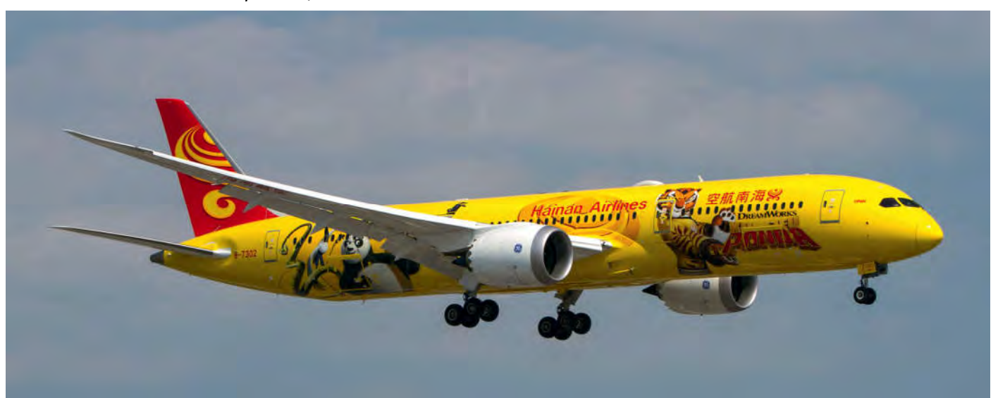
Another logojet for Hainan is Boeing 787 B-7302 painted in a stunning yellow colour scheme adorned with the lovable characters from the Dreamworks Kung Fu Panda animated film. It is seen landing at Toronto-Lester B. Pearson International (Ont.) on 11 June 2017.