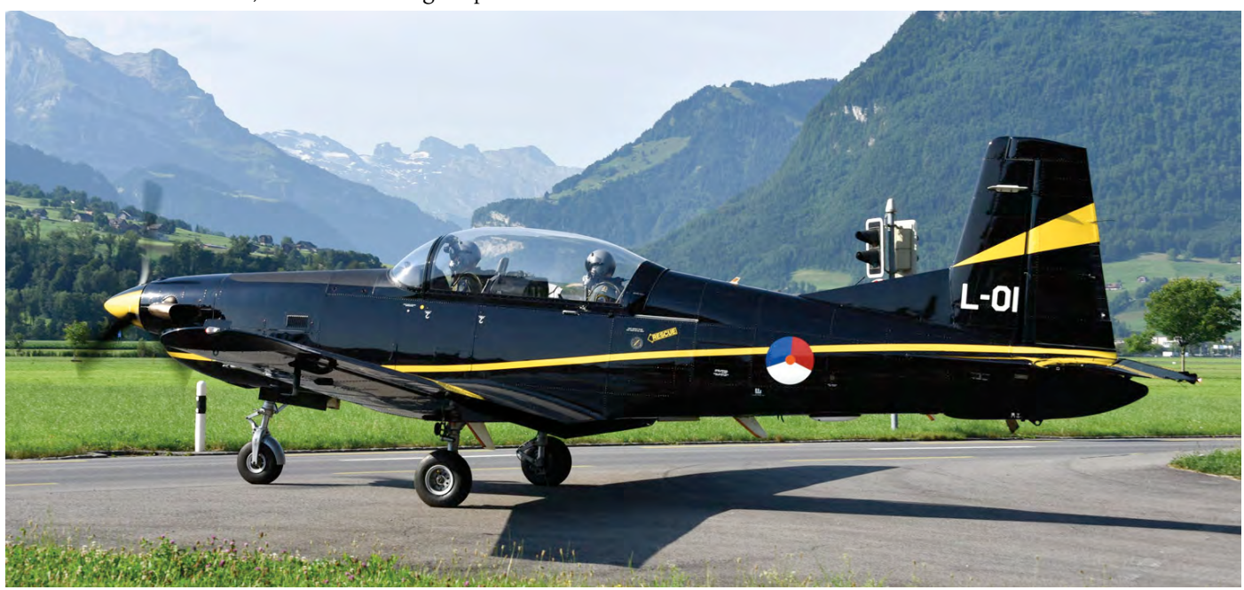
On 19 July 2017, the first upgraded RNLAF PC-7 L-01 was re-delivered from Stans-Buochs after receiving various modifications. During the testing and certification phase, Pilatus was officially the owner of the aircraft and flew it with its c/n as registration.