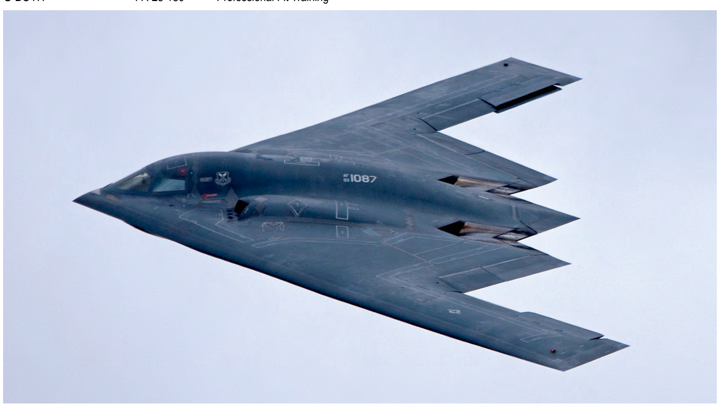
On Sunday, a surprise visit was performed by B-2A 93-1087. It performed two fly-bys in the company of two F-15Cs from RAF Lakenheath. Undoubtedly one of the highlights of this year! (Fairford, 16 July 2017,)