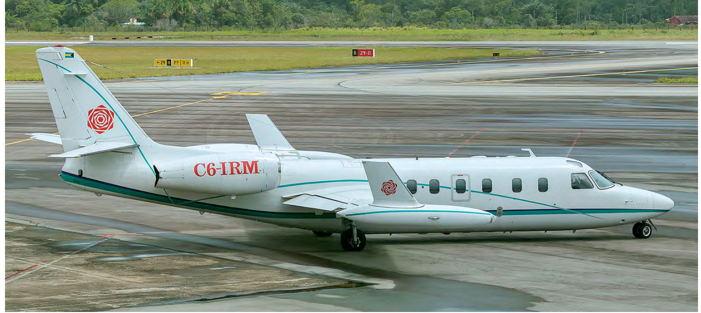
Originally designed in the United States by Aero Commander, the Westwind II is a refined version of the IAI1124 built by Israeli company IAI. The history of this frame is unfortunately incomplete as to the previous operators. It was built in 1985 and delivered in that same year to the first owner as N422AW. It changed registrations a few timed until November 2015 when it took up the current registration C6-IRM. Although it carries a logo, a search on the web did not gave a result as to which company the logo belongs to.