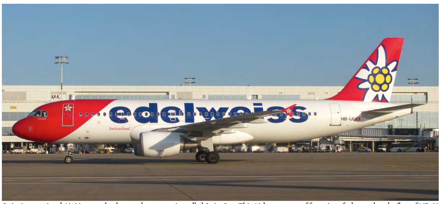
Swiss International Air Lines used to have a charter service called Swiss Sun. This Airbus was one of four aircraft that replaced a fleet of MD-83 aircraft in 2003. HB-IJU was transferred to the main airline in December 2005 and transferred to subsidiary Edelweiss Air in November 2015. (Brussels, 14 June 2017, Eric Vangeel)