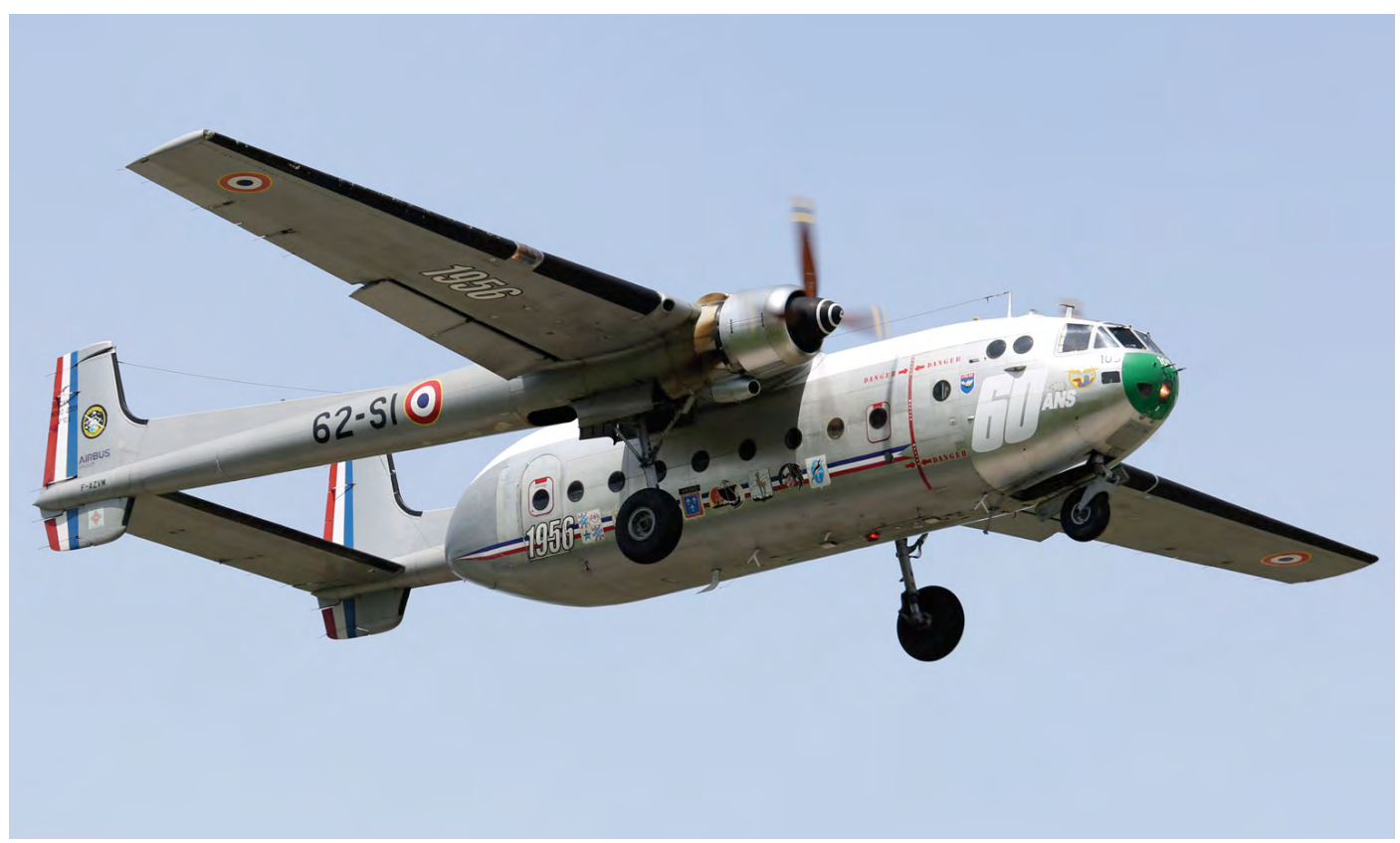
On the 8th of June a small but very well organized spotterday took place at Landsberg am Lech in Bavaria, Germany. As LTG61 is to be disbanded by the end of this year one last spotterday and airshow was held. The historical note was made by the French Nord N2501 Noratlas F-AZVM as the West German Air Force operated 171 of them back between 1956 and 1968. (8 June 2017,)