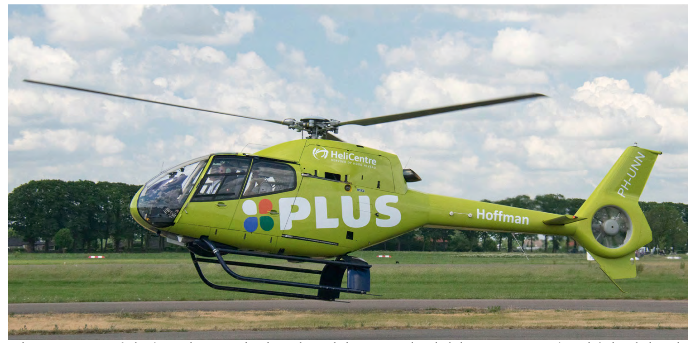
Helicentre is operating flights for Dutch supermarket chain 'Plus' with this EC120B. When the helicopter is not in use for such flights, the branche owners name and the PLUS logo will be temporarily removed from PH-UNN. (Teuge, 4 June 2017,)

The FWIT activities made the majority of the movements in June at Leeuwarden. On the 15th one unfortunate Volkel based F-16 made two precautionary landings with hung practice bombs that refused to leave their launch rails. Two days later the Hoogyliegers foundation arrived with 12 general aviation airplanes to take serious ill children to the sky in the vicinity of Leeuwarden. Highlights of the month has to be the fourship ALCAs from Draken International, arriving all the way from Nellis AFB (CA), transiting through Goose Bay, Keflavik, Prestwick to support the FWIT community with air