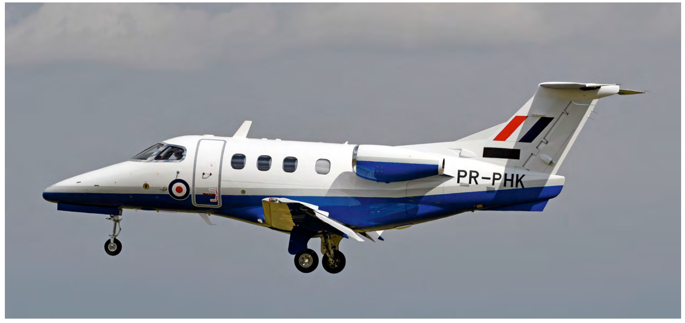
The RAF showed off one of its new training aircraft, the Phenom 100. Officially the aircraft has not been delivered yet, hence it is still wearing its civil factory registration. (Fairford, 10 July 2017) Personal copy 116 Distribution to a third party is not allowed