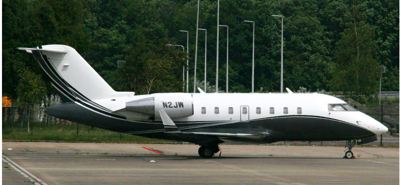
Listed on the FAA website with WB Air Two, Challenger 605 N2JW is actually operating for the Houston based Williams-Kerkher Law Firm since September 2010. (Amsterdam-Schiphol, 23 June 2017,)