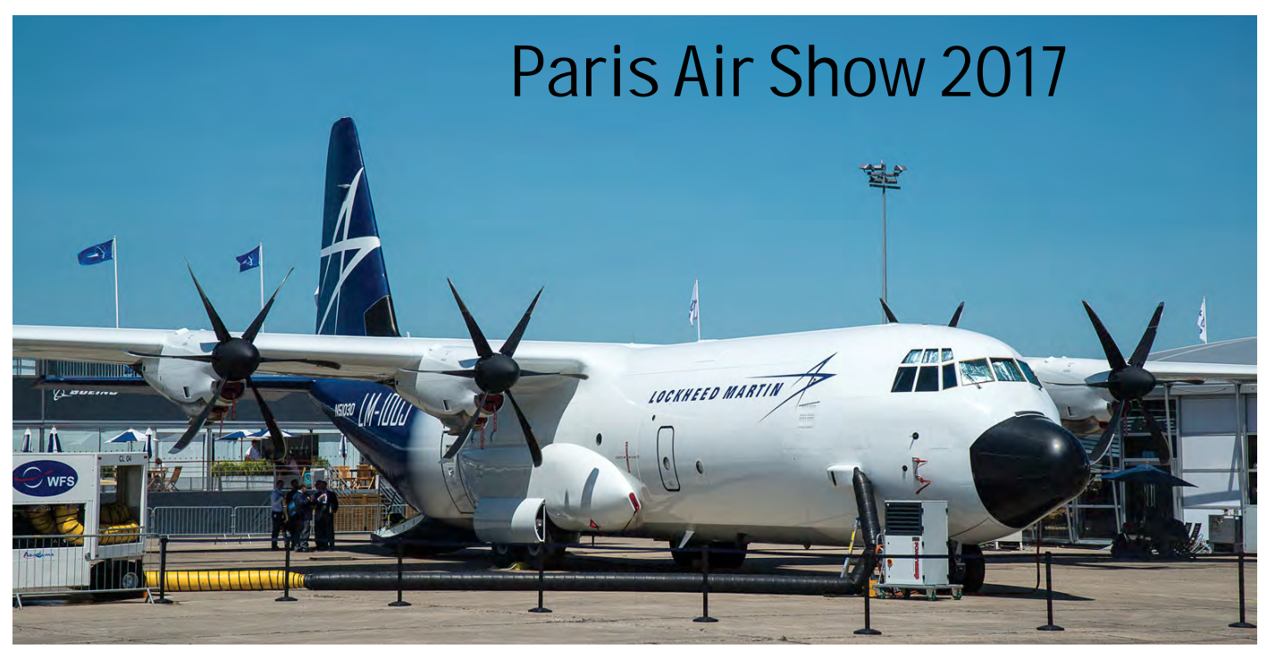
Lockheed Martin is trying to sell its popular C-130J-30 model to civilian customers as the LM-100J. Present for the first time in Paris, with N5103D, the order log rose to 25, with delivery of the first custom LM-100J expected in Q1 2018. (Paris-Le Bourget, 19 June 2017)