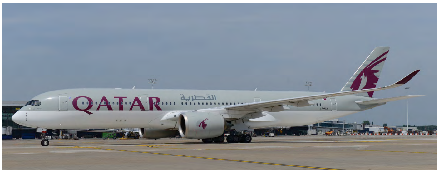
Qatar Airways was the first airline to take delivery of the Airbus A350-900. A7-ALA was transferred from the manufacturer to the airline on 22 December 2014 and arrived in Qatar the next day. The Airbus A350 has replaced the Dreamliner on the service to Belgium. (Brussels, 21 June 2017, Ton Jochems)