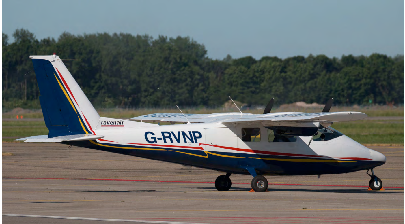
As with all sunny summer days, June had some also. Ravenair is one of the companies operating aereal photo flights from various airport around the country. Partenavia P68B G-RVNP operated by Ravenair was one of many operating these flights. (Lelystad, 14 June 2017, Remco de Wit)