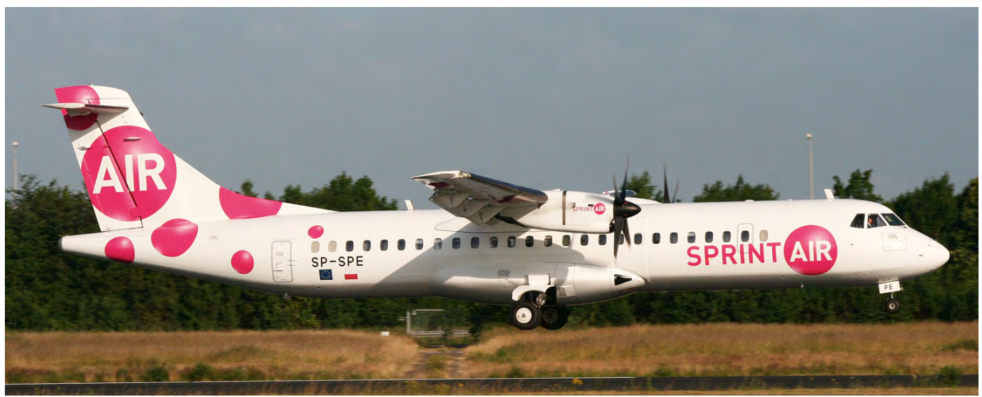
This ATR72 is the sole passenger ATR in the SprintAir fleet. It started its career in 1995 with CityFlyer Express, has spent all of its life in Europe and was acquired by SprintAir in 2016 as SP-SPE. (Maastricht-Aachen, 16 June 2017,)