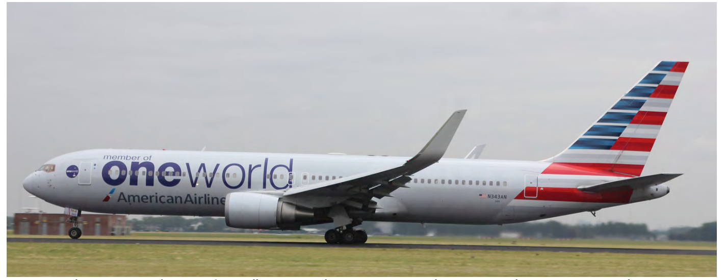
American Airlines inaugurated a service from Dallas to Amsterdam on 6 May 2017 with Boeing 767 and 757 equipment, so a photo in our magazine is wel overdue. N343AN was added to the American Airlines fleet in 2003. The aircraft is flying in Oneworld colours since January 2014. (Amsterdam-Schiphol, 17 June 2017, Paul Zegers)