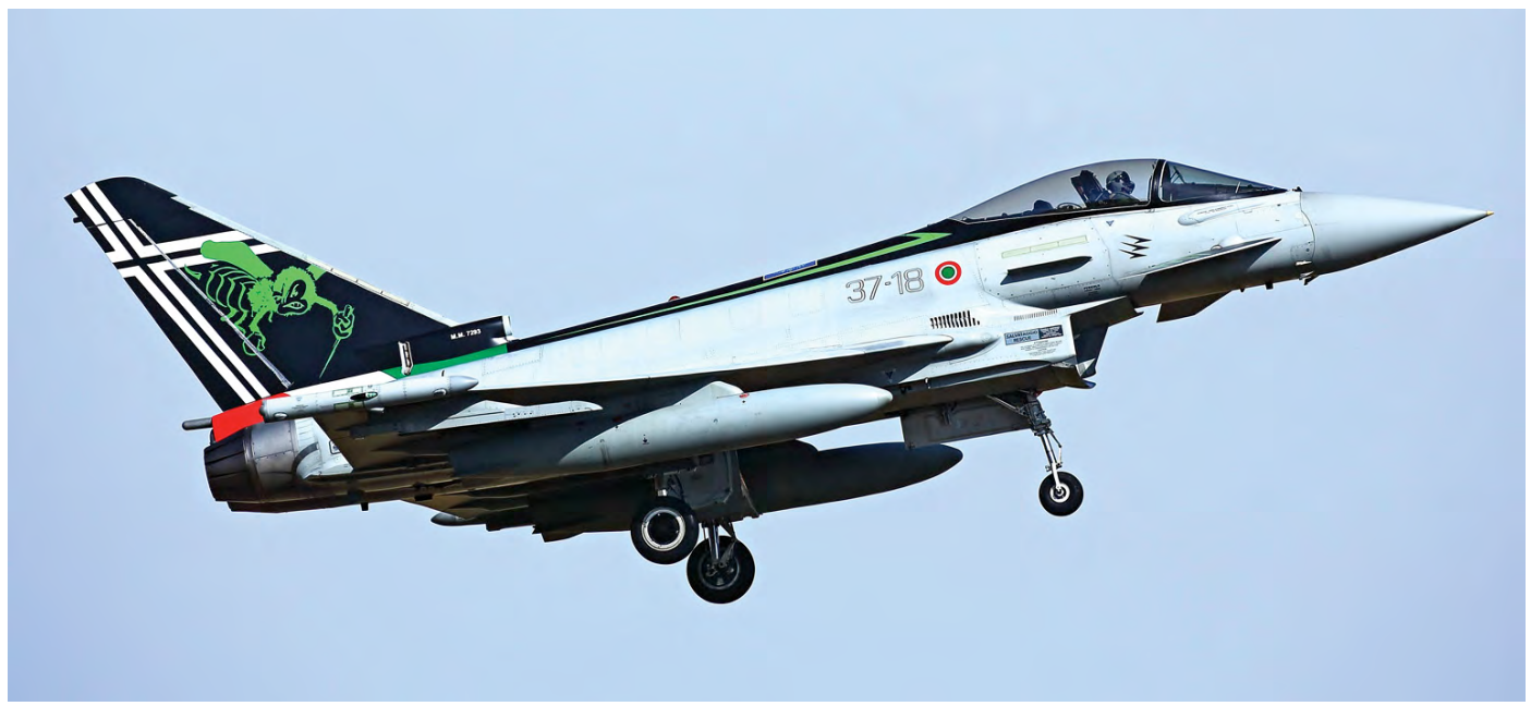
For the 100 year Gruppo Caccia celebrations at Grosseto, several F-2000s were seen with special paint schemes, one of which was MM7293/37-18. This 18 Gruppo Eurofighter is based at Trapani/Birgi. (25 June 2017, Dietmar Fenners)