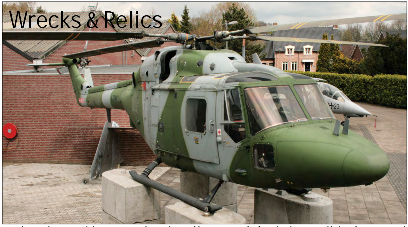
Several ex British Army Lynx helicopters are stored at Baarlo. One of them, AH7 XZ647, has been placed on concrete blocks and is now preserved. (Baarlo, 1 April 2017, Erik Kamphuis)