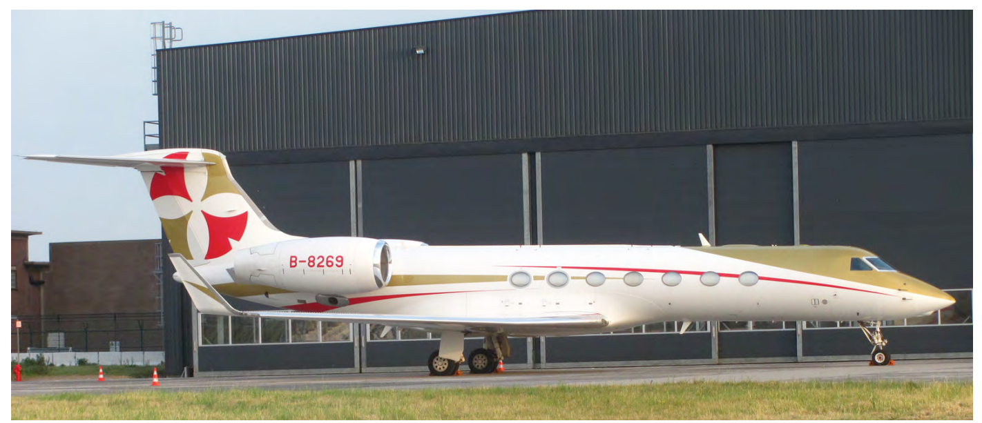
This colourful Gulfstream G550 was delivered to Allpoints Jet in April 2013. Allpoints Jet is based in Chengdu, China and has a fleet of just two Gulfstream aircraft. (Brussels, 1 June 2017,)