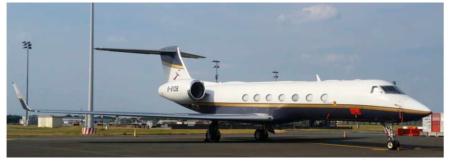
This Gulfstream G550 was delivered to its first operator in 2006. It was added to the Deer Jet fleet in 2010 as B-8108. (Brussels, 1 June 2017, Jan-Pieter Libens)