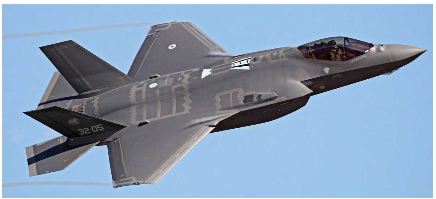
Seen at the non public Italian Air Force 100 year Gruppo Caccia celebrations at Grosseto on 26 June 2017, F-35A MM7336/32-05 was photographed banking after take-off. Probably a type we will not see in 'special' anniversary colours.