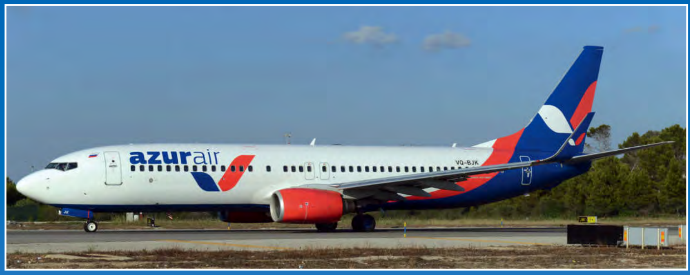
Azur Air is a Russian charter operator. They operate with Boeing 737, 757 and 767s. Boeing 737 VQ-BJK was delivered on 21 December 2016. (Palma de Mallorca, 17 Juni 2017,)