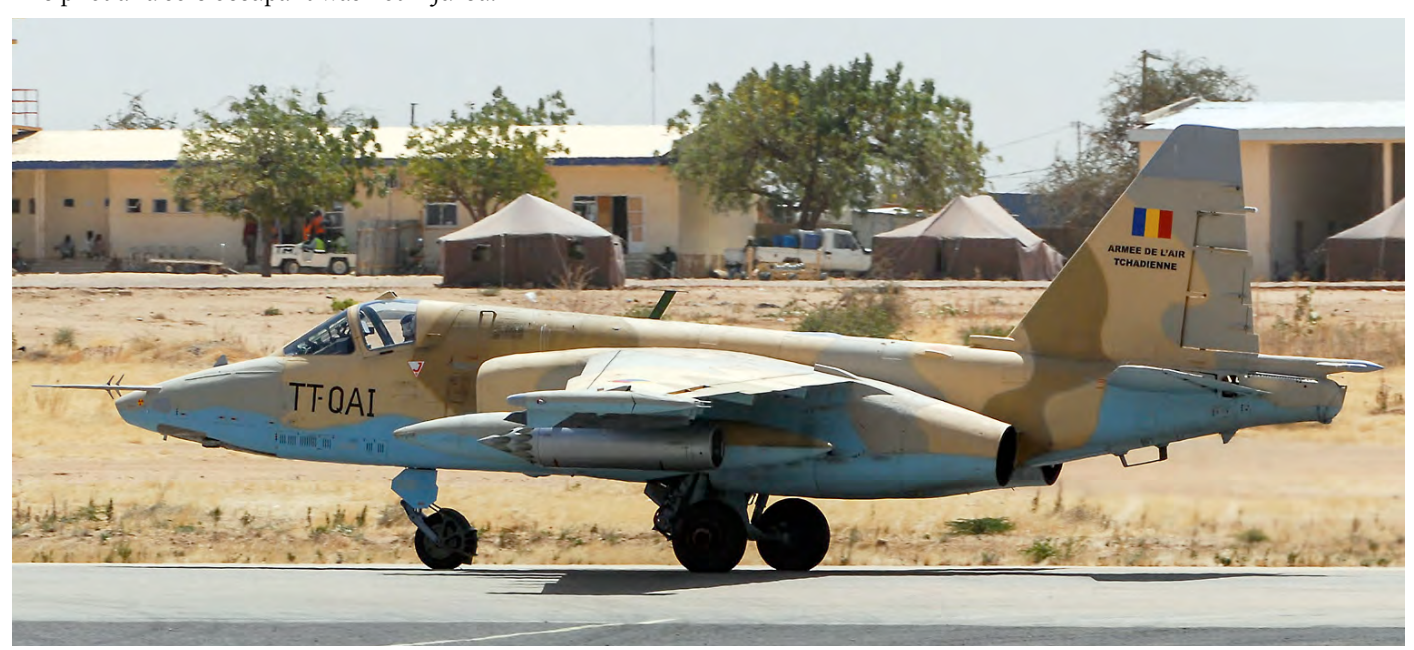
Gale-force winds and torrential rain struck N'Djamena Airport on 1 July 2017, wrecking and damaging a good portion of Chad Air Force's fleet of helicopters, fighters and even a government PC-12. Su-25 TT-OAI (pictured here by an anonymous sender in 2009 in Chad) was one of the substantially damaged fighters.

At least three of <u>Chad's Air Force</u> AS550C2 Fennecs, possibly more, were extensively damaged (and possibly written off) when gale-force winds and torrential rain struck N'Djamena Airport, overturning and breaking the tail booms off at least two of them, while the cockpit of another was smashed. Photos show that also substantially damaged were MiG-29 TT-OAP, Su-25 TT-QAI, Su-25UB TT-QAM and a PC-12 (presumably TT-AAF, the only one known to be in service), which were in light weight shelters that were torn apart by the gales. Further details are unconfirmed, but local sources reported that almost all of the small Chadian Air Force fleet was damaged to some extent, with only one transport, an An-26, plus the Presidential aircraft, escaping unscathed. In addition three French Air Force aircraft, a C-135FR and two CN235s, were also reported to have sustained some damage.