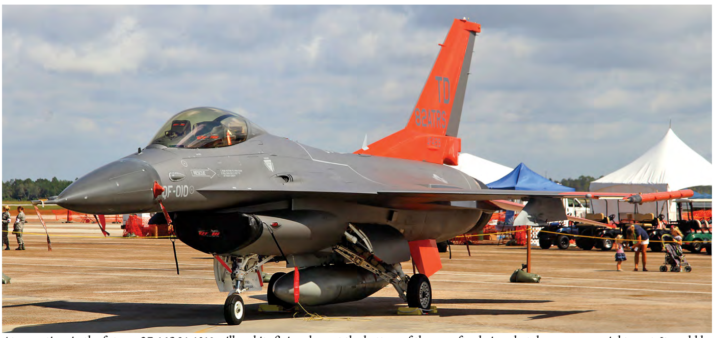
At some time in the future, QF-16C 84-1219 will end its flying days at the bottom of the sea after being shot down as an aerial target. It could be photographed at the Tyndall AFB (FL) Open House & Airshow on 23 April 2017.

being quieter, the General Electric engines are more efficient and provide 22 percent more thrust. A total of 52 C-5s are contracted to be modernized aircraft through the Reliability Enhancement and Re-Engining Program (RERP). With modernized avionics, the C-5M is designed to extend its service life well beyond 2040.