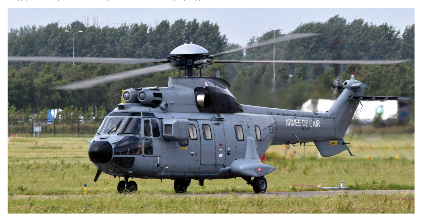
French Air Force VIP-helicopters are unique in their visits to The Netherlands. AS332L1 Super Puma 2235/FZ turned out to be a welcome exception as she arrived on 12 June 2017 from RAF Northolt and left late the following day to France. (Amsterdam-Schiphol, 12 June 2017, Ben Uffen)