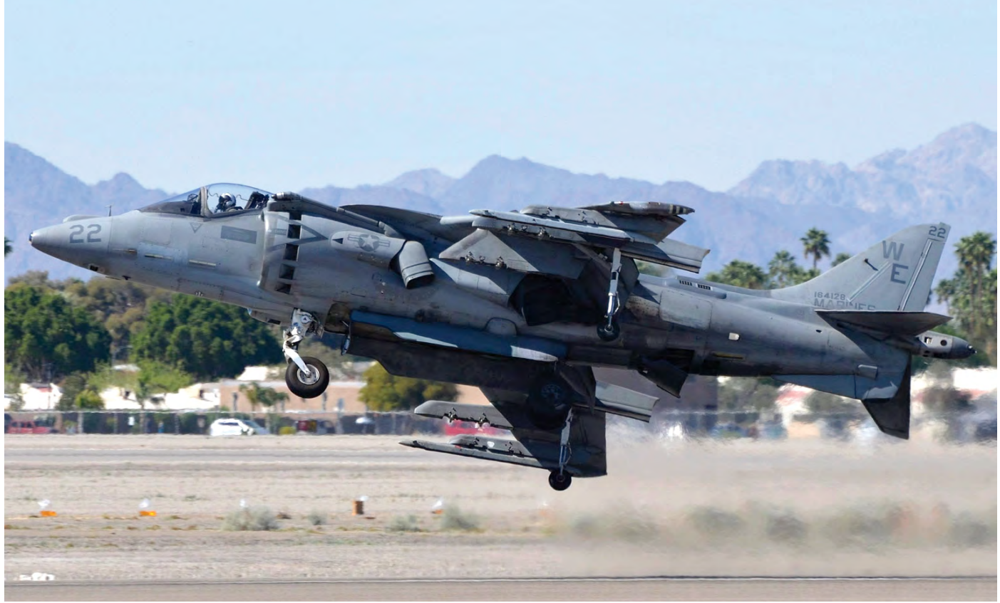
Impressive take-off of AV-8B 164128/WE-22 of VMA-214 from Yuma MCAS (AZ) on 18 March 2017, where Stephan Ehrig photographed this 'Black Sheep' asset in, as always, difficult very hot (heat waves) circumstances.