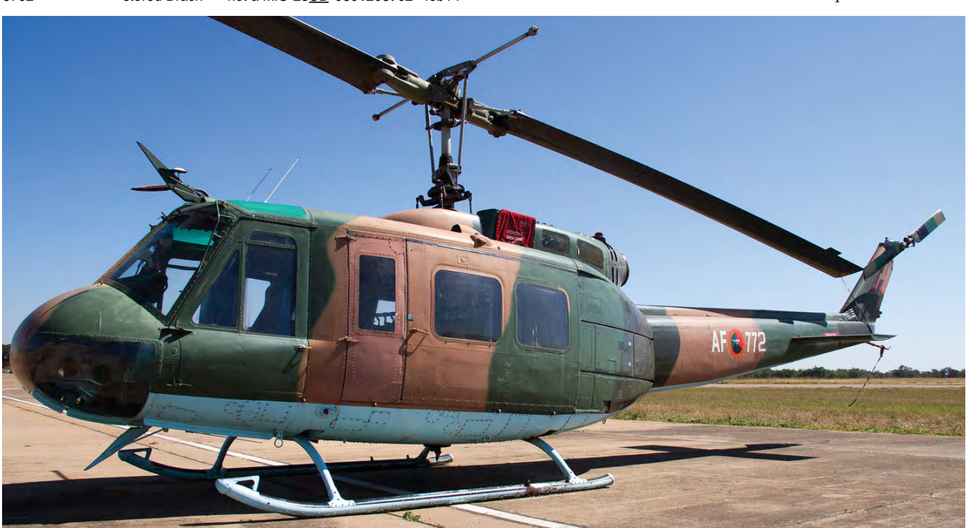
As not many spotters have the opportunity to visit Zambia, let alone photograph Zambia Air Force aircraft and helicopters, we thought it a good idea to publish some in this issue of Scramble. AF772 is an AB205A. (Lusaka/Kenneth Kaunda Intl, 26 May 2017,)

One of the L-39s delivered to Mozambique in 2015 was