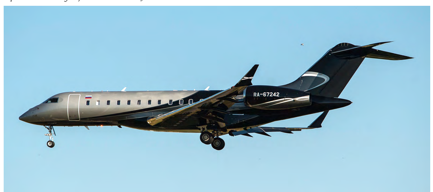
One of the more interesting visiting bizjets was this RA registered Global Express XRS. The aircraft has been carrying RA-67242 since January this year but already called Russia its home before, since it used to fly around as M-SSSR. (Paris-Le Bourget, 18 June 2017,)