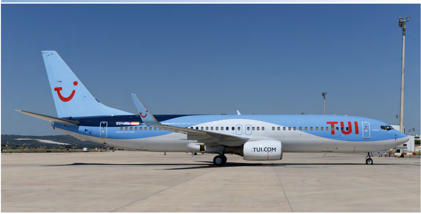
A Spanish registered TUI aircraft? Does that mean that after Germany, the UK, Sweden, Belgium and the Netherlands, there will be a new European TUI subsidiary TUI flySpain? Well none of this all, EC-JBL is just a former Air Europa 737-800 aircraft which was delivered to TUI fly Belgium as OO-TUP on 7 July 2017. It is seen here at Palma de Mallorca prior to its delivery to Brussels, already painted in full TUI colours but still with its Spanish registration EC-JBL. (18 June 2017)