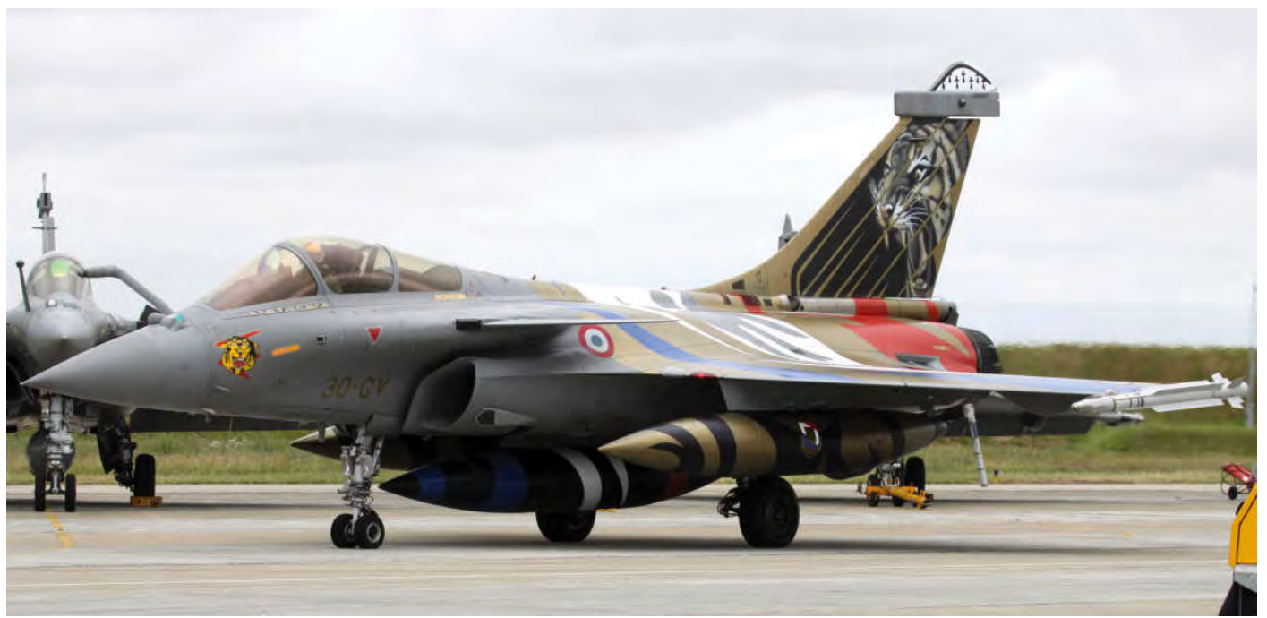
This year the NATO Tiger Meet was hosted at BAN Landivisiau. One of the many participants iwas Rafale C 143/30-GV in full Tigers colours taxiing along the flight line. (Landiviseau, 8 June 2017,)