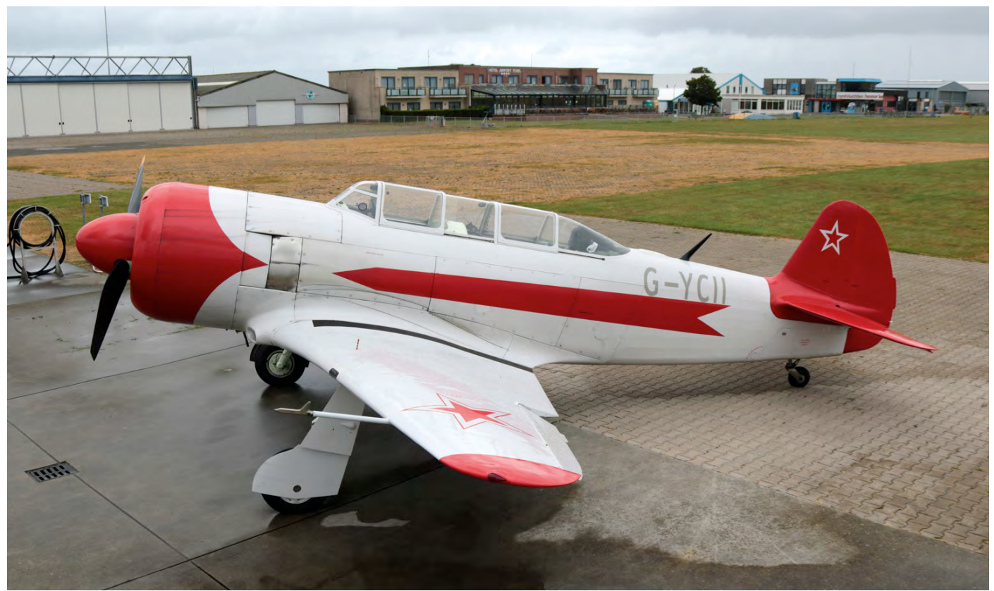
The Yak-11 was designed as a training aircraft. Production started in 1947 with some licence-built by Let in Czechoslovakia as the C-11. G-YCII entered the registry in 2000. It was deregistered on 21 June 2017 as exported to Finland. (Texel, 7 June 2017, Mike de Bruijn)