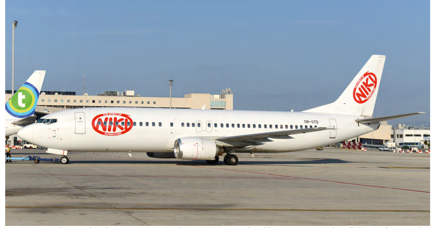
Many European charter airlines hire extra capacity for the summer season. Airlines like Avion Express and Small Planet Airlines can place many of their relatively older Boeing 737 and Airbus A320 aircraft on ACMI basis with other airlines. Go2Sky is also active in this market. They won a contract from Niki to operate this 1993 built 737-400 for the summer season. OM-GTD is white with large red Niki titles and logos. (Palma de Mallorca, 19 June 2017)