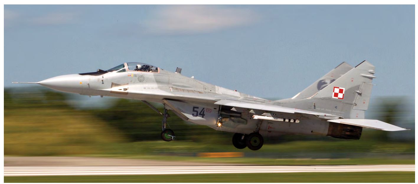
Seen landing at Malbork airbase on Monday 19 June 2017 is MiG-29A 54 from 1. Eskadra Lotnictwa Taktycznego (1.elt). Due to runway repairs at their homebase, eleven MiG-29s from Minsk Mazowiecki deployed to Malbork airbase for a stay until August.