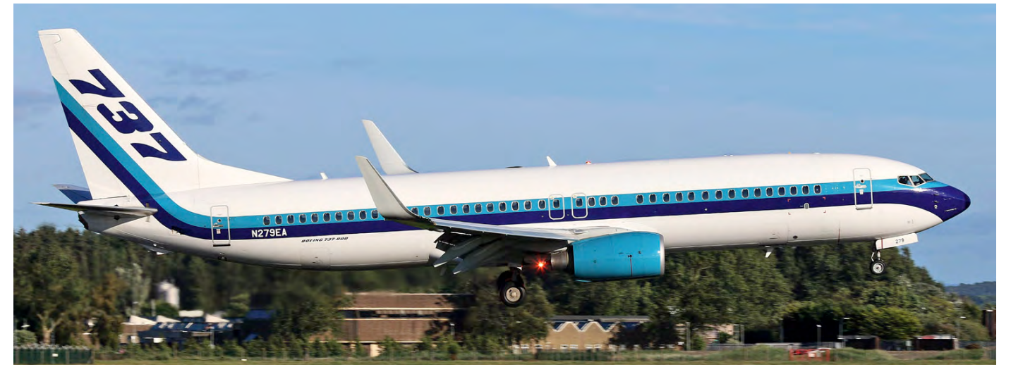
The "new" Eastern Air Lines is still struggling to grow as a serious airline. They added six Boeing 737-800s to their fleet and have orders for ten 737 MAX 8s and even twenty MRJ90s. Recently they already phased out three 737-800s, which they had only added to their fleet less than one year ago. One of them is this 737-800 N279EA that was returned to the lessor, who placed the aircraft on a new lease with Meridiana. The aircraft is pictured here still in full Eastern Air Lines colours at Shannon while on its way to Olbia. It was probably one of the last chances to picture this aircraft in full Eastern Air Lines colours and with its US registration. (30 June 2017, Malcolm Nason)