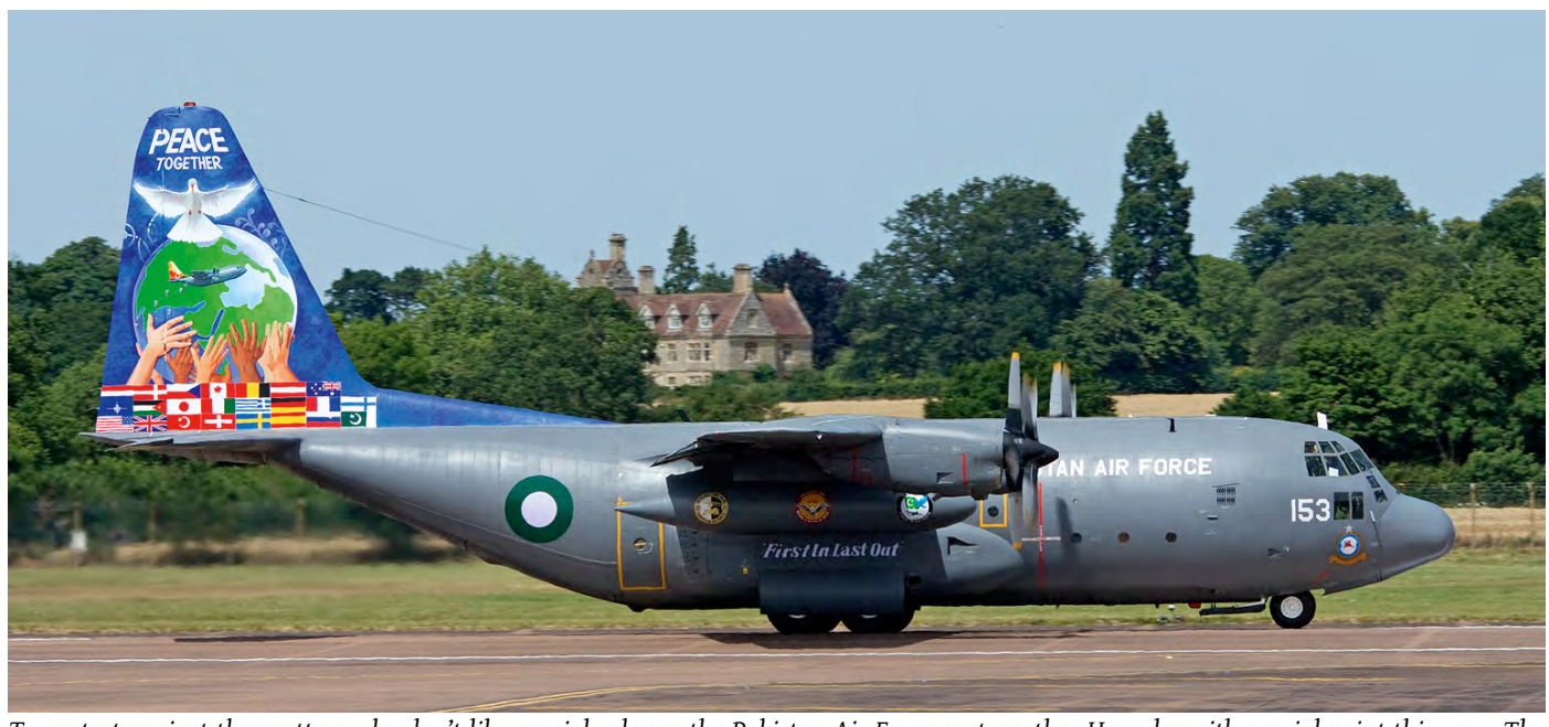
To protest against the spotters who don't like special colours, the Pakistan Air Force sent another Hercules with special paint this year. The honour this year fell to C-130E 4153. (Fairford, 17 July 2017,)