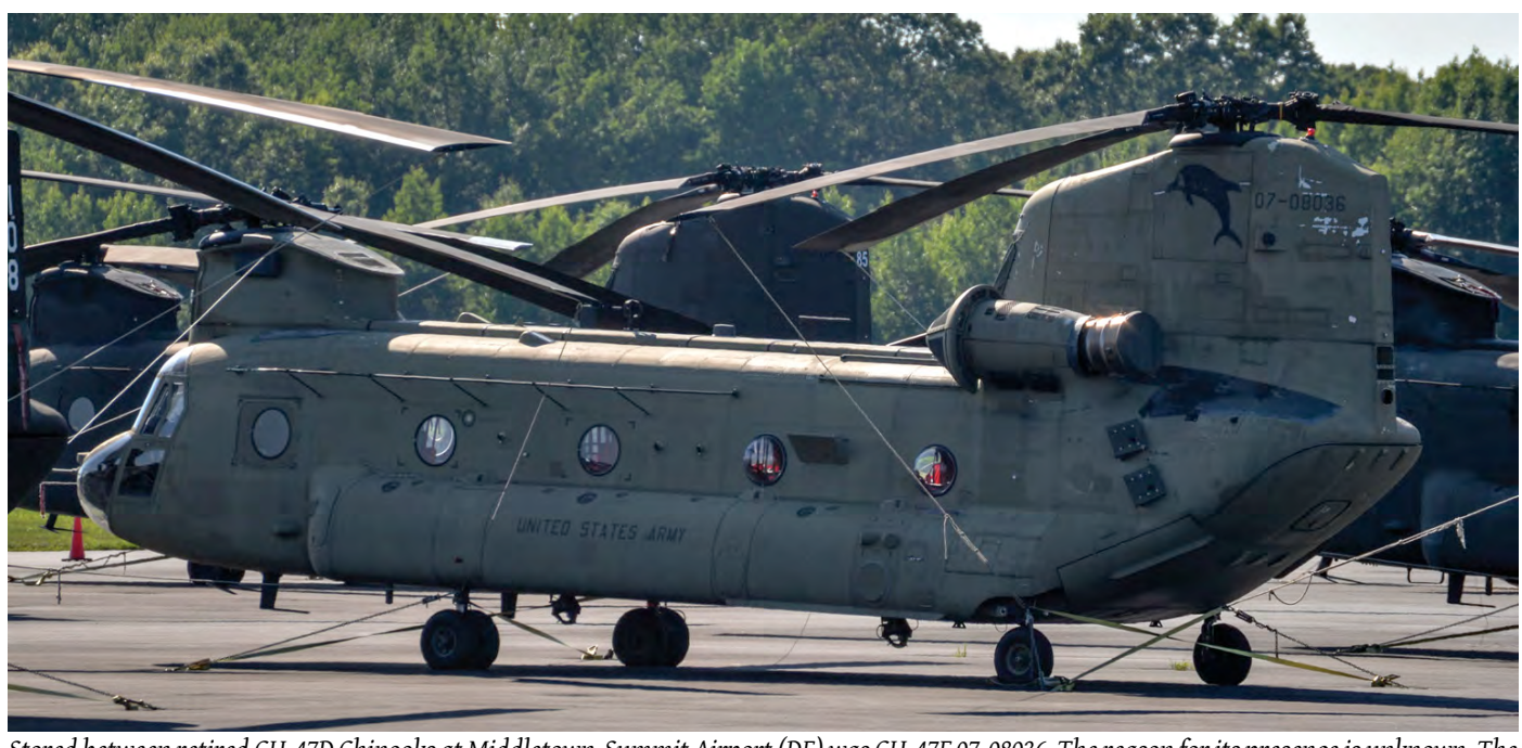
Stored between retired CH-47D Chinooks at Middletown-Summit Airport (DE) was CH-47F 07-08036. The reason for its presence is unknown. The black dolphin on the rear pylon identifies B/3-82nd AVN from Fort Bragg (NC) as its previous unit. (9 July 2017, Erik-Jan Engelen)