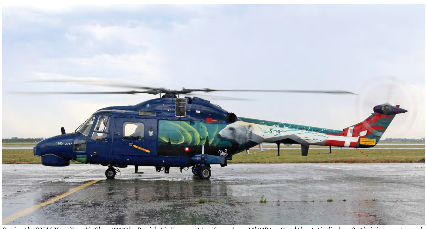
During the RNAS Yeovilton Air Show 2017 the Danish Air Force sent two Super Lynx Mk90B to attend the static display. On their journey towards the UK both refueled at Ostend where Nik Deblauwe captured S-191 with the special markings on 6 July 2017.