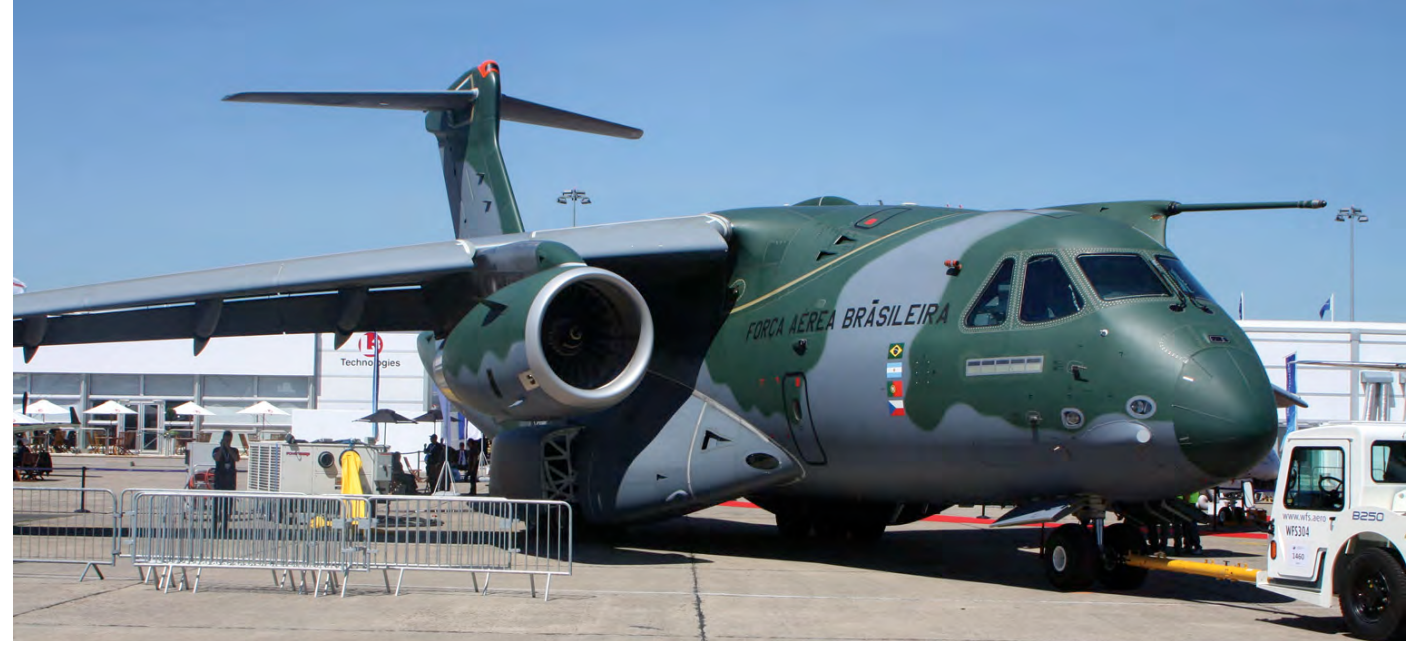
Although painted in the colours of the Brazilian Air Force, with roundel and all, PT-ZNJ is the second prototype of the Embraer KC-390 and (still) owned by Embraer Aircraft. It was one of several aircraft with which Embraer was present at this years Le Bourget trade show. (Paris-Le Bourget, 19 June 2017, Jaap Dijkstra)