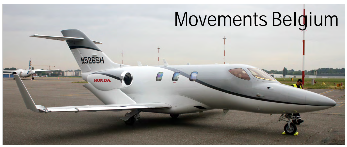
On 29 May 2017 this Hondajet departed Piedmont Triad International Airport for a two-day trip to Europe. N526SH attended the 2017 Paris Air Show and is another demonstrator being operated by Rheinland Air Service, the Central Europe HondaJet dealer. (Antwerp, 27 June 2017, Walter Van Brempt)