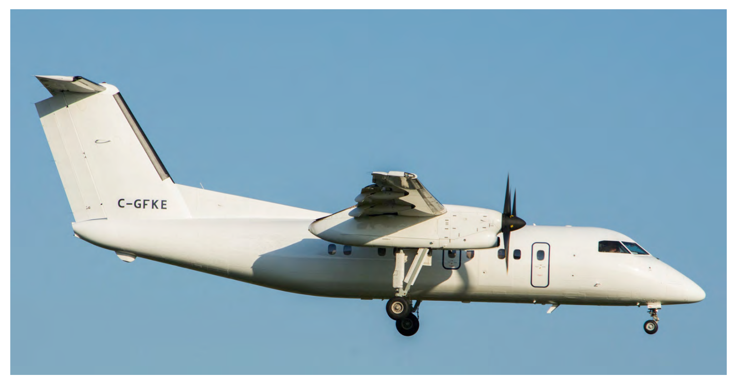
This Dash 8 was initially delivered to Mesaba Airlines in August 1993. Five years later the aircraft went to Argentina. In April 2003 it returned to Canada. It was converted from a 102A type into a 103 type and subsequently delivered to Island Air. United Airways in Bangladesh added the aircraft to its fleet in 2007. Six years later it ended up in Indonesia. As C-GFKE it ended up with Inter-Aero in April 2017. The aircraft was ferried to Africa via Europe when this photo was taken. (Rotterdam-The Hague, 10 June 2017, Gideon van Dijk)