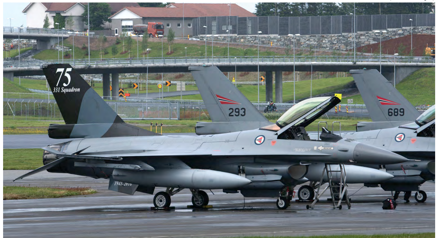
During the Stavanger Sola airshow held 12 June 2017, the Norwegian Air Force brought some F-16AM/BMs to the show. Peter Rozendal captured 277 with the minimal 75 years jubilee markings of 331 skv.