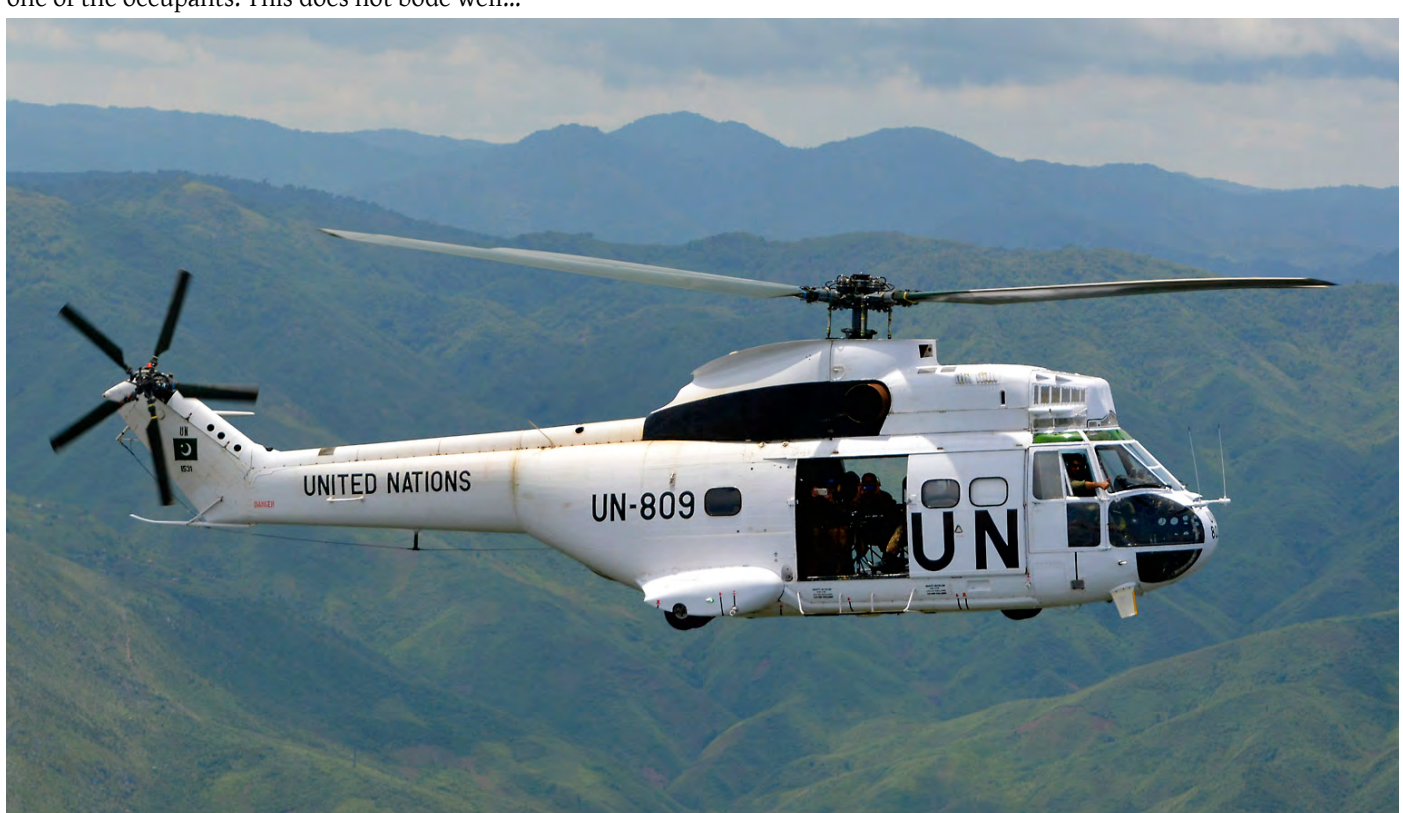
A Pakistan Army Aviation Puma, operating on behalf of United Nations Organization Stabilization Mission in the Democratic Republic of the Congo MONUSCO, crashed on take-off from Kavumu, DRC, on 12 April 2017, which we forgot to mention. It is seen here inflight during an aerial surveillance mission, carried out by the MONUSCO Force in far-flung areas of DR Congo to ensure the security of the civilian population. (7 March 2016,)

Credits: ASN, Aviation Herald, JACDEC, B3A, FAA, Starnieuws