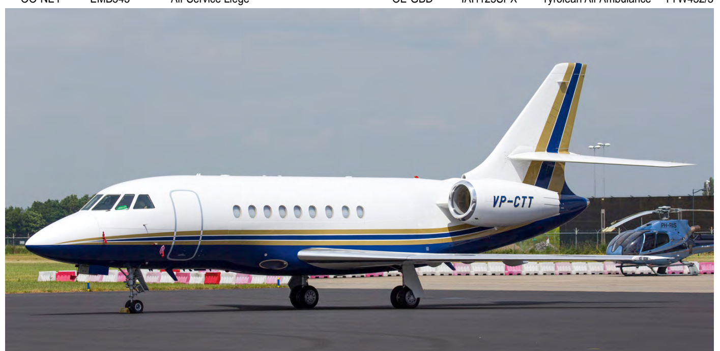
Untill April 1998 VP-CTT was a Falcon 900B. In 2008 a Falcon 2000EX appeared registered as VP-CTT. The aircraft is being operated by Bonel Marketing. (Rotterdam-The Hague, 8 June 2017,)