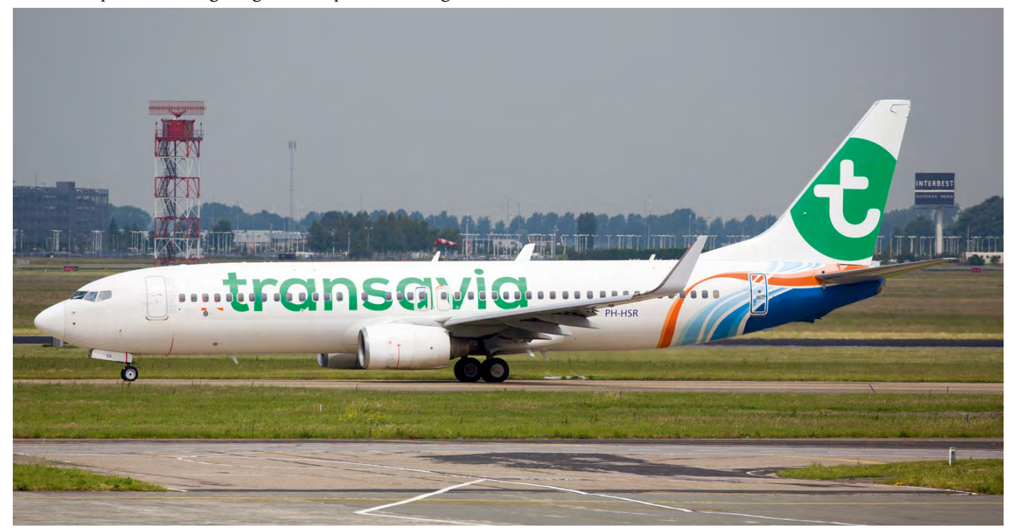
For the busy summer season Transavia leases this flyDubai Boeing 737-800 A6-FDF. The aircraft arrived at Schiphol on 9 June and the flyDubai titles and tail colours were replaced by those of Transavia and the aircraft was registered in the Dutch register as PH-HSR. Only the colours on the backside of the fuselage now reveal its original UAE identity. (Amsterdam-Schiphol, 15 June 2017, Maarten Visser Sr.)

Credits: Inspectie Leefomgeving en Transport, ballonregister.nl, airnieuws.nl.