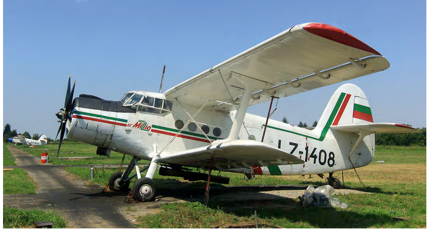
Emil Dyulgerov was present on 19 July 2017 at Grivitsa, Bulgaria, to take a picture of Antonov 2 LZ-1408 in Air Mizia colours. It has been flying around with this registration since 18 July 1994. In the background you can see Antonov 2 LZ-1233, also part of the Air Mizia fleet.

is a link to the Soviet Transports downloads page featuring a new illustrated guide to ST construction numbers. It can be downloaded free of charge together with more than sixty production lists and a list of abbreviations and (location) translations and a Google Earth KMZ file with all airports in the Soviet Transports database.