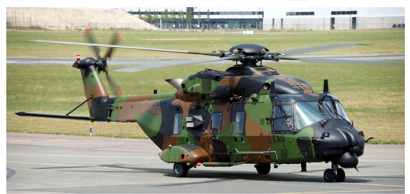
Every Paris Air Show will guarantee new French Army NH90-TTHs. During the 2017 edition 1334/EAU visited the show. (Paris-Le Bourget, 20 June 2017)