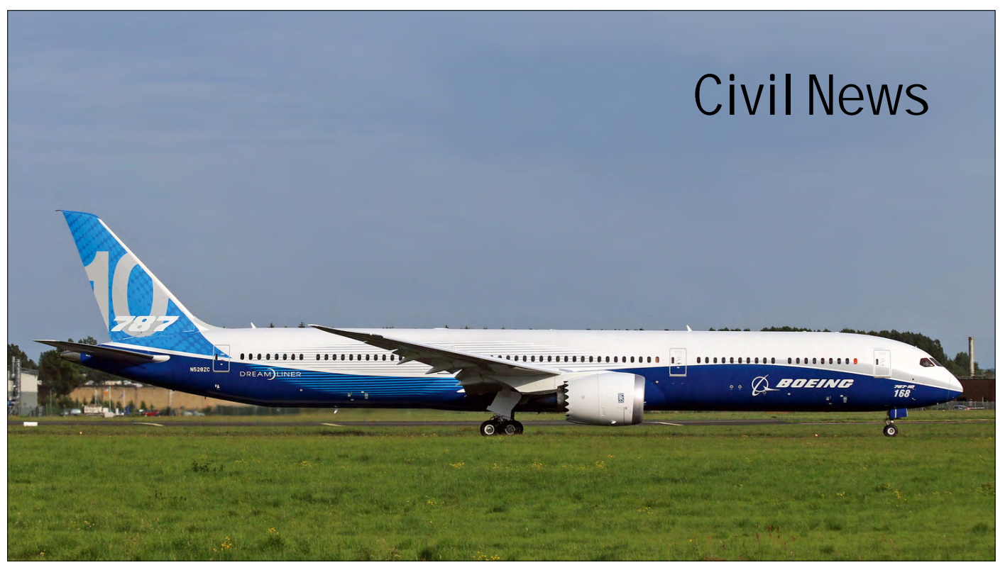
The Boeing 787-10 was one of the highlights of this year's Paris Air Show. It was a pity that the aircraft was only present for the first two days and already left the city of light on Tuesday. On its way back to the USA Boeing 787-10 Dreamliner N528ZC made a fuel stop at Shannon. (20 Iune 2017. Malcolm Nason)