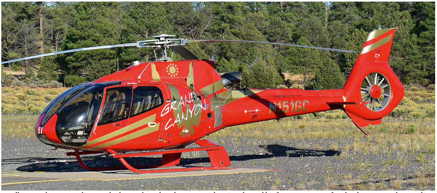
Papillon Grand Canyon Helicopters had to send another chopper to pick up its pilot and his four passengers, after the chopper struck power lines and had to make a forced landing near the Hoover Dam (AZ), during which it sustained substantial damage. N151GC is seen here basking in the Arizona sunlight on 22 October 2016 when Walter Heukensfeld took this picture at Grand Canyon-National Park.

RA-31024 Ka-32S The Russian Kamov 32T of Avialift Vladivostok crashed while attempting to take in water into its bucket, from the Tahtali reservoir, Izmir Province, Turkey. Out of the five persons onboard only one received injuries.