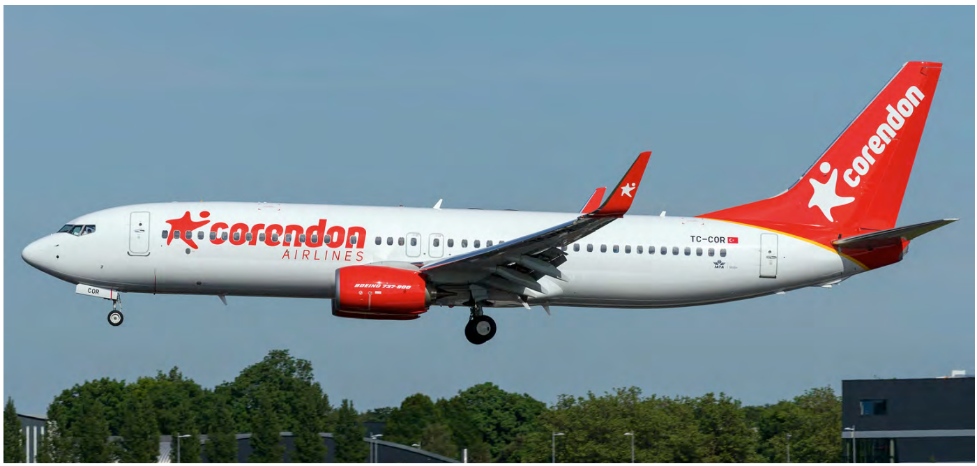
On \ 11 \ May, Corendon \ took \ delivery \ of \ this \ brand-new \ 737-800 \ TC-COR. \ It \ was \ the \ first \ time \ Corendon \ took \ delivery \ of \ a \ factory \ fresh \ aircraft. The Boeing also features the slightly revised colour scheme. (Brussels, 1 June 2017,)