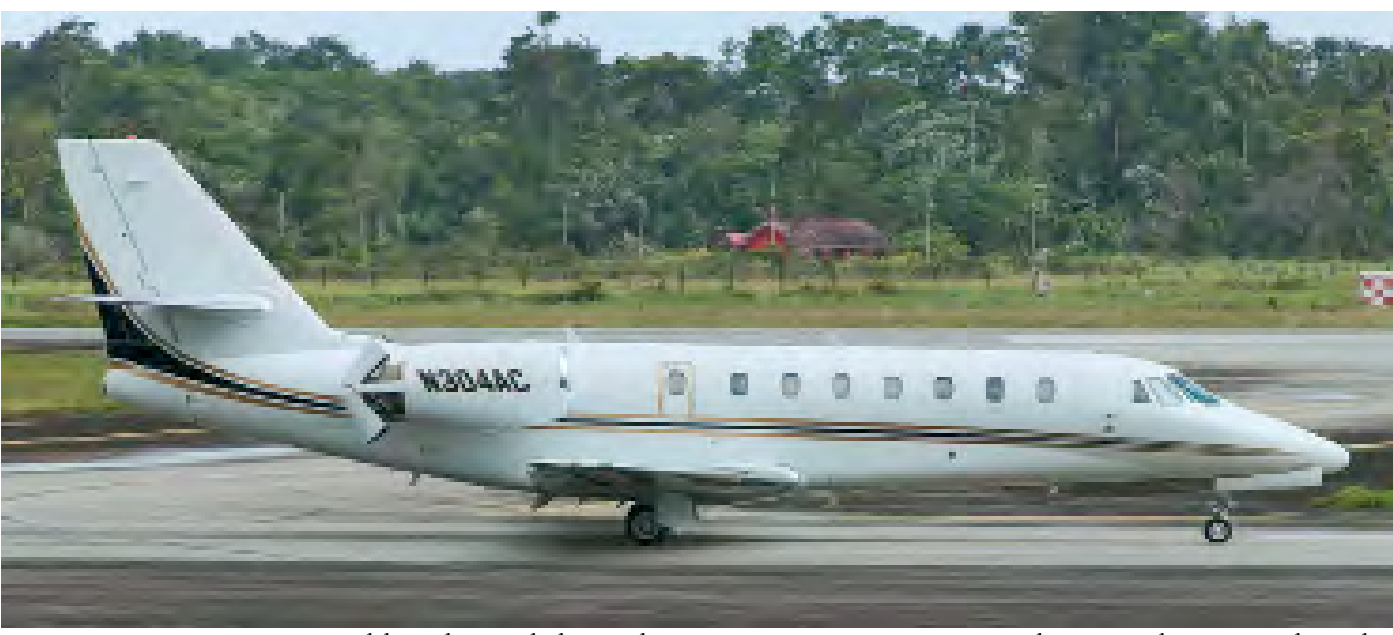
N304AC is a 2004 Cessna 680. It was delivered to Anadarko Petroleum in 2005 as N565A. In August 2014 the registered owner was changed to Cottonwood Aviation. In February 2015 the registration was changed to the current one. The FAA has it registered to Cottonwood Aviation at George Bush Intercontinental Airport. It is being managed by the company for the Apache Corporation (an oil and gas exploration and production company). (Paramaribo, 16 May 2017,)