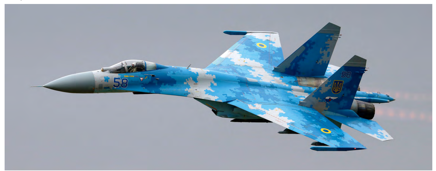
The Ukrainian Air Force returned this year with two Su-27s and an Il-76. The single seater performed a flying display, for many one of the highlights. (Fairford, 16 July 2017, Toon Cox)