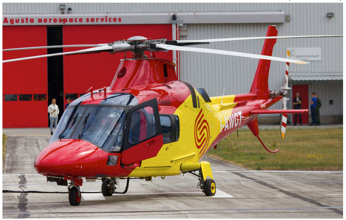
This Agusta A109E has been at the Agusta facility for a while now still in the colours of its first operator, Schenk Air. This is the first photo with its Italian registration. The Belgian registration OO-DIX was cancelled on 10 April 2017. It is very well possible that the factory registration is the start of a new and active career for this helicopter. (Liège, 26 June 2017,)