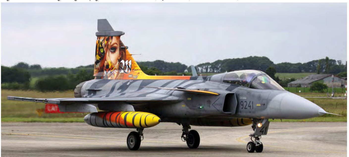
On two separate days during the Tiger Meet spotters were allowed on the base. Czech JAS39C Gripen 9241 of 211SQN demonstrated an impressive Tigers colour scheme. (Landiviseau, 8 June 2017,)