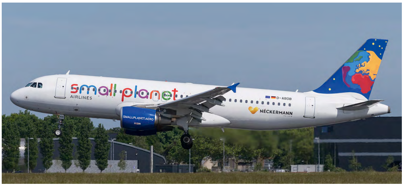
This summer Small Planet Germany has based an Airbus A320 at Schiphol, operating charters for Neckermann. After a few weeks they finally placed a sticker on D-ABDB as can be seen in this photo. (Amsterdam-Schiphol, 1 June 2017)