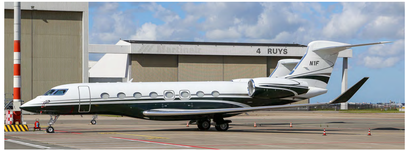
This Gulfstream G650 was delivered to Hunter Creek Aviation as N650JH in 2014. The current operator of N1F is Gulf States Toyota, part of the Friedkin Group. (Amsterdam-Schiphol, 26 June 2017,)