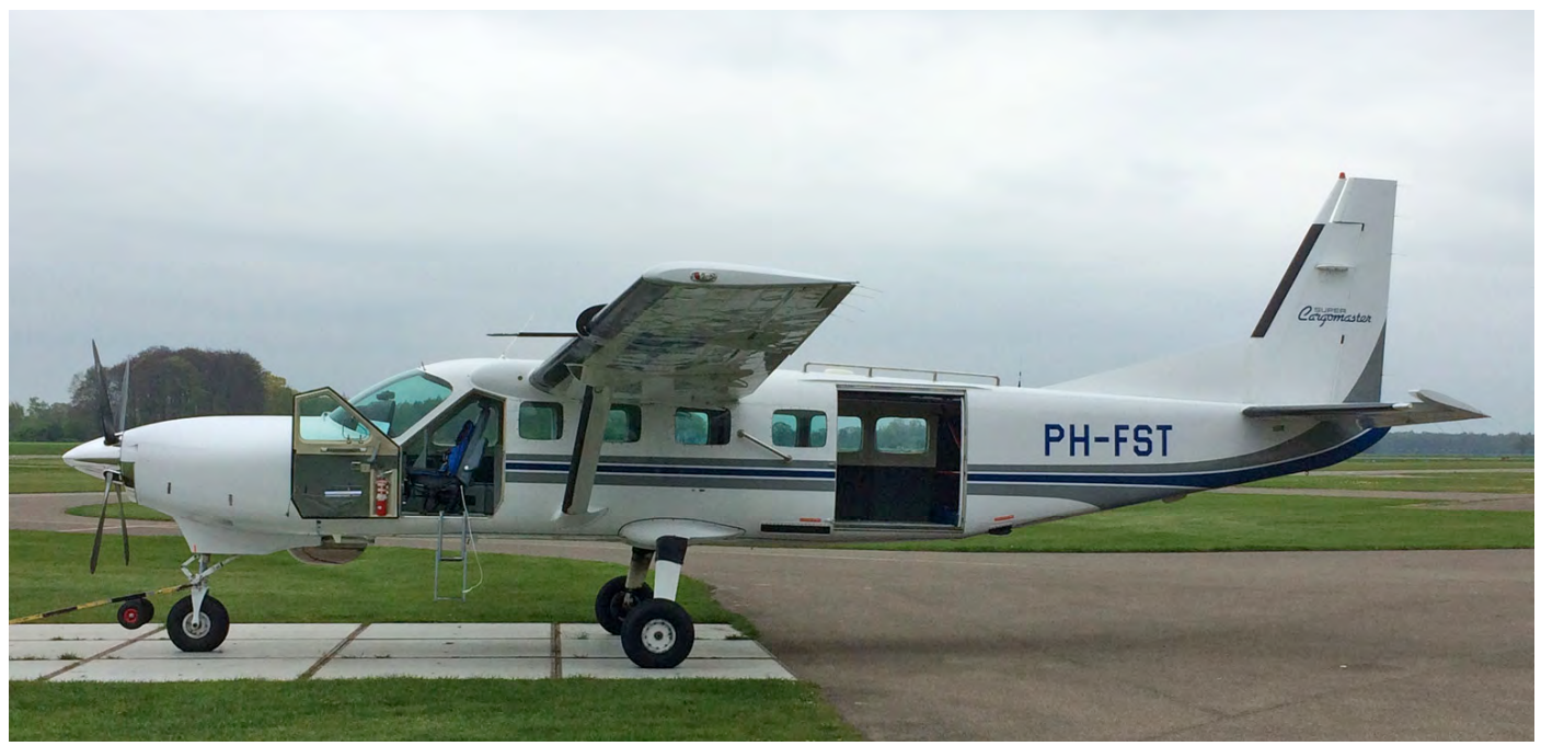
This March 2000 built Cessna 208B was ferried to Teuge on the last days of March 2017. On April 5 it departed to Germany for a Skydive kit installation still with its US registration. The aircraft returned on 3 May with its Dutch registration. It was repainted in the company colours a few days after this photo was taken. (Teuge, 5 May 2017,)