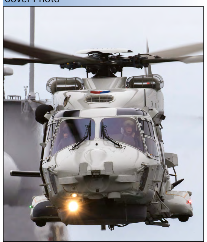
Sander Meijering captured N-233 during the Navy Days in Den Helder on 24 June 2017. This NH90-NFH is a de-scoped version, noticable by the missing FLIR, lack of sensor bulbs and missing cable cutter above the cockpit.