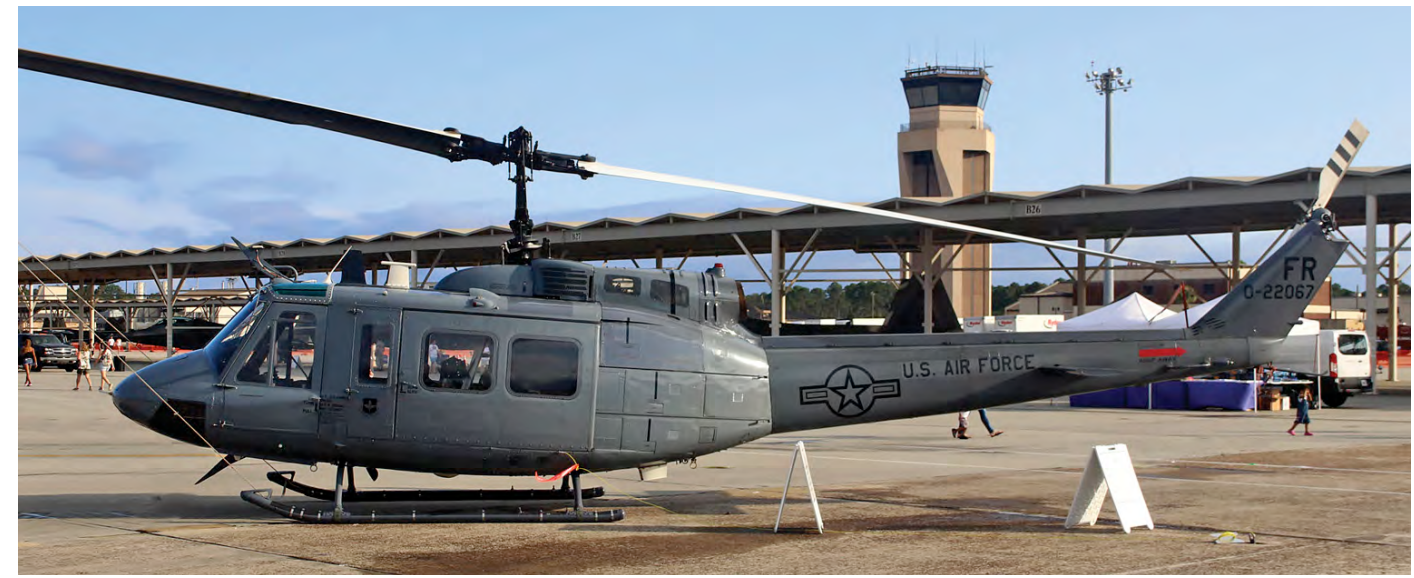
Also part of the static at the Tyndall AFB (FL) Open House & Airshow was TH-1H 73-22067/FR. The helicopter is assigned to the 23rd Flying Training Squadron at Fort Rucker (AL). (23 April 2017, Ramon Berk)

Related to the above Galaxy news comes the fact that C-5M with serial 87-0037 became the first Super Galaxy to be assigned to the Air Force Reserve Command's 439th Airlift Wing at Westover Air Reserve Base (MA) on 2 June 2017. A total of eight C-5Ms should be in place with the 439th Airlift Wing by the summer of 2018. The last ever C-5B Galaxy in the USAF inventory, with serial 87-0043 and characteristic howling engines, left Westover ARB for the Lockheed Martin Marietta (GA) facilities on 18 Jan 2017 to get its second life as a modernized C-5M. The Super Galaxy is a re-engined version of the U.S. military's largest aircraft. Along with