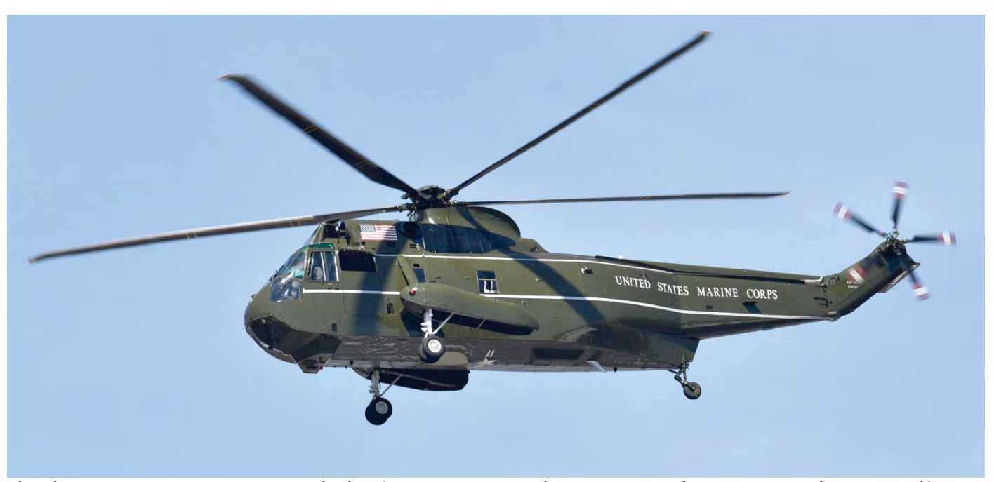
The sole UH-3D in USMC service was assumed to be wfu as it was not reported active since December 2009. On 10 April 2017, Tim Wolfe was at Andrews AFB when 154121 appeared again while operated by HMX-1. Its VIP-livery is different compared to the "whitetops" VH-3Ds in use with the unit.

two legacy F/A-18A/C squadrons. But the heavy wear from at least twenty years of combat operations on the Hornet fleet, budget cuts and pressures in their service life extensions programs, and eventually also the much written delays in the fielding of the F-35C Lightning II have led the Navy to procure more Super Hornets to close a gap in the strike fighter inventory. Some carrier air wings now are equipped with four Super Hornet squadrons. The first F/A-18 squadron scheduled for transition to the F-35C is VFA-147 Argonauts ('NH-2xx') at NAS Lemoore (CA). The F/A-18E squadron is planned for the transition in 2018.