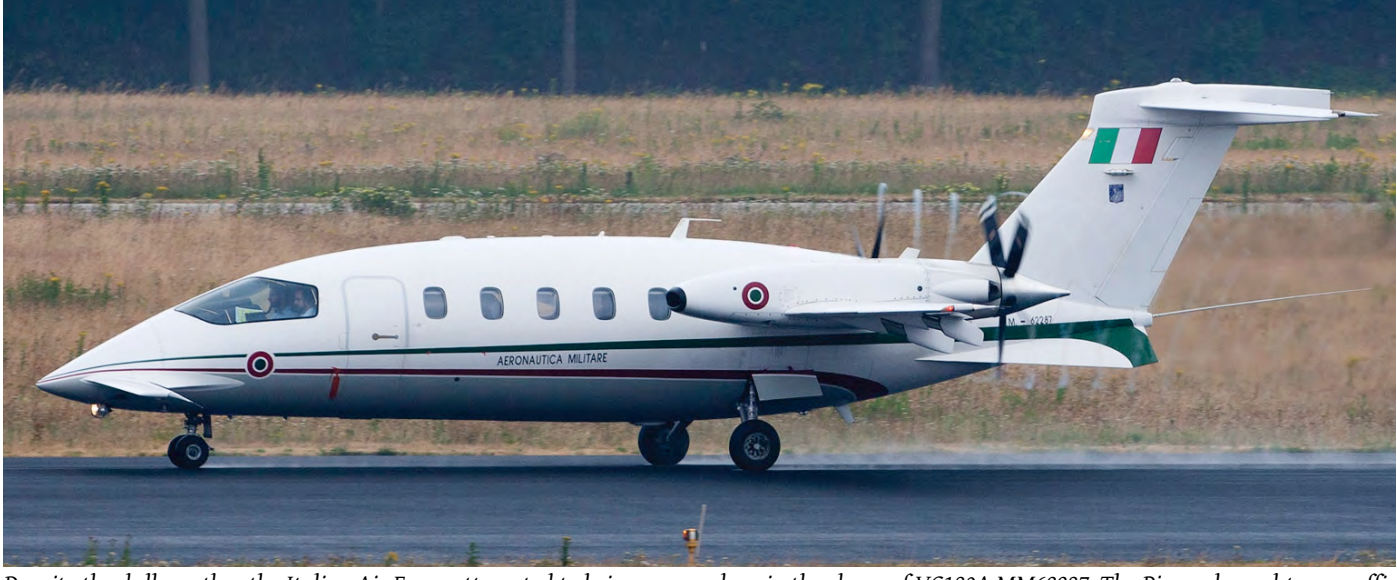
Despite the dull weather the Italian Air Force attempted to bring some colour in the shape of VC180A MM62287. The Piaggo brought some officials for the EATC change of command and is seen here departing Eindhoven in the afternoon. (28 June 2017, Manolito Jaarsma)