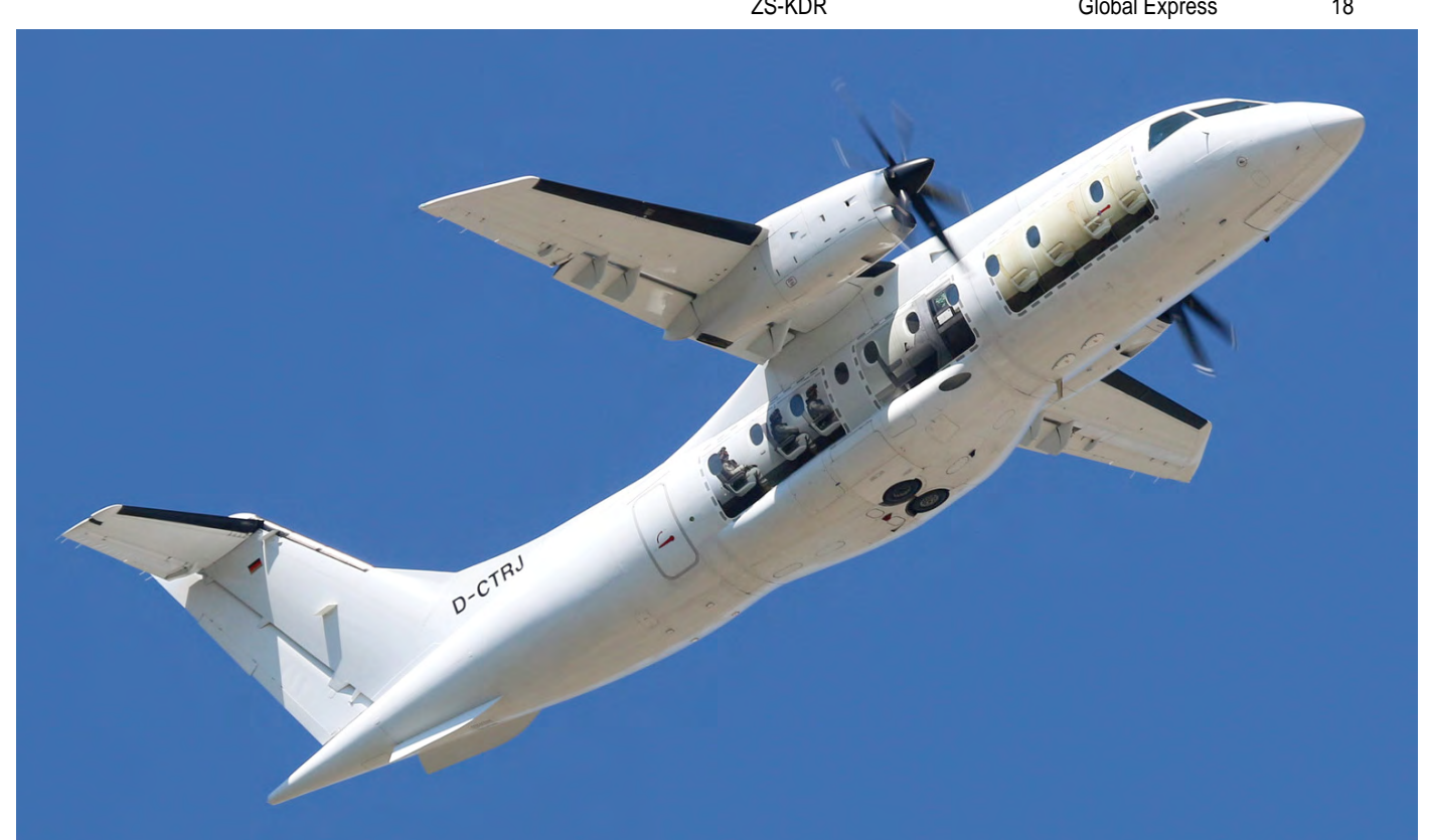
328 Support Services is the type certificate holder for the Dornier 328 following the demise of Fairchild Dornier. As the name suggests the company provides support to all owners of Dornier 328 aircraft and was present at the show with two aircraft. VH-PPG, which was provided by the Australian Aerorescue, and D-CTRJ, being the fifteenth built Do328. (Paris-Le Bourget, 18 June 2017,)