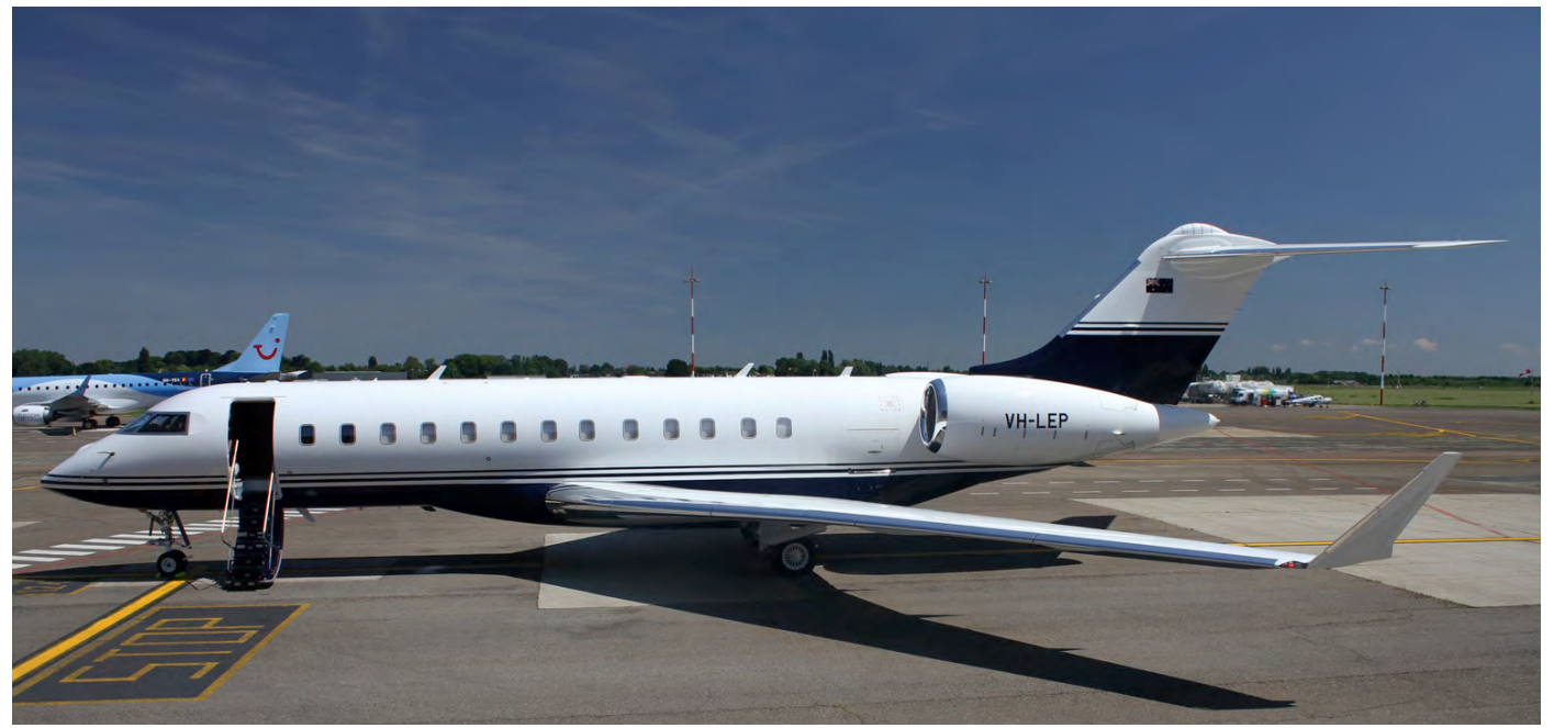
This Global 6000 is the third aircraft operating with registration VH-LEP. The aircraft is owned by Linfox Global Charter and operated by Air National Australia. (Antwerp, 1 June 2017,)