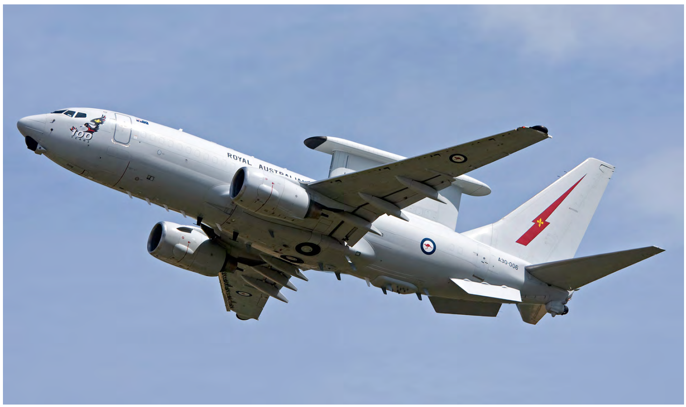
Another first was the visit of this E-7A Wedgetail of the Royal Australian Air Force. A30-006 is seen here during its departure, but it stayed in the UK, conducting several local missions from RAF Waddington in the following days. (Fairford, 17 July 2017, Rene Liebe)

Credits: Ben van Hemert, MSF, NAMAR, Scramble messageboard.