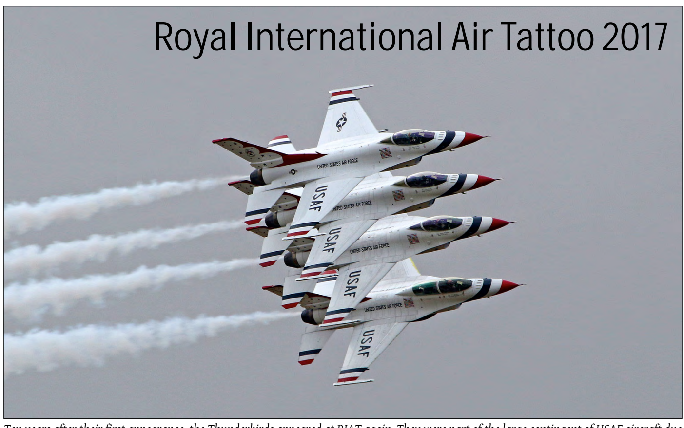
Ten years after their first appearance, the Thunderbirds appeared at RIAT again. They were part of the large contingent of USAF aircraft due to their 70th anniversary. (Fairford, 15 July 2017, Gerben van den Bosch)