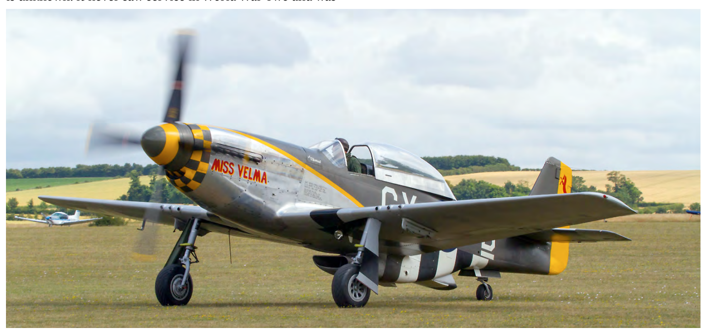
Mustang 'Miss Velma' of the Anglia Aircraft Restoration had to make a forced landing in a field near Duxford, close to Junction 10 of the M11 Motorway, under unknown circumstances on 9 July 2017. It received substantial damage. (Duxford, 12 July 2015)

11jul17 15102 Yak-130 130.12.02-0102 w/o 21sq of the Bangladesh Air Force lost a Yak-130 trainer after it crashed in the remote area of the south-eastern district's Lohagara, near Bara Hatia's Faridghona, on a lychee farm. Both pilots ejected safely and the reason for the mishap was a technical malfunction. It had earlier taken off from BAF Base Zahurul Haque in Chittagong for a training sortie.