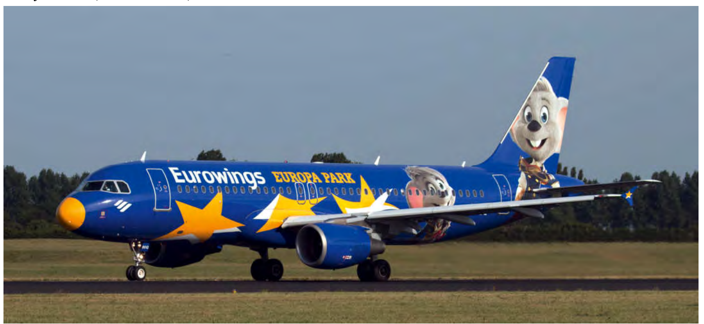
The last picture on this 'commercial' page is Eurowings' Airbus A320 D-ABDQ. It promotes Euro Park, Germany's biggest theme park. (Amsterdam-Schiphol, 21 June 2017, Remco de Wi Personal copy