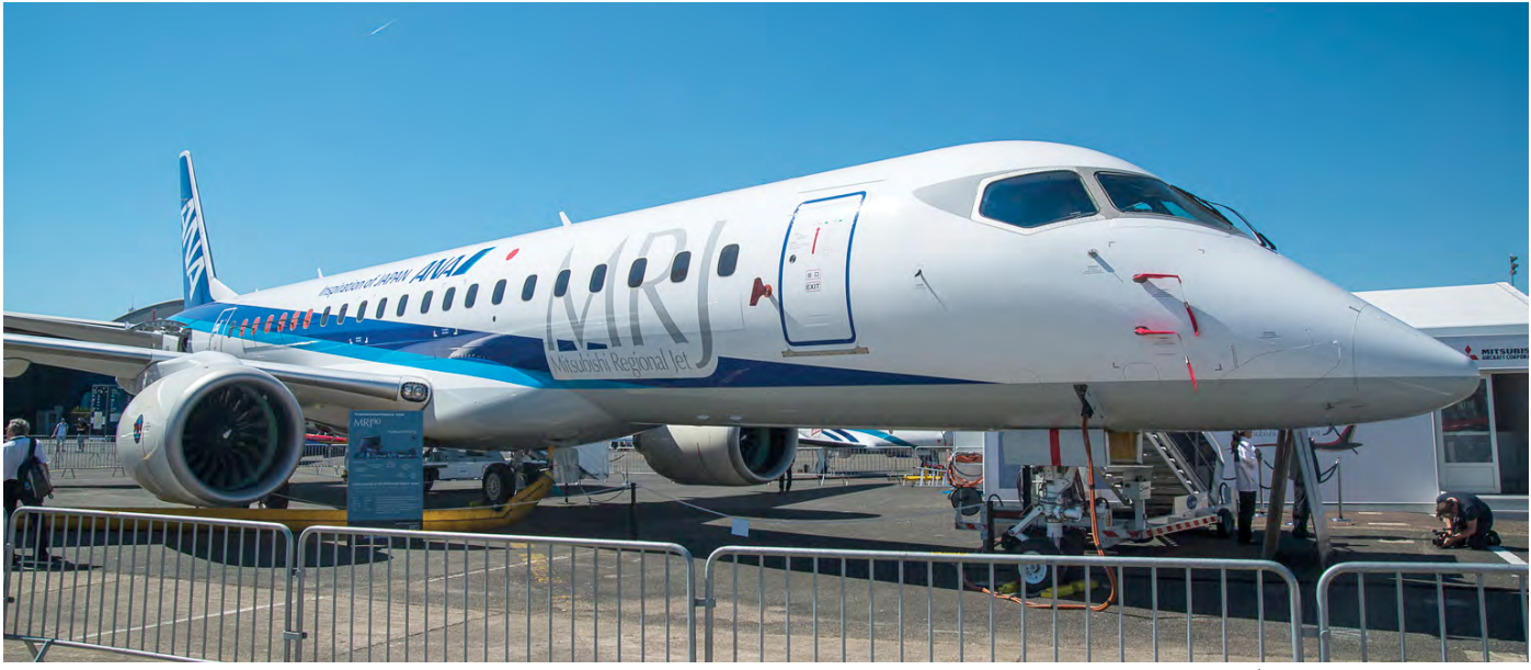
Another first timer for Paris is the Mitshubishi Regional Jet or MRJ. JA23MJ has been painted in the colours of ANA. (Paris-Le Bourget, 19 June 2017,)