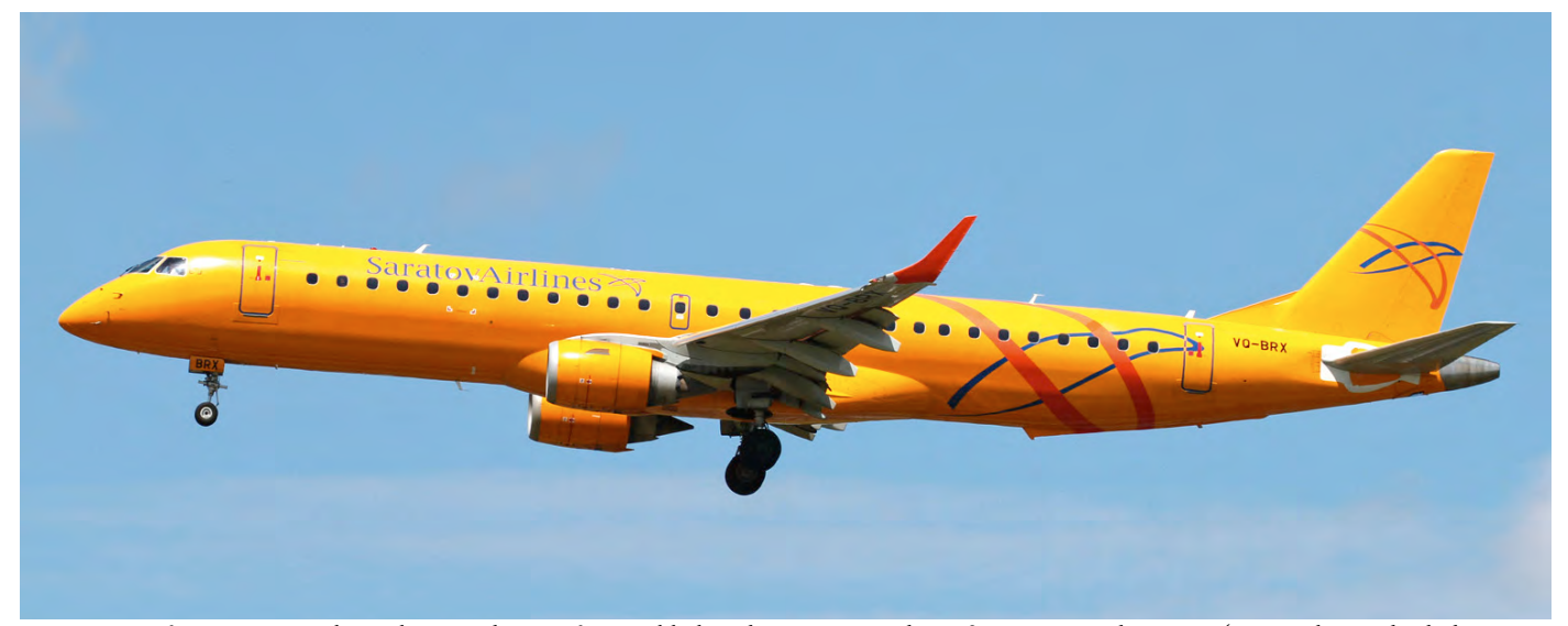
VQ-BRX is a former NAS and Windrose Embraer. If was added to the Saratov Airlines fleet in December 2013. (Amsterdam-Schiphol, 13 June 2017,)