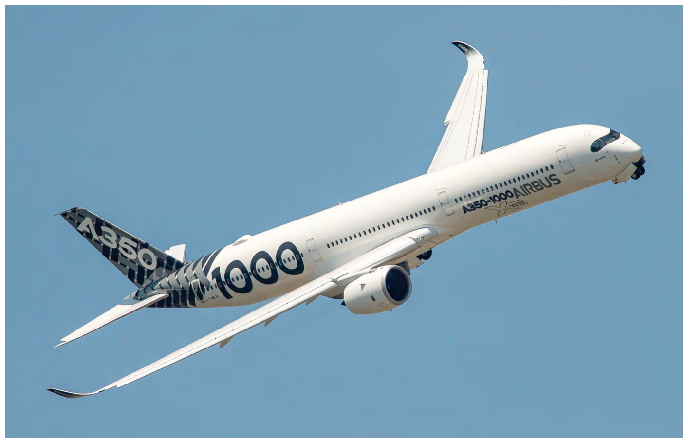
F-WLXV is the second A350-1000 prototype to come off the assembly line. During the week the aircraft gave an impressive performance, showing off its sleek lines and its incredible flight characteristics. (Paris-Le Bourget, 19 June 2017, Leo Hoogerbrugge)