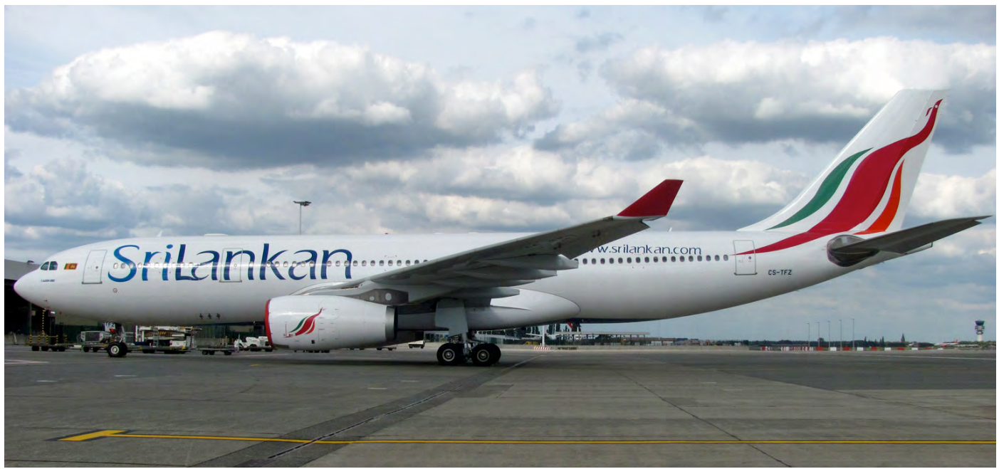
This HiFly Airbus A330-200 was planned to be delivered to SriLankan Airlines and to be registered as 4R-ALS. However this deal fell through and the Airbus never made the delivery flight to Colombo. On this picture the Airbus is painted in full SriLankan colours but still with its Portuguese registration. Early July the aircraft was already seen all white operating for Jet2 and on 17 July HiFly placed the aircraft with Garuda for a Hajj lease. (Brussels, 16 June 2017, Eric Vangeel)