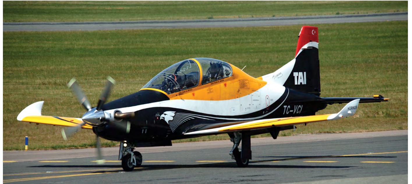
During the Paris Air Show TAI promoted and displayed their Hürkus-B NextGen trainer. The Turkish Army ordered fifteen with deliveries starting soon and has an option for fifty more. (Paris-Le Bourget, 20 June 2017, Rob Vogelaar)