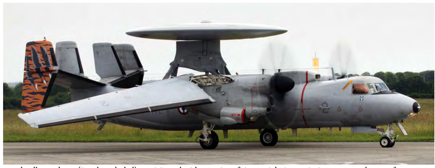
Nearly all squadrons (Dutch excluded) participated with one aircraft in special Tiger paintings. E-2 Hawkeye 2 of 4F was one of them. (Landiviseau, 8 June 2017, Mark Broekhans) Personal copy