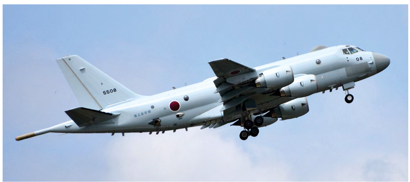
The Kawasaki P-1 made her European mainland debute at Paris. Prior to the flying display some rehearsal flights were made. Steve Jerrim captured 5508 during its final rehearsal on 18 June 2017.