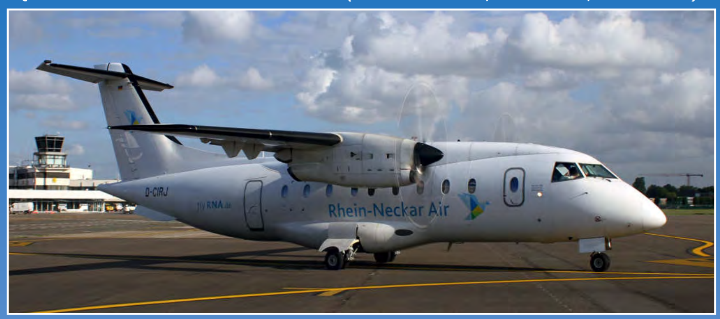
Mannheim based Rhein-Neckar Air flies scheduled flights to Berlin, Hamburg and Sylt but also charters. Their three-strong Dornier 328 fleet is operated by MHS Aviation. (Antwerp, 16 June 2017, Walter Van Brempt)