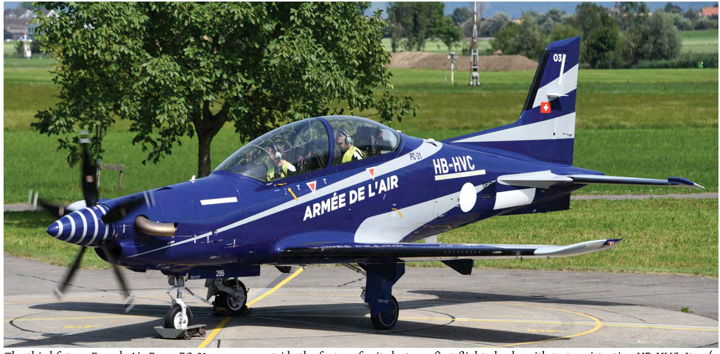
The third future French Air Force PC-21 was seen outside the factory for its last pre-first flight checks with test registration HB-HVC. Its c/n 295 is seen on the nose-wheel bay door and FAF serial 03 on the tail however the French roundel and code are taped over. (Stephan Widmer)