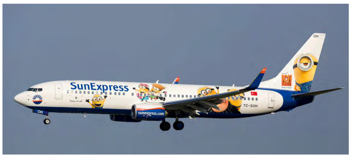
Turkish Sun Express is promoting the movie Despicable Me 3, in German language Ich – Einfach unverbesserlich 3, on Boeing 737 TC-SOH. (Amsterdam-Schiphol, 20 June 2017, Maarten Visser Sr)