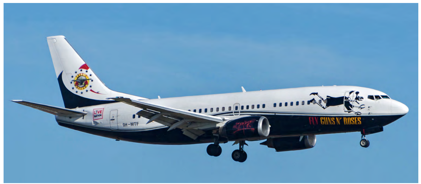
For part of their "Not In This Lifetime Tour", Guns N Roses has leased a Maleth-Aero Boeing 737 adorned with appropriate stickers. 9H-MTF is part of the Maleth-Aero fleet since September 2013. (Brussels, 23 June 2017,)