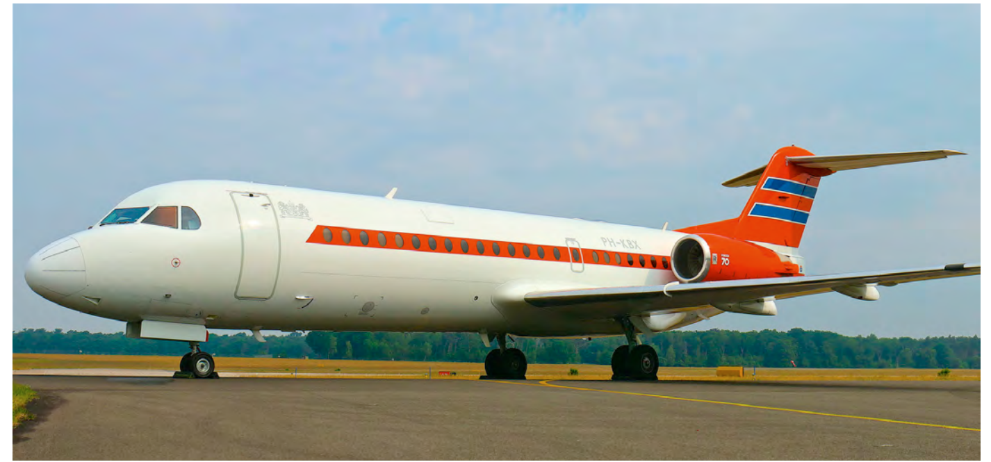
The general public had one opportunity to see the former government aircraft PH-KBX on 3 June 2017. Pascal Lamberiks was one of the visitors to photograph the Fokker 70 before it is being ferried to Australia for its next operator. (Woensdrecht)