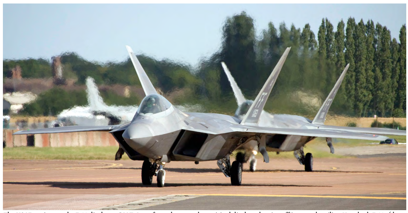
The USAF again sent the F-22 display to RIAT. It performed yet another spirited display, showing off its superb agility. Here both F-22s (demo aircraft and spare) are seen taxiing for departure at Fairford. (17 July, Simon Titchmarsh)