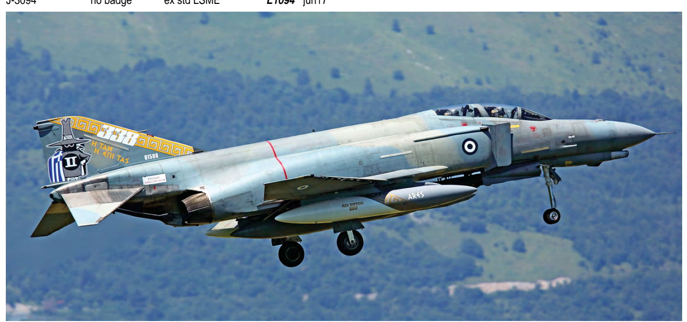
Dietmar Fenners booked a day trip to Italy to see specially marked F-4E (AUP) 01508 returning home to Andravida from Fairford, again using Aviano for a fuel stop now on 17 July 2017. This was the third time a duo of Greek F-4s attended a show or exercise in western Europe in 2017.