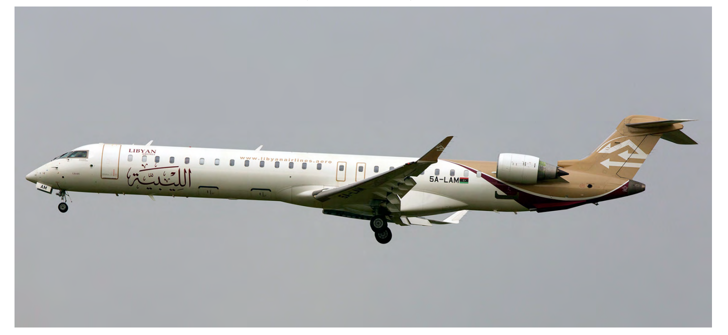
Libyan Airlines took delivery of this CRJ900LR in December 2010. The aircraft was placed in storage at Malta on 10 June 2014 and ferried to Cologne for continuous storage on 1 August 2015. It was ferried back to Mitiga in Libya and returned to service on 23 May 2017. It paid a visit to Amsterdam-Schiphol on 30 June 2017.