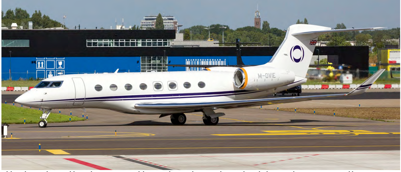
Although it might seem like it, the registration of this G650 does not have anything to do with the movie business. It is owned by Ineos Group, a Switzerland based chemicals manufacturer, who also own a Falcon 2000LX, two G280s, a G550 and an AW139. M-OVIE was added to the fleet in May.