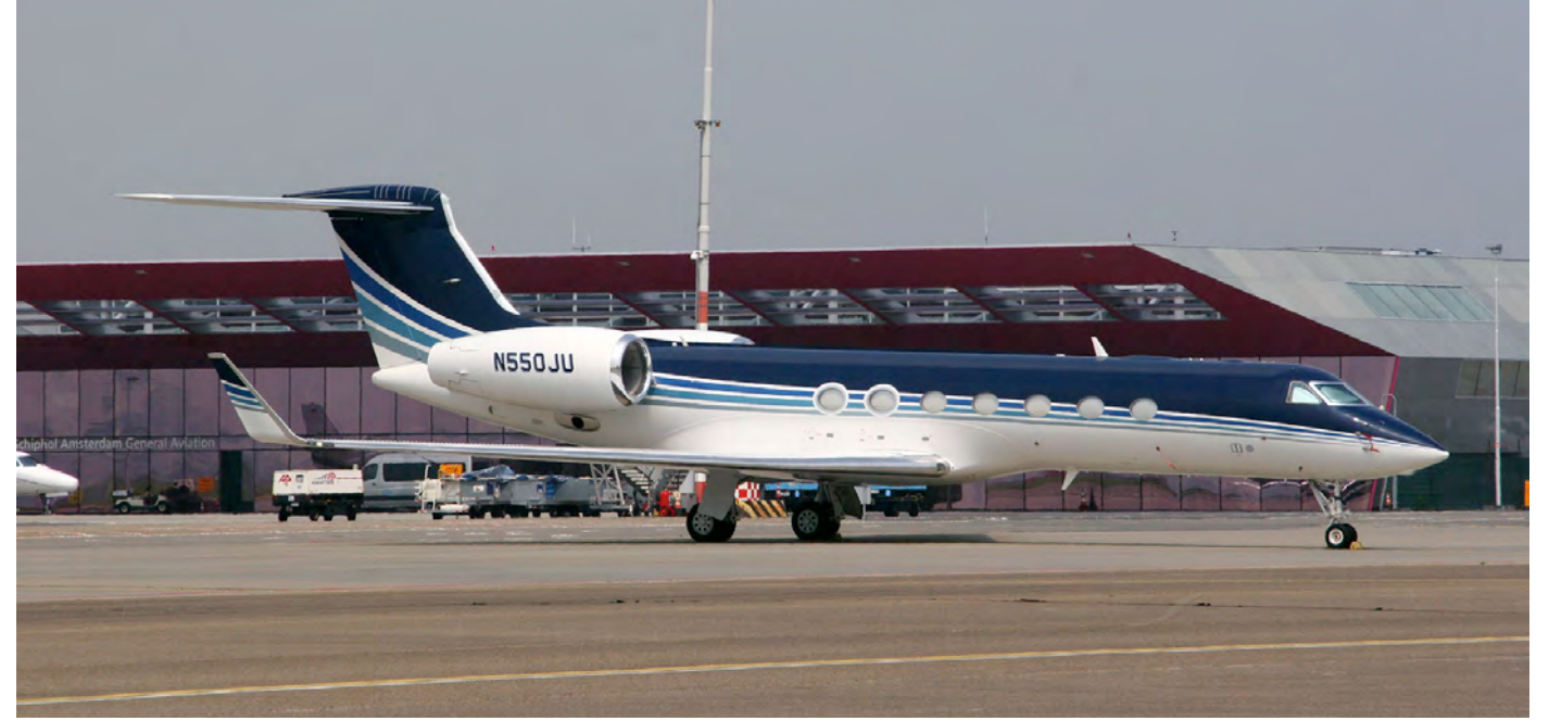
This Gulfstream G550 is registered to TVPS ARS, one of a few common trustees in the United States. It is most likely still operated by Global Management Consulting Ltd. (Amsterdam-Schiphol, 7 July 2017,)