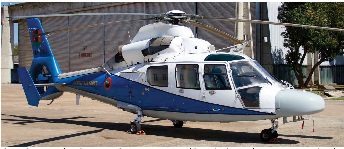
Chinese influences in Zambia is also apparant in the Air Force. AF741 is a Z9 and this Dauphin clone is used as a VIP transport in a civilian colour scheme. (Lusaka/Kenneth Kaunda Intl, 26 May 2017, Paul Mali)

Mi-171E LH92760 77nd Brig jun17 Mi-171E LH92109 77nd Brig jun17 Z9WA LH99941 79th Brig photo